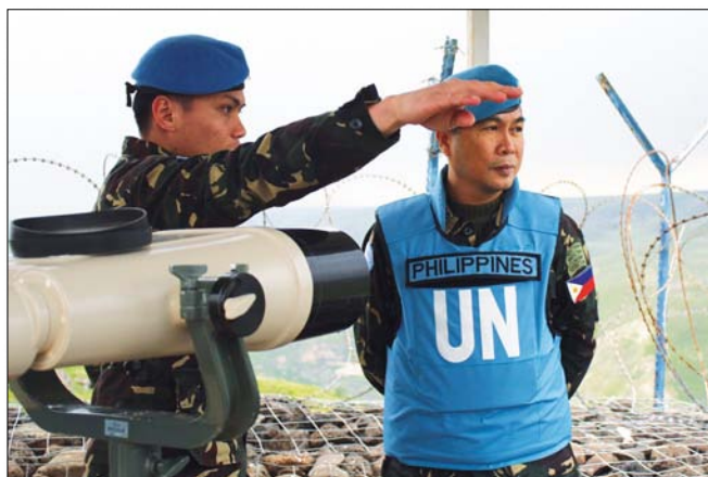
Line Tour in the Area of Responsibility