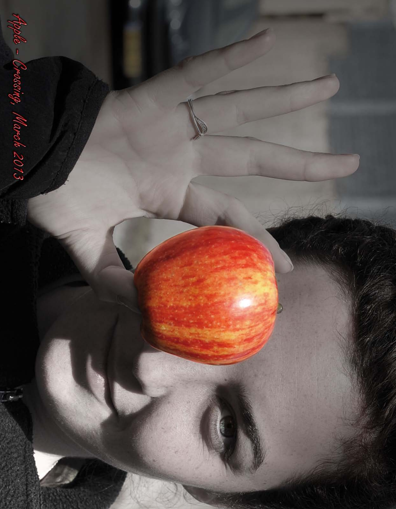
Apple - Crossing, March 2013