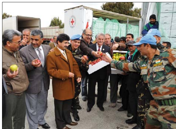
The precious goods arrived at B-Side

The apples mainly come from Druze famers on A-Side, who sell the over-production to Syria.