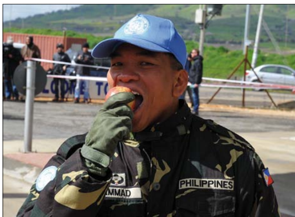
A juicy fruit for CLPIO