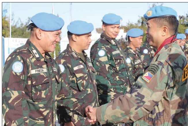
Welcome in Camp Ziouani