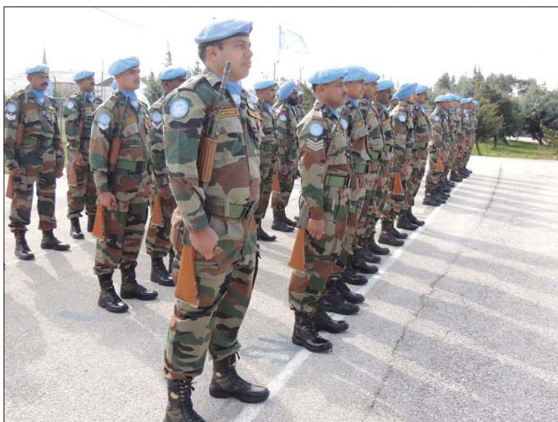
Indian Guard of Honor at the Medal Parade

The euphoria of having accomplished a mission and being recognized for the same, is an inexplicable feeling for any soldier. Soldiers across the world derive immense motivation from an inch long ribbon and inch wide piece of metal, pinned to their chest in recognition of their selfless service to any cause they are assigned to. The beauty of UNDOF medal brings out the essence of the mission in the depiction of the mandate and the geography of the mission area in an artistic blend of superlative quality.