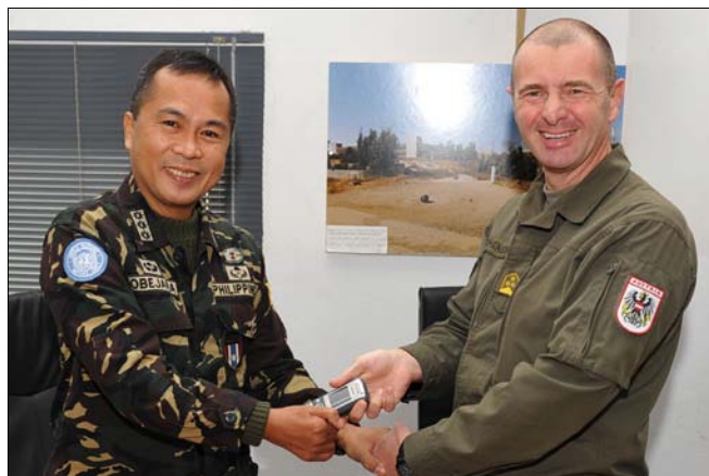
Taking over the COS mobile and going operational