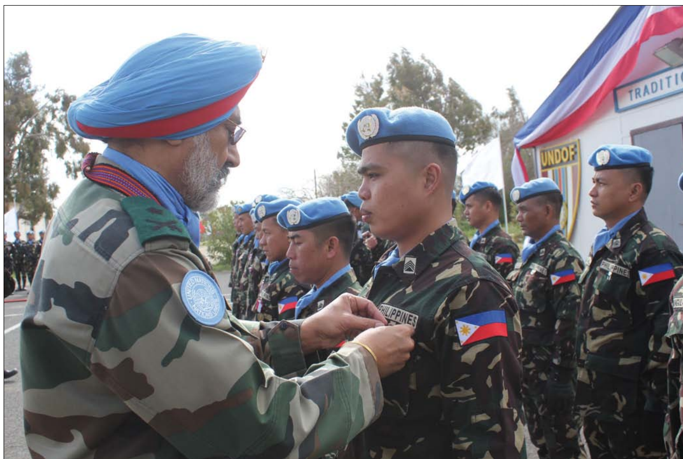
The UNDOF medal, awarded by the Force Commander

Members of the 6 th Philippine Contingent, also known as the 'Professional Peacekeepers' proudly received the UNDOF Medals during Medal Parade Ceremony on 23 rd Mar 2013 held at Camp Ziouani.