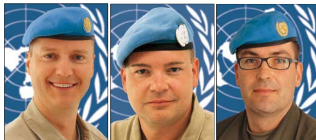
The Editorial Staff of Golan Journal 134

Nevertheless I am proud to present you 'slightly delayed' this edition of the Golan Journal with special