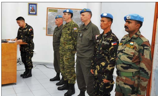
The awarding ceremony in the Pentagon

It also comprises commendable deeds related to service support such as provision of excellent communications system for effective Command and Control and undertaking of some infrastructure projects in UNDOF. On the other hand, good administration and management