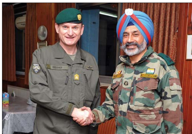
LtGen Franz Reissner, Commanding General of Austrian Joint Forces, visited Posn 22 and met with FC UNDOF in Camp Ziouani (13 th - 14 th Mar 2013)

• Col Kazumichi Tsurumura, Supply Chief of Japanese of Central Readiness Force, visited Camp Ziouani with a 16-head delegation (28 th Dec 2012 - 13 th Jan 2013)