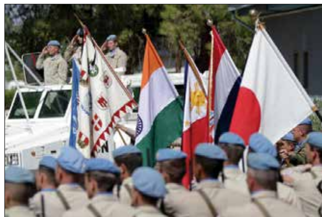
Austrian Contingent leaves UNDOF after 39 years