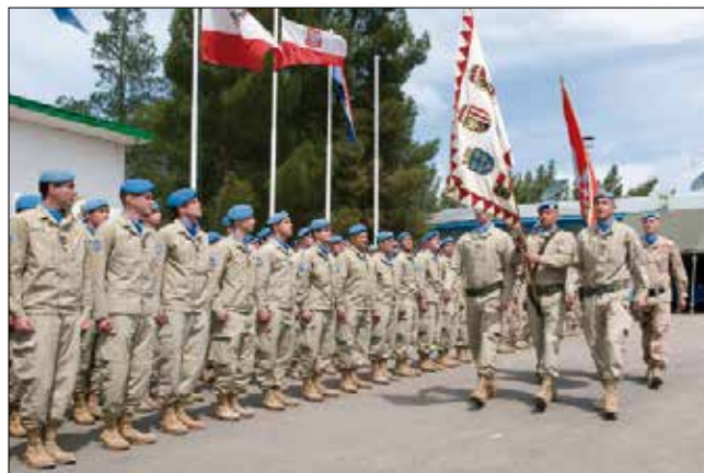
AUSBATT parade in Camp Faouar in 2009

"We wish our successors and UNDOF comrades all the best for the future!"