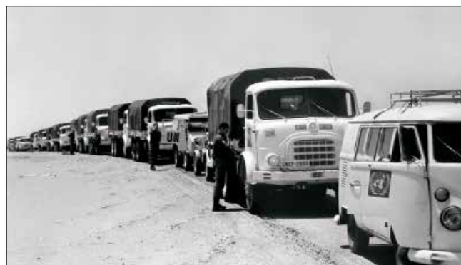
The first convoy coming from Sinai

In June 1974 contingents from Austria, Peru, Poland