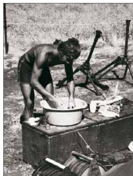
A peacekeeper's daily life