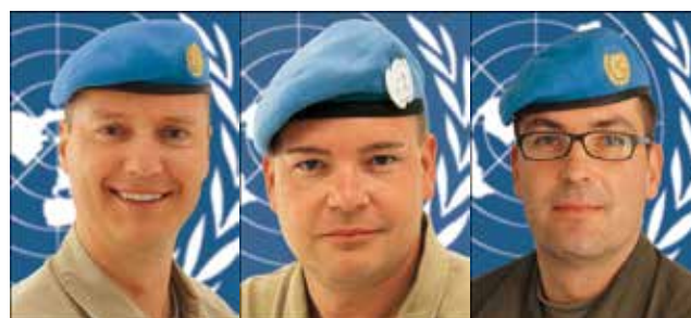
The Editorial Staff of Golan Journal 135

I have to stress that spending almost seven years in the Middle East was a valuable and important part of my life. I wish to thank everyone who have made it a memorable one.