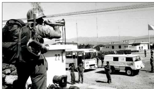
AUSBATT Rotation in 1982

and Canada were deployed from UNEF II in Sinai to Syria. After the Austrian UN Secretary-General Dr. Kurt Waldheim (1971 – 1981) has asked the Austrian representative to the UN for a transfer of