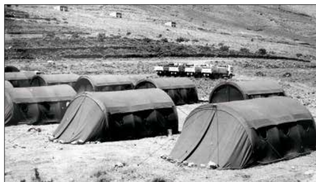
Posn 10 in its early days A.D. 1974