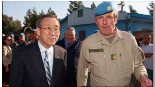
Secretary General Ban Ki-Moon visited UNDOF in 2007

Embassy and the Military Attaché in Damascus, Christmas charities were organized and the donations supported the Red Crescent caring about handicapped children in Qunaitra Governorate.