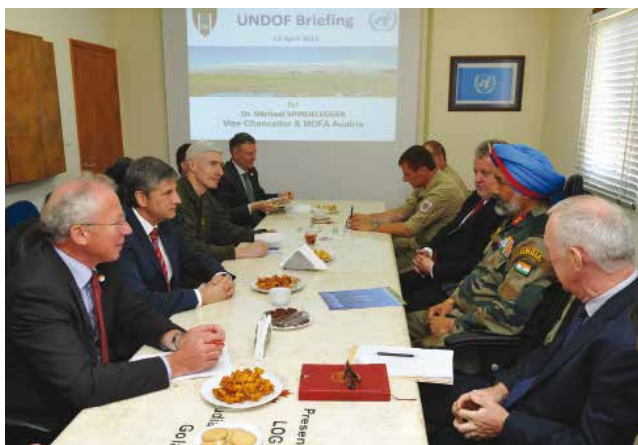
Mr. Michael Spindelegger, Austrian Vice-Chancellor and Foreign Minister with party visited UNDOF and met with FC UNDOF (12th Apr 2013)