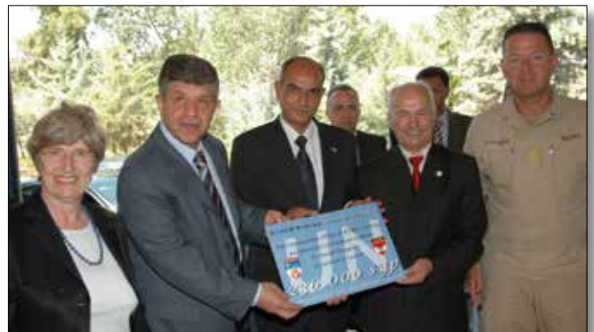
Handing-over a donation to the Red Crescent in 2008