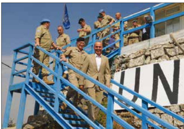
Mr. Gerald KLUG, Austrian Minister of Defense and Sports, visited OP 51 and Position 22 of UNDOF (9th May 2013)