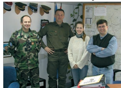
CO SLOVCON, COS, Slovak Journalists

To draw a conclusion to my contribution to the Golan Journal I would like to mention that correctitude and openness