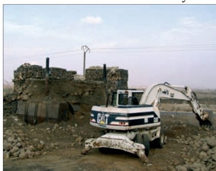
Shelter destruction (Posn 67)

October. Both positions were abandoned already. On 16B, just the walls were remaining. No other facilities except a shelter were available. For engineers the policy applies that no military assets may remain before the compound can be handed over to Syrian