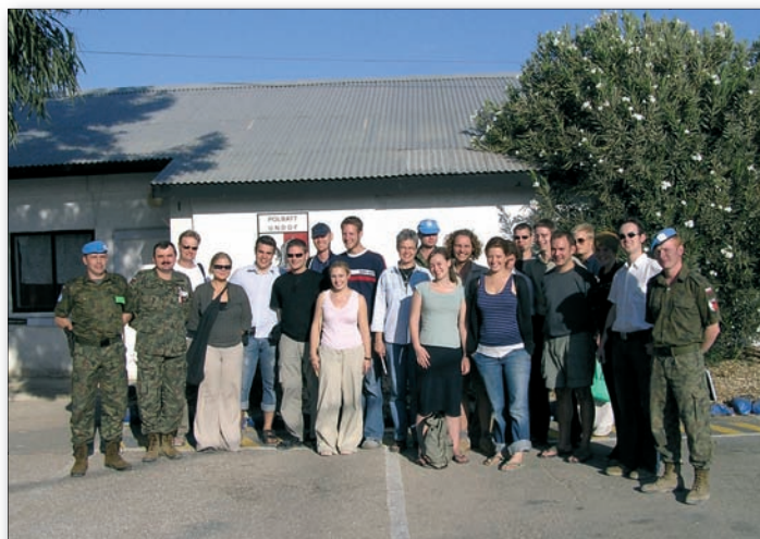
Young Danes studying politics visit POLBATT Posn 60 (7 th October)