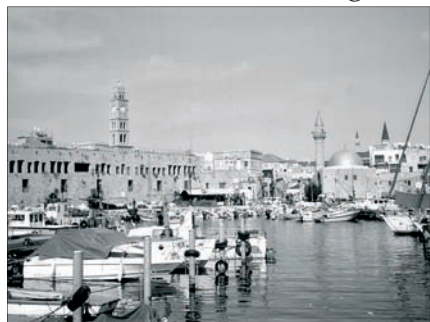
The harbour of Akko

nel of the Crusader period has been recently discovered.