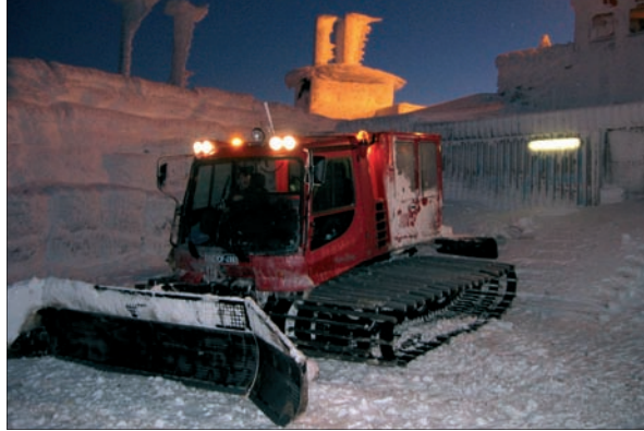
The 1st Coy is allways prepared for a hard winter

no matter how insignificant it may seem, can turn into an enormous problem in the winter when all supply lines are cut off for months. For the