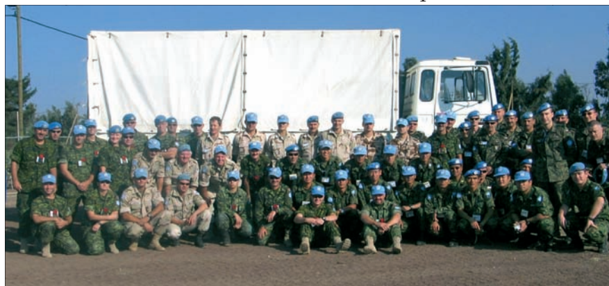
All competitors from four contingents

The aim of the UNDOF Vehicle Rodeo Competition is to encourage all contingents to develop and perfect their driving techniques and abilities, but also to provide an arena in which to demonstrate these skills during a challenging competition. Such a competition provides the opportunity, not only to gain team recognition, but also that sense of personal achievement, which comes when professionals compete with the best of their peers. It was also an excellent way to promote esprit de corps and safety awareness within the UNDOF Mission area.