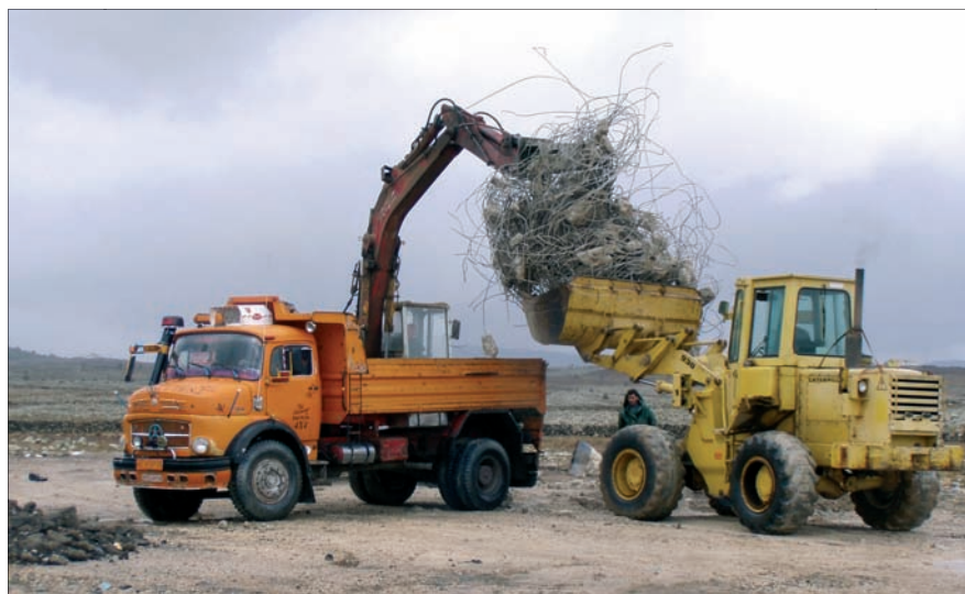
Final cleanup at Posn 67

W ithout any doubt the main task issued to UNDOF engineers at present is the implementation of the Force Modernization Program (FMP). It consists of 2 camps and 17 positions to be upgraded entirely. A big portion of modernizing deals with communication.