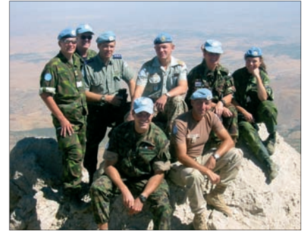
Break on Mt. Hermon

by the Austrians is really outstanding! This line tour is important not only because it is a nice place to visit, but also it provides an overview of the whole AOR/AOL where the UNMOs do their inspections and patrols, the Blue Line and