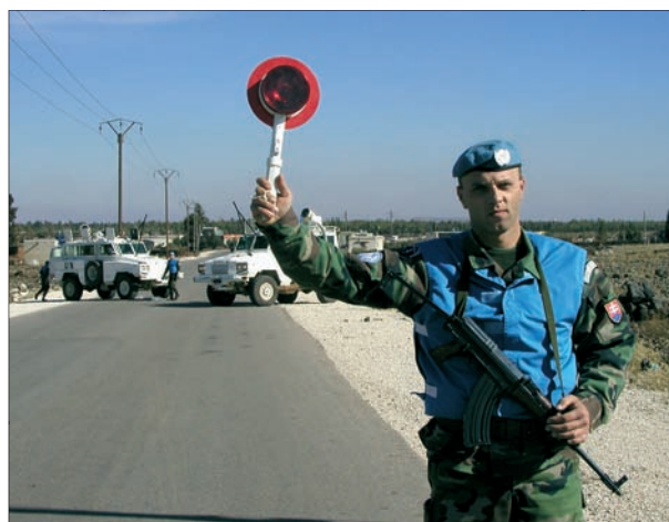
Slovak soldier on duty

ily of all nations united under the UN after our mandate had expired in the former Yugoslavia. I must admit that during the week on the Golan I remembered several times this jovial, sociable and highly