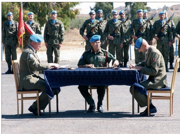
The ceremony took place at Camp Ziouani