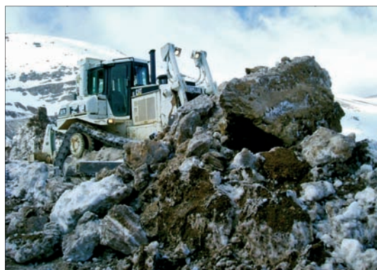
Snow removal at Mount Hermon

Do you know the J-CON Detachment section?