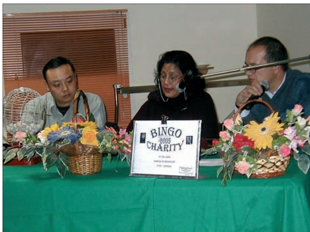
all concentration on the game