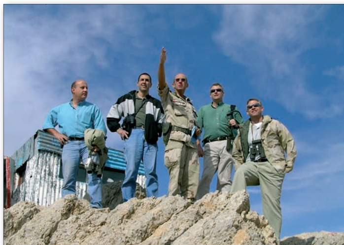
Delegation from US-Embassy in Syria on Mount Hermon (12 th October)