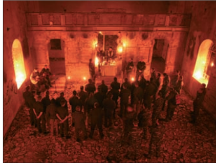
Holy Mass in the church of Quneitra

by the flickering torches in the windows with no more panes, accompanied by the howling of the dogs straying through the ruins of old Quneitra.