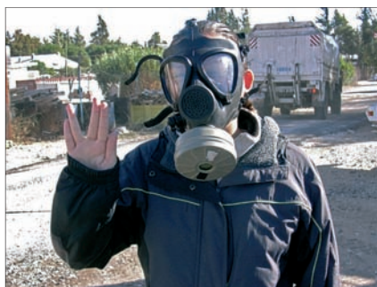
Training is the key to preparedness!

Participants were divided into three teams – each with an appointed team leader who simply had to insure that his/her group knew exactly where