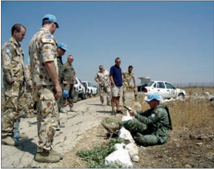
"Training? I'm lovin' it"!

Since last May, OGG with the outstations Damascus and Tiberias has been carrying out 33 training events (an average rate of 4.7 events/month).