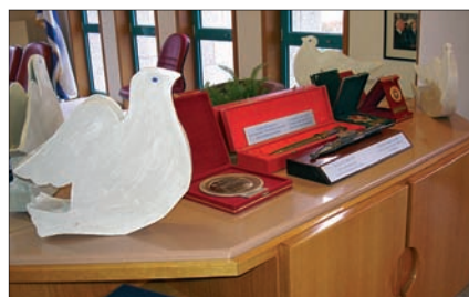
Doves of peace in Beit Gabriel

Two rows of windows reveal the Sea of Galilee, beginning some meters outside, beyond some palm trees in the garden with colorful flowers. The beautiful view goes from the quietly hidden Tiberias at