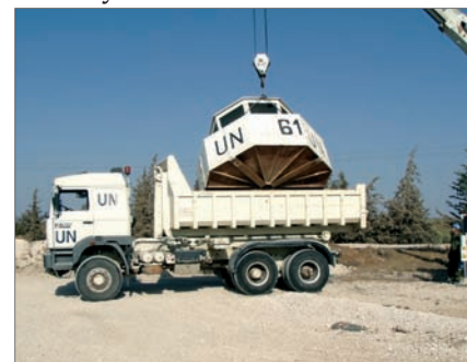
Removal of the watch tower

After the last structure was torn down a final major clean up completed this enterprising engineering task on 29 th Nov 04 according to the schedule. At this stage, FCEO would like to highlight the bad weather conditions of rainy and stormy weather under which