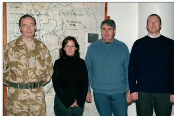
Group from British embassy in Damascus getting information in UNDOF HQ (26 th November)