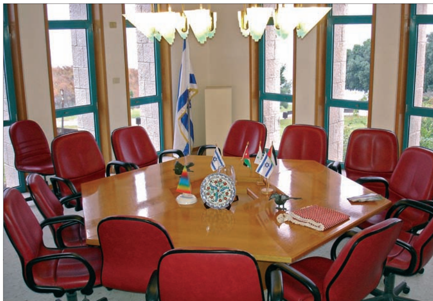
The room of the peace negotiations next to the Sea of Galilee

The Urimare-room (every room of the house has a name of a hero of Venezuela, the home country of Gita Sherover) in one corner of the building was the place of the peace negotiations. The carpeted-floor is grey, the table in the middle has six sides, each of the twelve red leather-chairs around the table is equally sized, no special place for a chairman is provided.