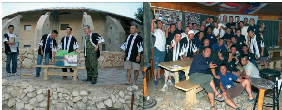
Most of the new members won a prize

+ on the last day of your UNDOF mission – drinks are free!