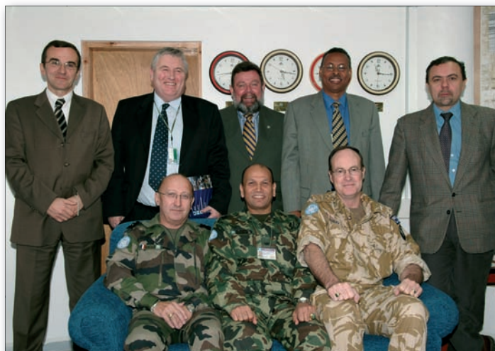
Meeting of FC UNIFIL, FC UNDOF, COS UNTSO and Civilian Staff (6 th December)