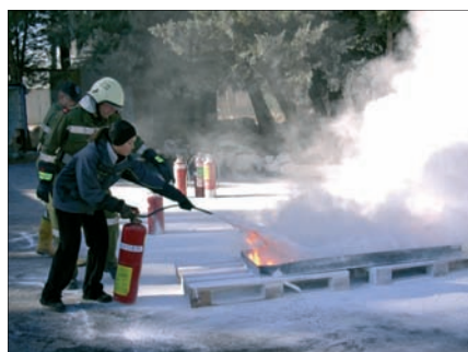
Live enactments of fire extermination

Initiated by the UNDOF Mission Training Cell (MTC) and coordinated jointly with the Personnel and Travel Section, the Command Post Exercise for civilians was designed with a view to equipping staff with necessary survival skills while being trained to save other lives as well. It aimed to bring trainers and trainees