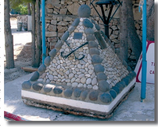
Successful move to Camp Faouar

The decision to move the cairn stems from Canada's decision, after 31 years, to reduce its troop