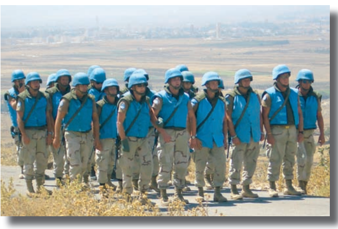
AUSBATT is lining up...

teams, a shelter alert, mounting of temporary check points, evacuation of a Position due to NBC-threat with subsequent decontamination and first aid and rescue after a car accident. Each day, once the exercise was suspended, concluded with an after action review called "Hot Wash Up", in order to collect the still "fresh" observations. The after action review following the third day revealed an impressive performance of all