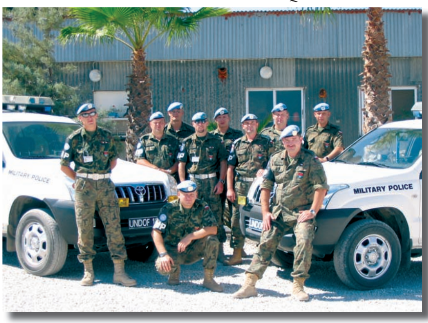
Polish soldiers of the Military Police Platoon

The rotation of Polish MPs is twice a year; March and September, so new Polish MPs will come soon to UNDOF to get new experience in peace keeping missions. MPs, who are preparing to fly home, are very glad of serving in UNDOF best they are alsevery happy to return again home.