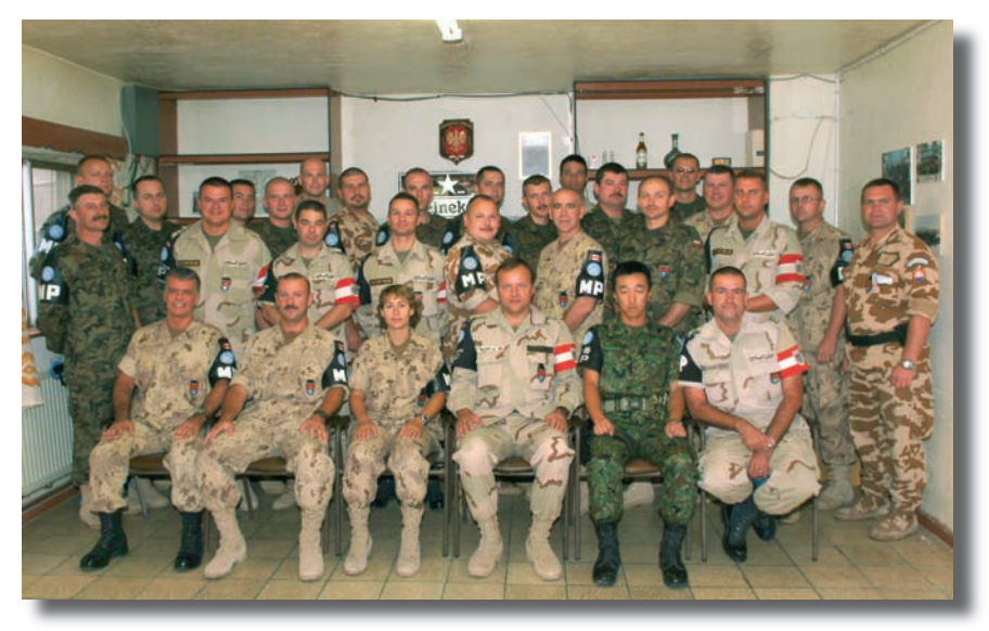
The Military Police Platoon

The first Polish Military Policemen came to the Golan Heights in the year 1978, as patrolmen of the MP post in Damascus and were followed by the first Polish FPM in 1995.