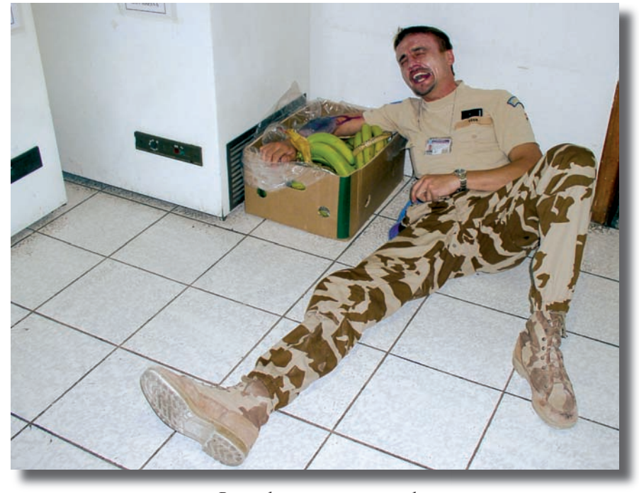
Bitten by a poisonous snake

AUSBATT companies. Even more importantly, there was no real accident during the entire exercise. Exercising is not about exercising as such. It means setting and solving tasks, gaining positive as well as negative experiences and learning from them. The main lessons learnt during this "GOPHER HOLE" were: The alert levels and their corresponding actions have become very used to the companies.