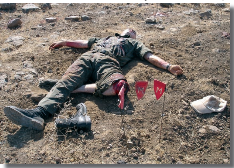
Be aware of mines!

house at posn 37 caught fire. After futile attempts by posn 37 to extinguish the fire, in combination with the fire brigade of posn 27 and CF, they finally were able to keep the fire under control and to extinguish it.