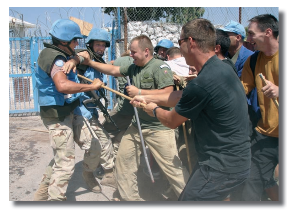
There is no way in for demonstrators

Normally, after such a highlight, an exercise should come to an end, but in this exercise,