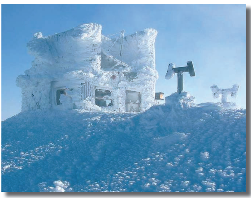
AUSBATT 1 Coy - Hermon Hotel during wintertime