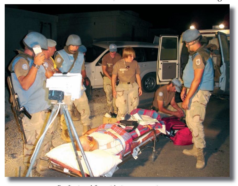
Professional first aid given to exercise actors

The company had done a very good job at all, so it wasn't necessary to overstress the soldiers with preparing their clothes for a possible evacuation. The exercise of the 2nd Coy came to an end at the peak of the possible incidents and there wasn't more to say than "congratulation to the performance of all participants within the 2<sup>nd</sup> Coy"- operational readiness is a fact!