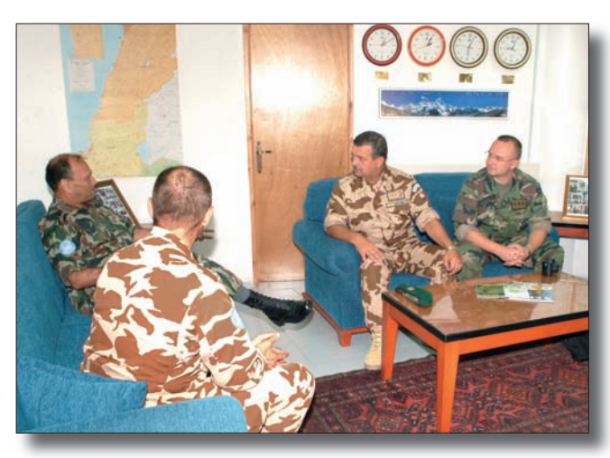
Visit of LtGen Millan Maxim, Slovakia, meeting with FC, fact finding of SLOV-CON's activities (25th August)