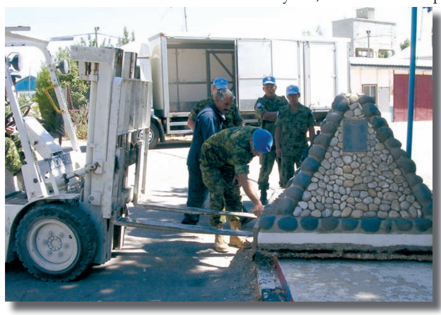
Delicate manoever during disassembly in Camp Ziouani

The vast majority of Canadians are currently situated in Camp Ziouani, where none will remain following Canada's draw down. A Canadian contribution consisting of approximately 40 personnel will continue to provide essential communications, movement control and MP services to UNDOF in Camp Faouar. Further, Canada will continue to fill certain UNDOF HQ staff positions. The presence of the cairn in Camp Faouar will be a perpetual reminder not only of our fallen Canadian peacekeepers, but also of the dangers that our soldiers endure in the service of peace.