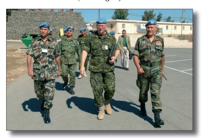
Visit of LtGen R.K. Mehta, DPKO, fact finding of UNDOF activities (28-30th August)