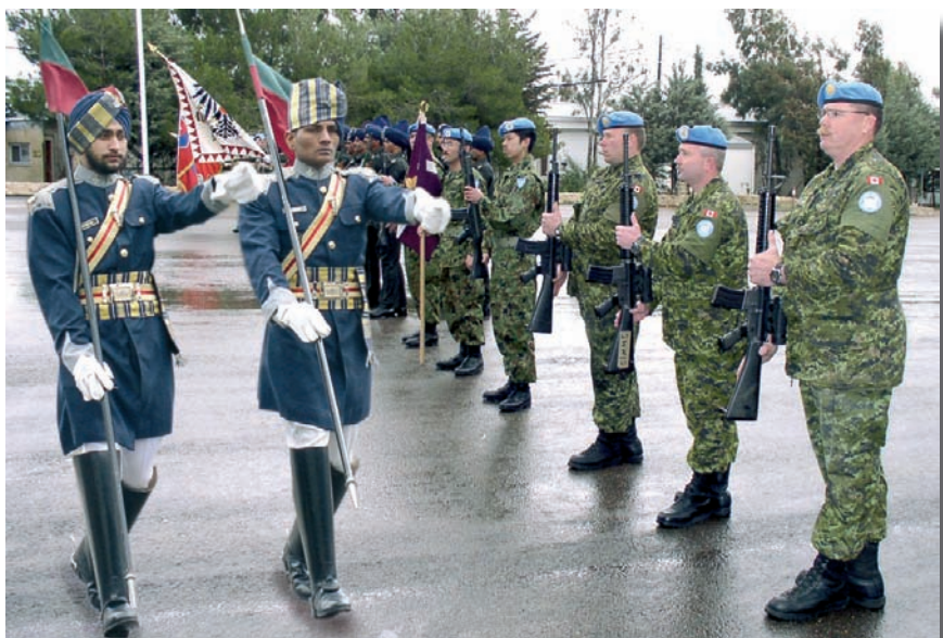
Indian guard, dressed in the regimental dress of the Poona Horse