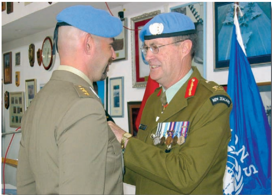
22 medal recipients on parade from UNTSO HQ, ODD, OGG-D, OGG-T and OGE

COS UNTSO presided over the combined ceremony and guests included Senior Staff from UNTSO HQ and UNDOF HQ, representatives from AUS-BATT and POLBATT UNDOF,