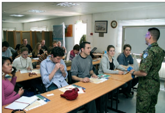
Visit of Students from London school of Economics, visited CZ and Posn22. (31st Mar)