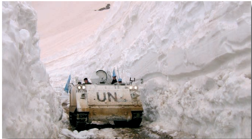
APC M113 passing a canyon of snow

Decision: "At 0100LT the next attempt will start." The Leave soldiers are disappointed in the bad situation and the information given by the Company Commander. They have been ready for the transport to Position 12. But now, it is not possible and the road is closed. Some soldiers start discussing