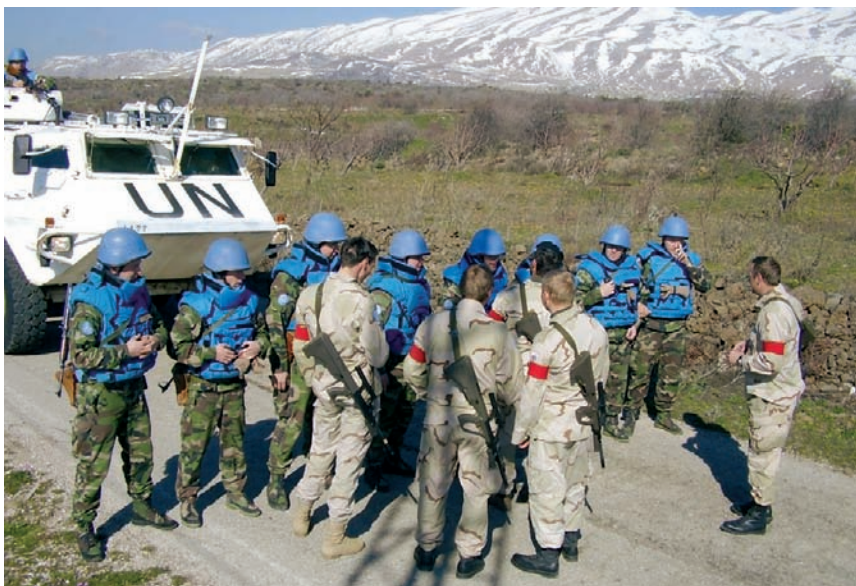
Slovakia soldiers training during the Gopher Hole 2006

The last part of training for UNDOF is in Austria in the