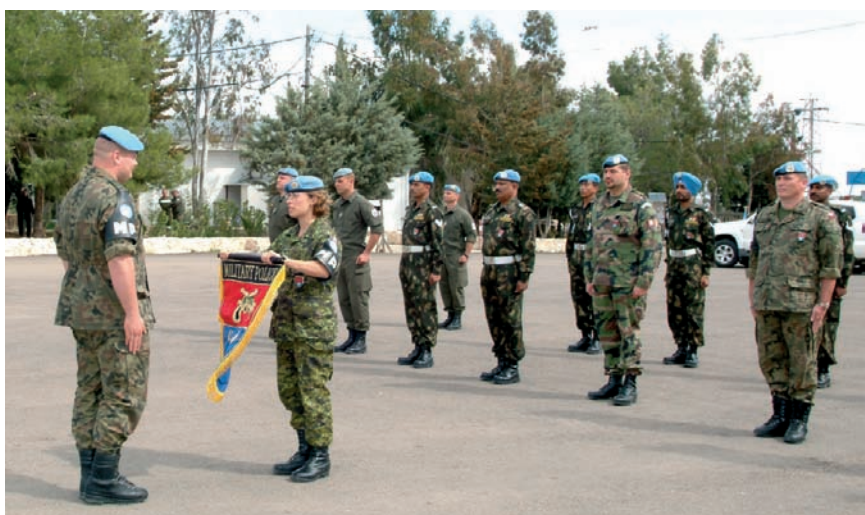
Handover of the MP insignia

A farewell party was organised by the MPs for the Canadians at the Austrian NCO's Mess, which has seen many MP