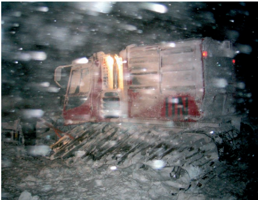
Windspeed more than 180 km/h and snow-drifts.

1900LT, 13 hours until departure. Orientation during winter is only possible with the help of 4 to 7 meter long snowpoles. In summer the poles are placed on the left and right edges of the road. On the way down to Position 12 the Pistenbully shoves forward the heavy snow then drives backwards and forwards approximately 30 times within 200 meters. On short intervals the window of the Pistenbully must be opened for the driver to get his bearings. It is very difficult to orientate. Despite GPS it is dangerous and sometimes you can lose the sometimes invisible and narrow way. The curve „am Felsenkopf“ is passed. Via radio communication the waiting soldiers get the latest information about the situation. The masses of snow on the steep slope are very dangerous. The Company Commander scans the danger of avalanches. Decision of EDELWEISS 50: