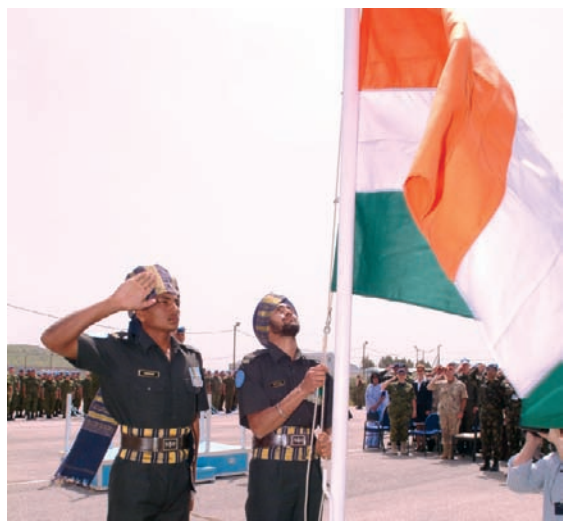
Hoisting the Indian flag