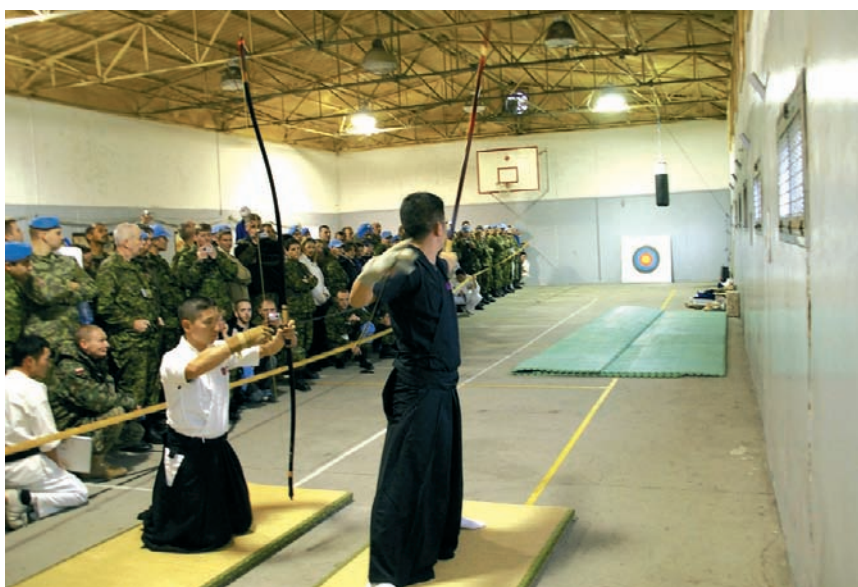
Demonstration of japanese archery Kyudo in Camp Ziouani

Ten years ago, on the 1 st of February 1996, the first Japanese Contingent was deployed to UNDOF on the Golan Heights. The 43 members of the first J-CON took over the Transportation Platoon of LOGBATT and the additional two were deployed to UNDOF HQ. Over the past ten years, a total of 880 Japanese Peacekeepers have served this mission. The total transport distance by the Japanese Contingent in 10 years is about 2.62 million kms (It is almost the same as 65 times around of the earth). And the gross weight of transportation was about 23 thousand tons.