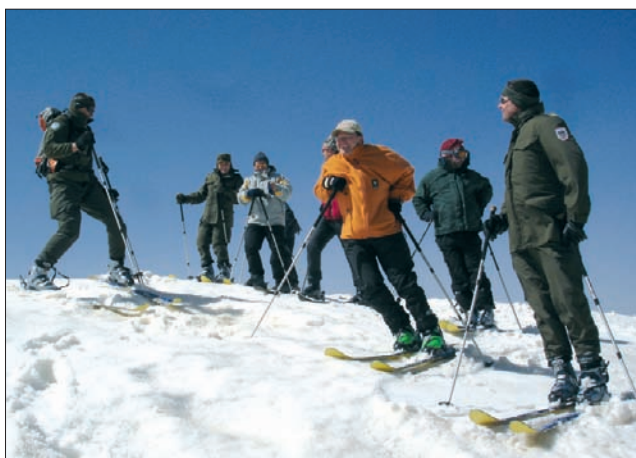
Visit of Defense Attaché from EU to 1 Coy of AUSBATT, enjoyed skiing at Mt. Hermon. (14th Mar)