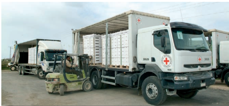
ICRC trucks to be loaded

Last year when the Israeli Ministry of Agriculture and Countryside Development approved a request from Druze Sheikhs and Farmers from the Golan for exporting their apples to Syria the process was started for the first time. With the successful activation of the International Committee of the