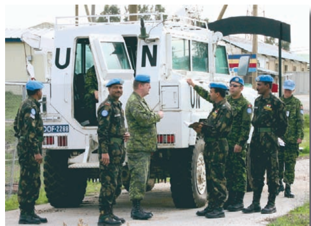
Train the trainer