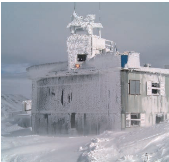
Hermon Base being snowed in

0700LT, all soldiers reach the Position. Leave is important. With common strength of the 1st Coy it has been arranged that all LEAVE-soldiers are in time at Damascus airport.