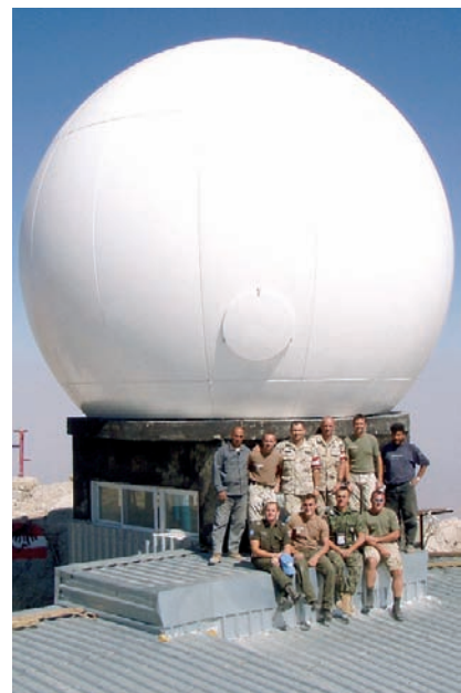
The 'Radome Shape' at Hermon Hotel, 2814m Mission accomplished for Engineers