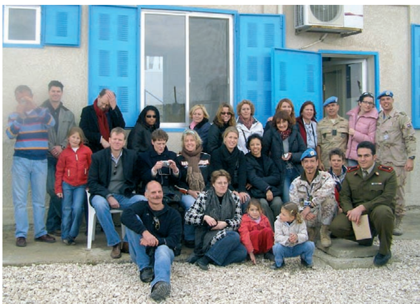
The Families of the Military Observers

We visited OP 58 first. Everything was a new experience for