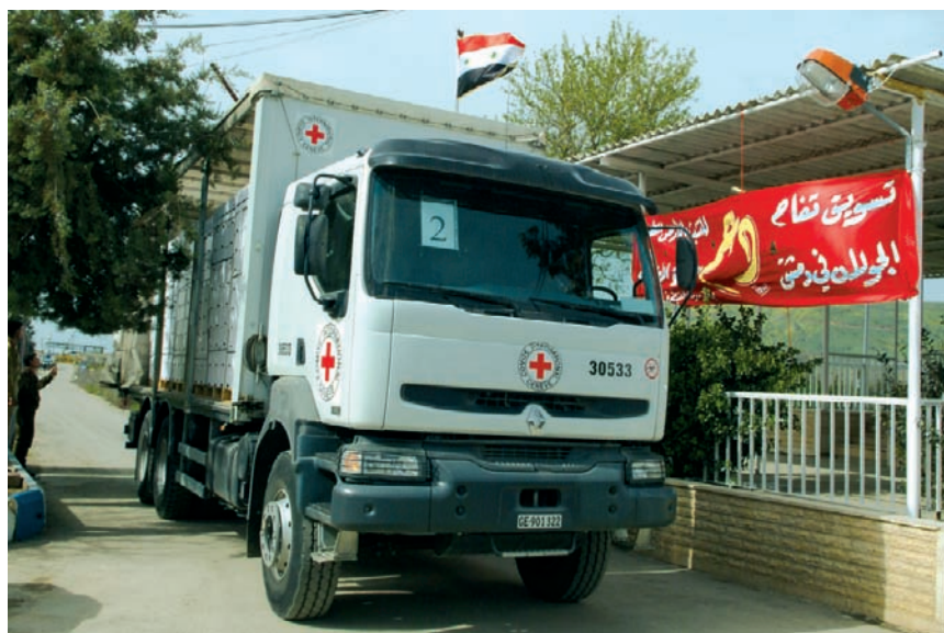
Crossing the B-Gate

On 19 th March 2006 the Operation APPLE started for the second time and obviously is well on the way to become an annual event. It is expected that some 5000 tons of apples will pass through the A/B Gates with the operation lasting approximately 50 days.