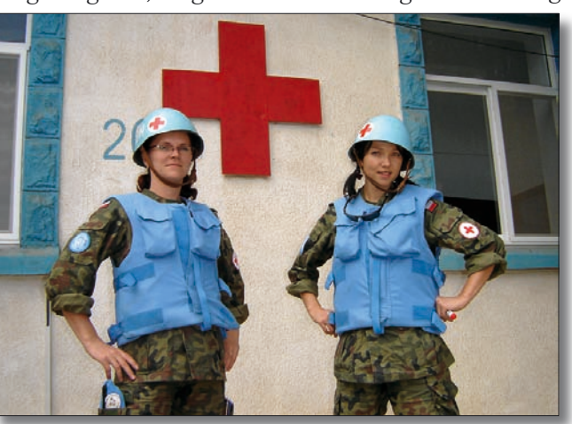
New rotation of Polish nurses is finished

notice an increase of their presence in other services: General Military, Telecommunication, Intelligence, Legal Service and Logistic.