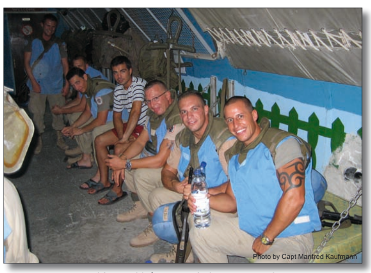
Soldiers of 2<sup>nd</sup> Coy in shelter on Posn 27

climbed down from his sentry-box, closed the door of the Position and went to the entrance of the shelter. His task was to count the detonations and to secure the entrance. Now waiting - a lot of questions appeared. Who was shooting? Is Posn 27 the target? How long will it take? The most important question: Can the shelter resist an impact of a