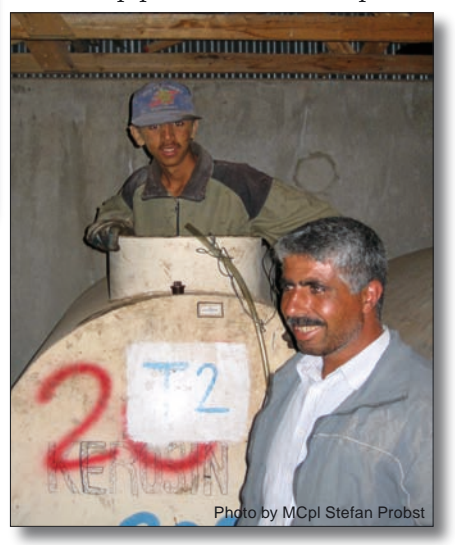
Syrian worker is climbing into the tank. Inside, he is cleaning the wall with a broomstick and a wire brush to remove the slag

1st Coy and needed approximately four weeks. In winter-time, the weather conditions are sometimes very bad. Visibility can be less than five meters and snow can be more than ten meters high. In the area of this Company there are fifteen kilometers of patrol tracks. 1814 snow poles had to be set. A backhoe dug the holes. The next step was to set concrete pipes. A third team placed