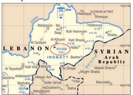
Map No. 4144 Rev. 16E, UNITED NATIONS

Even though we had some tough weeks with travel restrictions and shelter alerts (see article on page 9), UNDOF was lucky, as no one was killed or even injured. UNIFIL lost two civilian members in one of the Israeli air bombardments of the area of Hosh in Tyre<sup>2</sup>. UNTSO, however, with their dispatched Observer Group Lebanon (OGL) was even