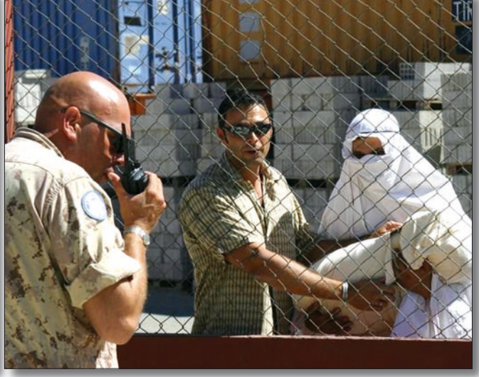
UNDOF's Special Task Service facing an 'angry mob'.