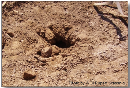
Impact of a Katyusha-rocket in Qunaitra

be there was present. The CoyCdr ordered the patrols in the Area of Separation (AOS) immediately to go to the next UN-Position (Posn 25 or Posn 32). At these positions were only shelter-readiness, due to the distance to A-Line. The sentry