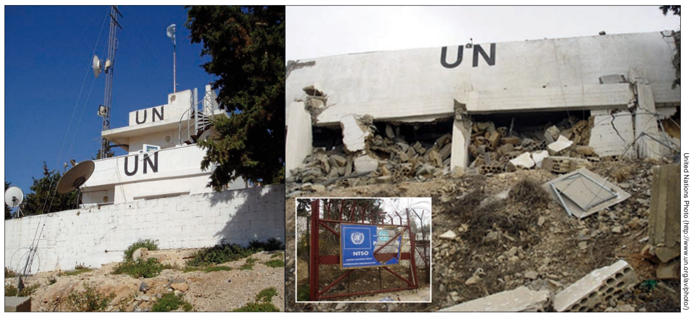
OP Khiyam befor the attack...

<sup>1</sup>