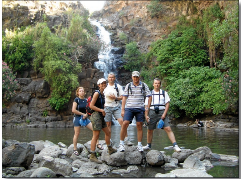
Water fall in Nature Reserve Yehudiya

enced in both duty and leisure. This "traveller" is able to organize a one day trip in a minute. His geographical as well as historical knowledge about the mission area and the Mid-