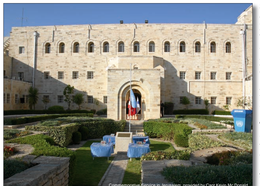
UNTSO HQ-Jerusalem, 'Government House' on 30th Jul 2006

kidnapped soldiers - ended. From that day on, IDF (Israeli Defense Force) blocked the Lebanese seatraffic and air-struck targets all over