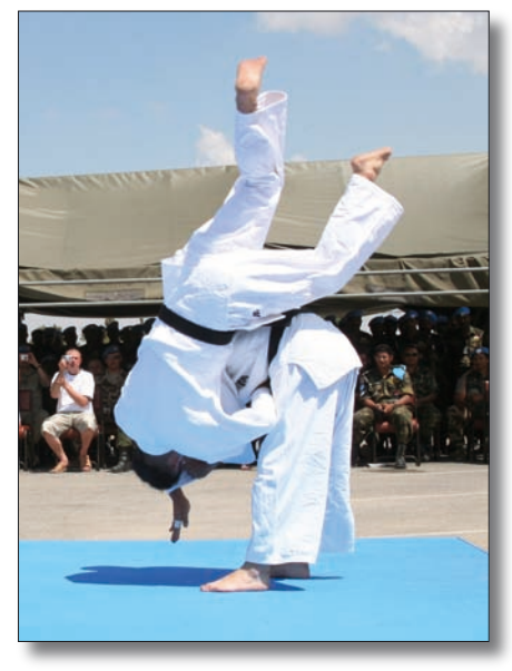
'Seoi-Nage' one technique in Judo

On 7th of July, known as 'The Day of Star' Festival in Japan, we conducted the 'J-CON Day' in Camp Ziouani.