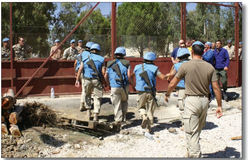
UNDOF's Special Task Service in action.

at the gate of the 'OP', requesting help for their sick child. In the final scenario the UNMO had to deal with an angry mob armed with