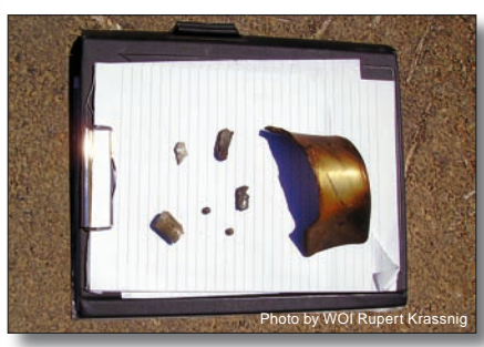
Pieces of a Katyusha-rocket

Katyusha-rocket? Are we safe? The CoyCdr was buried with operational matters. The Deputy entered the shelter to talk with the soldiers. In the last week he got gummy bears from Austria and distributed them to his comrades. Everybody was in a good mood. After three hours, an announcement via loudspeaker: "Shelter-Alert lifted."