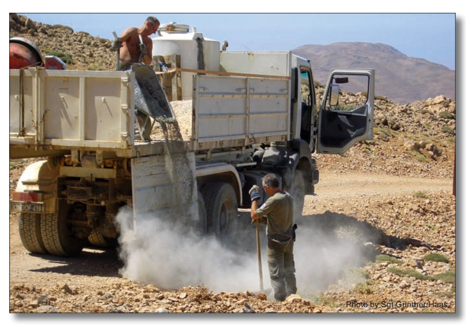
Concreting the foundation

With the last snow melted and 35°C in the shade, now it's time to start with winter-preparation at Mount Hermon. All measures have to be finished by the end of October, to be ready if winter starts surprisingly.