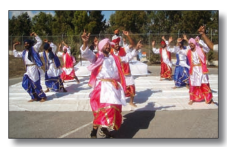
Celebrations with Bhangra

n India Diwali is celebrated with Lthe lighting of traditional lamps and candles, people clean and decorate their homes, wear new clothes and hold joint family prayers in the evening. This is followed by bursting of fire crackers, partaking of sweets and feasting by the whole community. Businesses give bonuses to their employees and in the country side, the farmers save throughout the year to purchase new clothes, household articles for their family and homes. Diwali is a closed holiday in India and is in fact the start of a new year as per the Hindu calendar. On an almost perfect, bright and pleasant autumn day on 21st Oct 2006, the Indian contingent celebrated Diwali in Camp Ziouani - the very first time this had been done in the Golan Heights. The