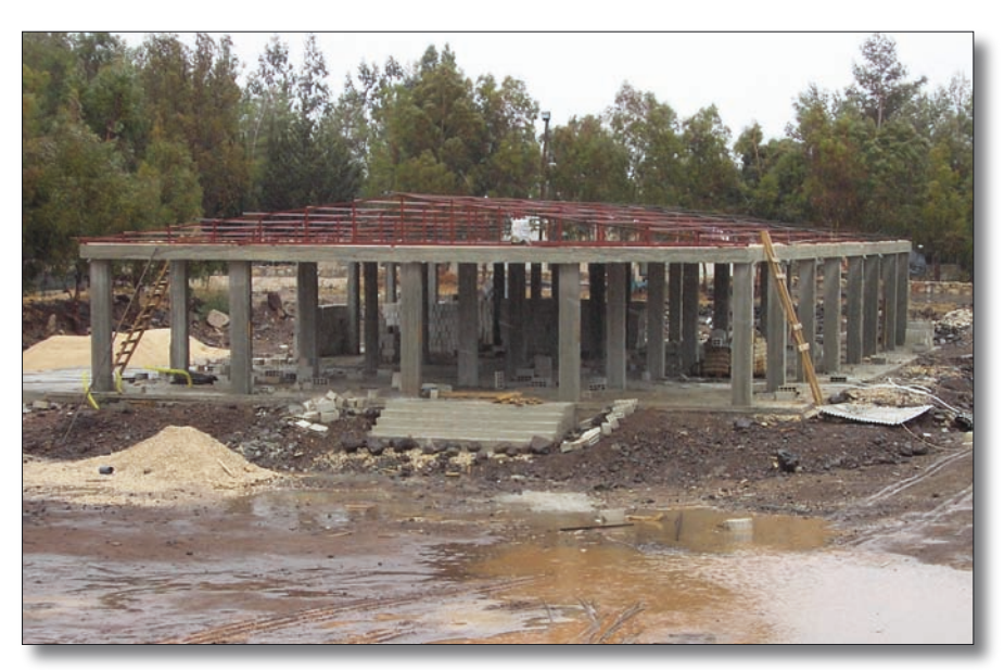
Skeleton structure with ceiling and truss

The introductory article to the Medical Center Story, in Golan Journal 108, described the initiation of the project while the current article will tell you more about the phases of construction.