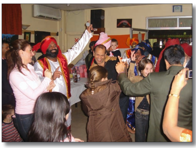
Guests trying a foot on Bhangra

A festive treat of Indian cuisine has been laid out for the guests, which turned out to be perhaps the most popular part of the evening. After feasting on the exciting variety of Indian dishes, the guests partici-