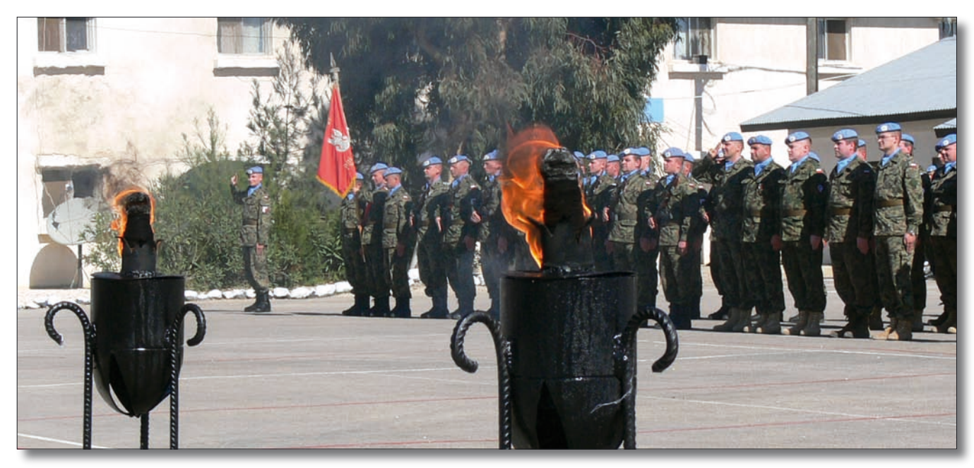
Appeal of Heroes of War for Polish Independence

The Day of Independence is an extraordinary event. For Polish – especially for soldiers, outside borders of their homeland.