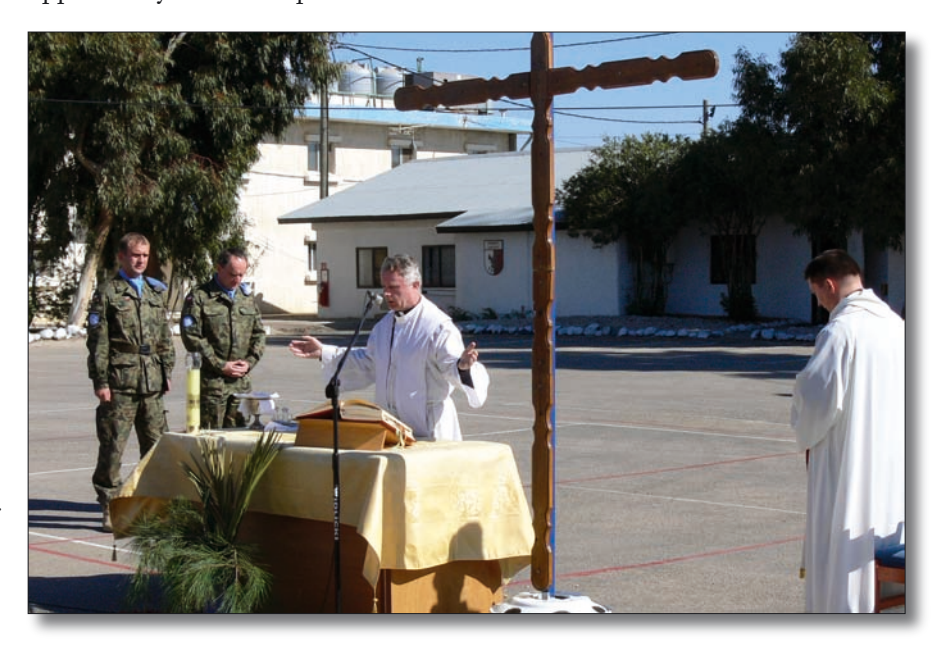
Holy Mass at Camp Ziouani