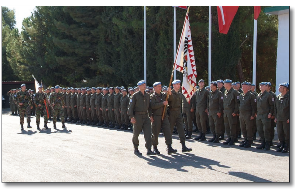
Flagbearers marching alongside mustered soldiers