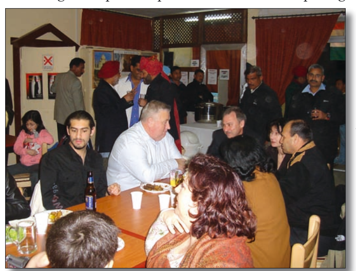
Party in progress

pated in another eagerly anticipated event – the lucky draw of the raffle tickets that they had purchased earlier. After all there were so many interesting & expensive prizes for