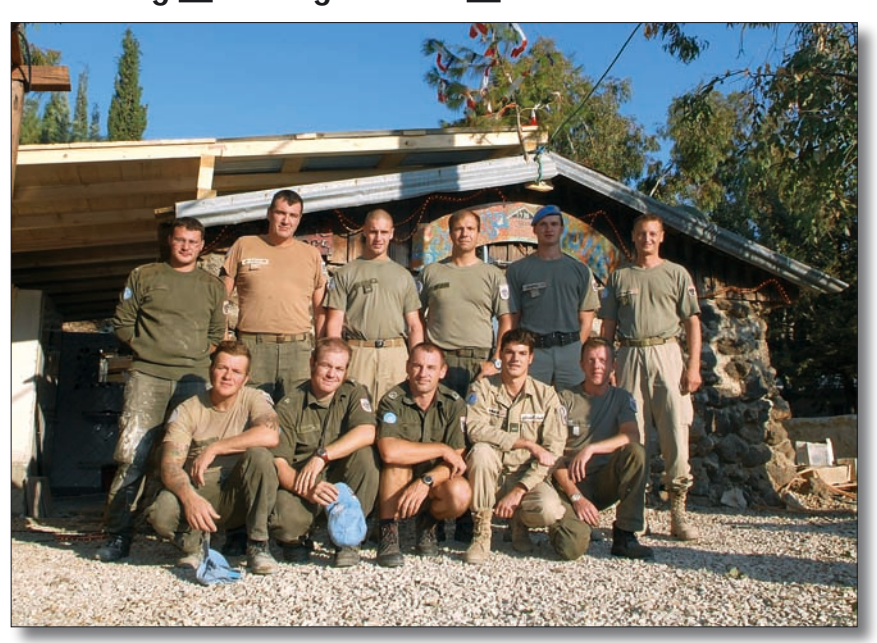
The fine, good-looking and hard-working construction team!

The rareness of the favorite honky-tonk 'Schweija Hut', is not only its unique atmosphere, which is met day in – day out, but also the fact, that it was the first welfare-facility at UNDOF, welcoming all contingents and all ranks.