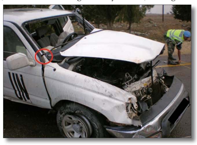
WO III Singh, B-Det Cmdr, marking an accident scene

extremely careful when driving on a wet road! Dirt has been accumulating for many months, and together