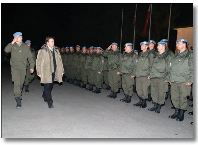
Visit of Mr. Günther Platter, Austria Minister of Defense. The Minister talked with the FC in ROD, visited CF and dined with AUSBATT members at AIK. (15th -17th Nov 2006)