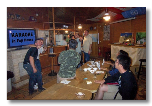
Karaoke-Time in 'Fuji House'

Fuji House is the Japanese bar located near 'Pentagon' in Camp Faouar. This bar was previously owned by the Canadian Contingent and passed on to J-CON. 'Fuji' is the name of a mountain. It's the highest, most famous and beautiful mountain in Japan.