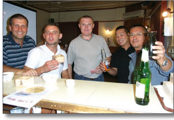
Grand Opening Party of 'A-Line' Mess

We also serve drinks at low prices. For example, you can drink vodka and rum freely at all times.