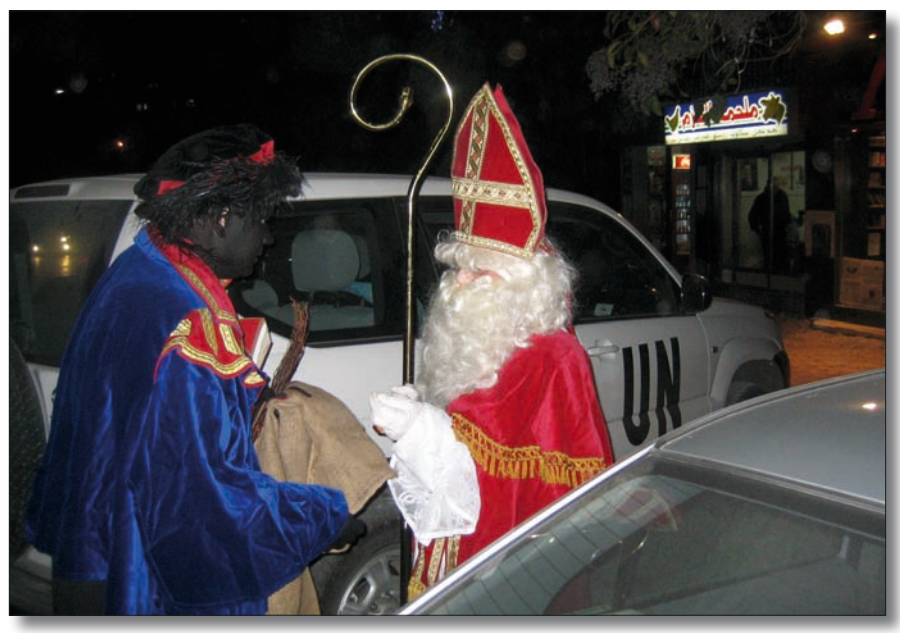
St.Nicolaas and Black Peter discussing 'plan of action'