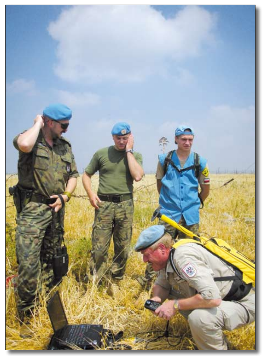
Fieldwork, Saladin South, May 2007

United Nations Disengagement Observer Force (UNDOF) has been working with the same operational maps, Approximate Map Reference (AMR) for the last 32 years. As there have been many changes in the infrastructure, due to development of new roads and villages on the Golan Heights over this