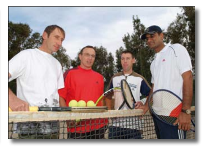
International friendship lived through the spirit of sport

Slovacian contingent (SLOVCON) more visible. The Participants want to show that they have intentions in this sport, the spirit to continue to become more excellent, to grow