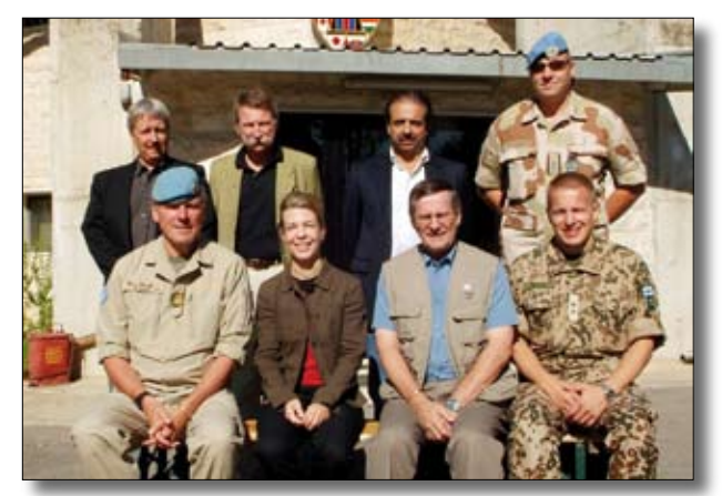
Visit of a mission evaluation team led by General (Retd.) Maurice Baril, evaluating the UNDOF activities (24<sup>th</sup> Sep 2007)