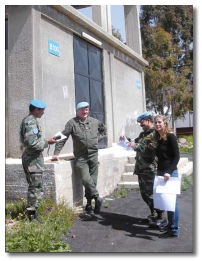
GPS training - Camp Faouar, spring 2007

" S a l a d i n North", tracking of the new road and assigning locations for barrels like Oscar V to VIII in "Saladin South" and assigning locations for barrels to represent the