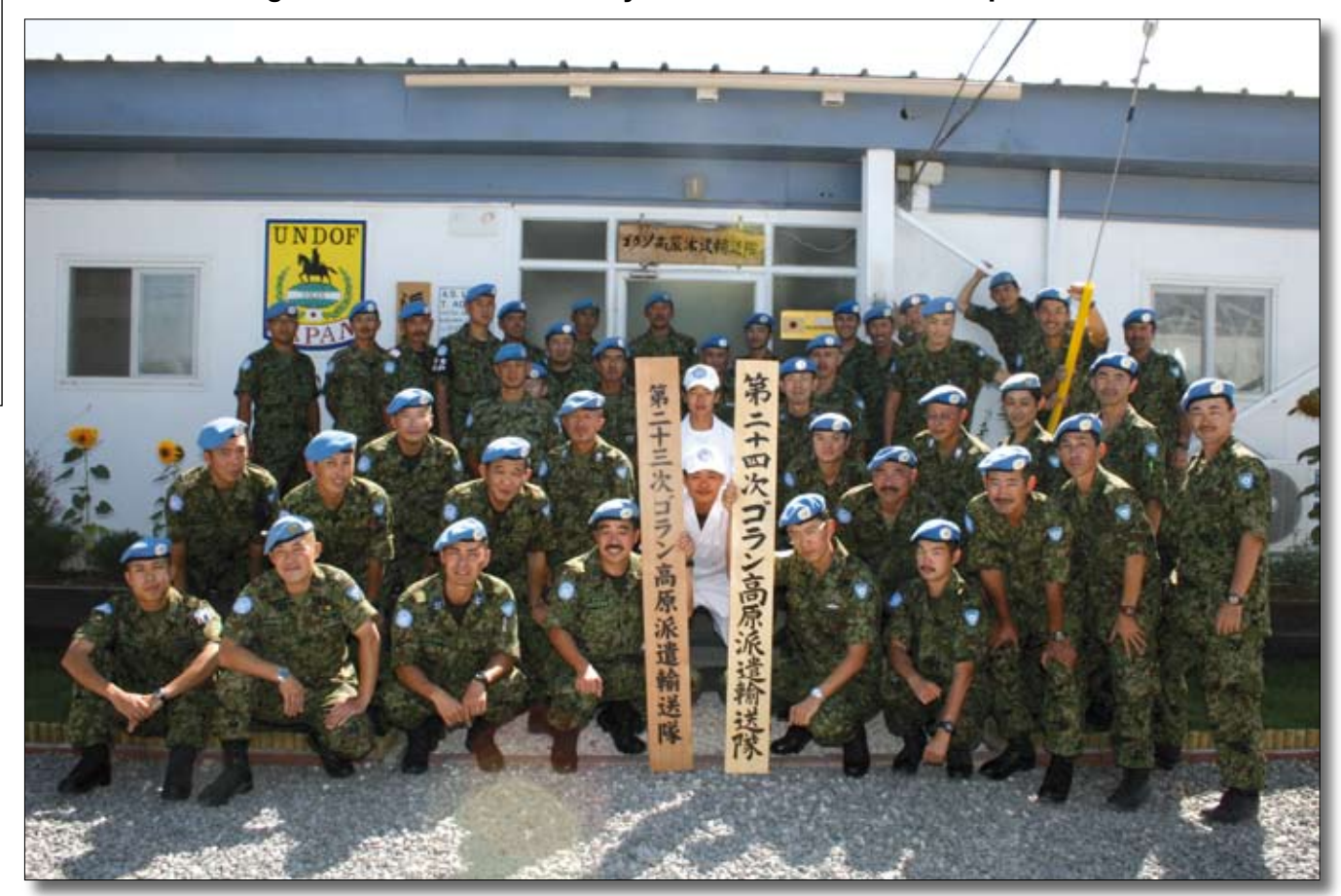
COC of J-CON (5<sup>th</sup> Sep 2007): 24<sup>th</sup> J-CON UNIT PLATE has been handed over at 1400 hrs on 5<sup>th</sup> Sep 2007

The J-CON Change of Command ceremony was held in CZ on 5th Sep 2007.