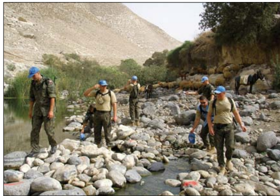
Wadi patrol - a big challenge for tough soldiers

Wadi, Coyote and Scorpion marches are in the Polish AOR. The hardest is the Wadi-Patrol. Only very tough and sporty persons are able to cover it and getting finish of the Wadi march. Among the participants were representatives of the