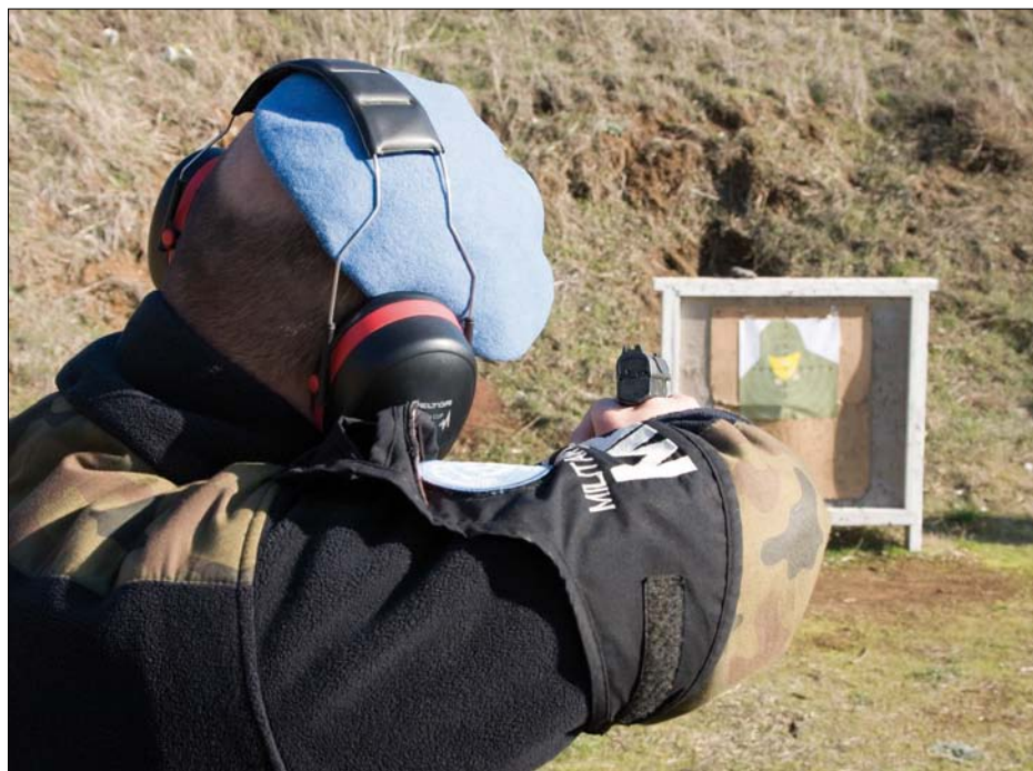
Honing our firing skills at Camp Ziouani shooting range

participation in various exercises kept us on the go.