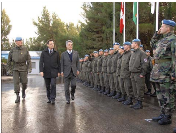
Taking the salute in Camp FAOUAR

On 17 th Dec 2008 at 10:15hrs the day had come. The delegation, headed by black Mercedes Limousines from SSAD (Senior Syrian Arab Delegate), followed by loud MP (military police) sirens and armoured vehicles, arrived at Posn 27 (2 nd Coy Posn). Of course, the President was received with 'Guard of Honor' and DepCoyCdr LtI