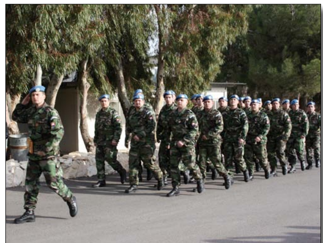
Marching out of the parade