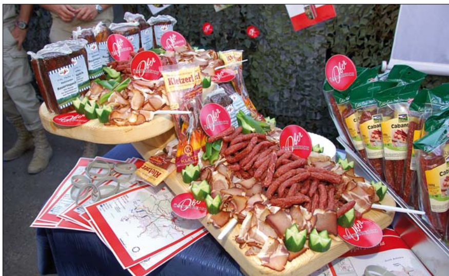
Goodies from Austria

This representative slogan carries the message for the celebration of the Austrian National Day on the 26 th of October, at Camp Faouar in Syria.