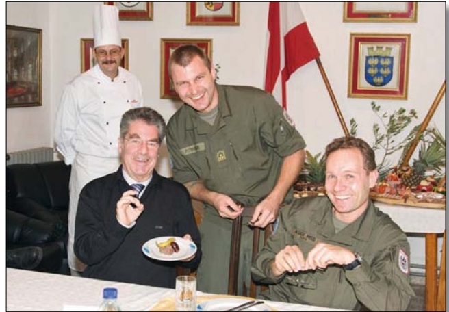
Visit of the President of the Austrian Federal Republic, Dr. Heinz Fischer at UNDOF. He spent some special time with Austrian soldiers at CF and in the AOR of AUSBATT (16 th - 17 th Dec 2007) see page 8