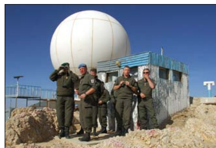
Instruction at Posn Hermon Hotel