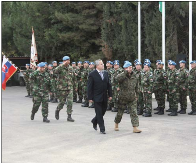
Slovak Ambassador taking the salute