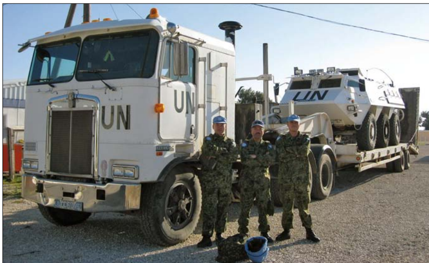
Three Brave soldier transporting a SISU

The aim of this article is to introduce the SISU transportation task to the Patria company in Lebanon, which is one of J-CON mission duties.