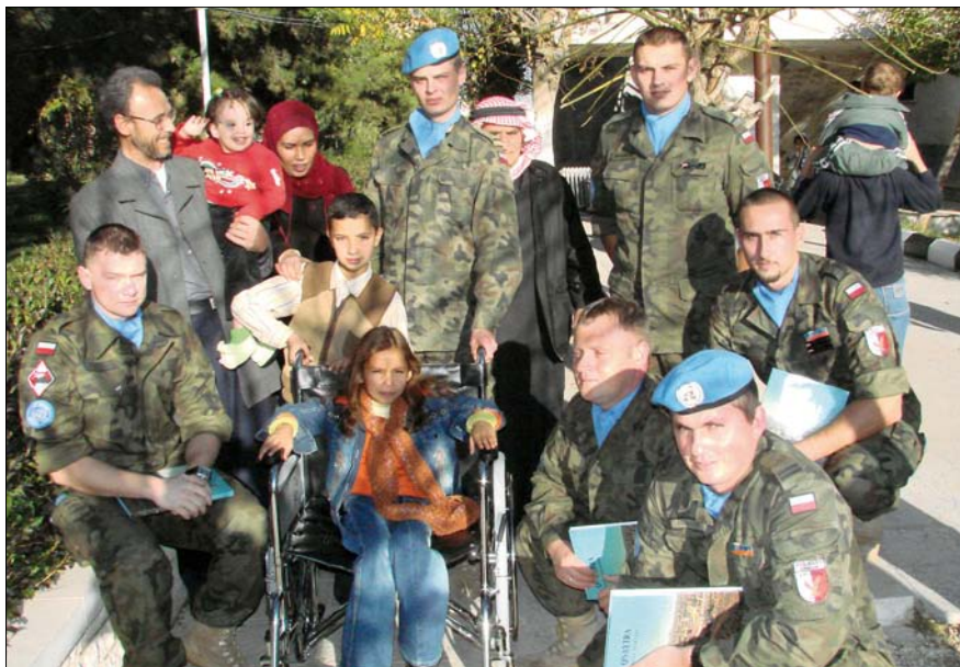
Smiles on the children faces - brought by Polish soldiers