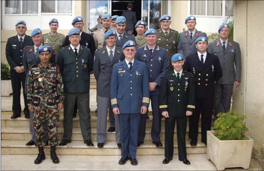
"All UNMOs" who received the medal.