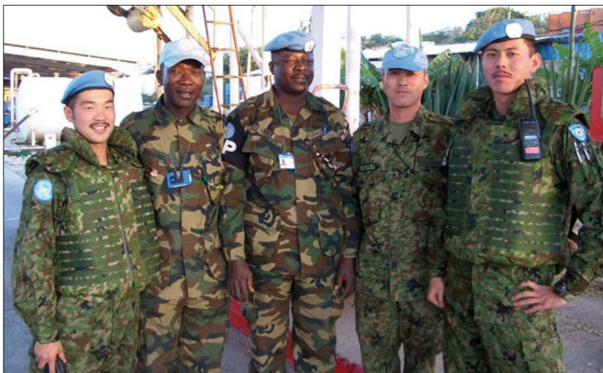
J-CON with UNIFIL members in Naqoura