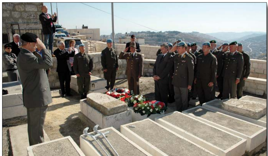
After the ceremony at the 'Mount of Olives'-Cemetery