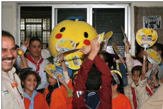
'Habatan' with Palestinian refugee Children

On B-Side we visited the Palestinian refugee camp near Damascus and distributed souvenirs to the children on 7 th Nov 2007. Afterwards,