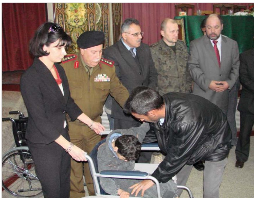
Handing over wheelchairs to the disabled children

Article and Photos by Capt Sylwester Wlaszczyk, PressO/PB