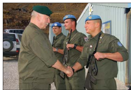
Gen Ertl greets the soldiers at Posn 12