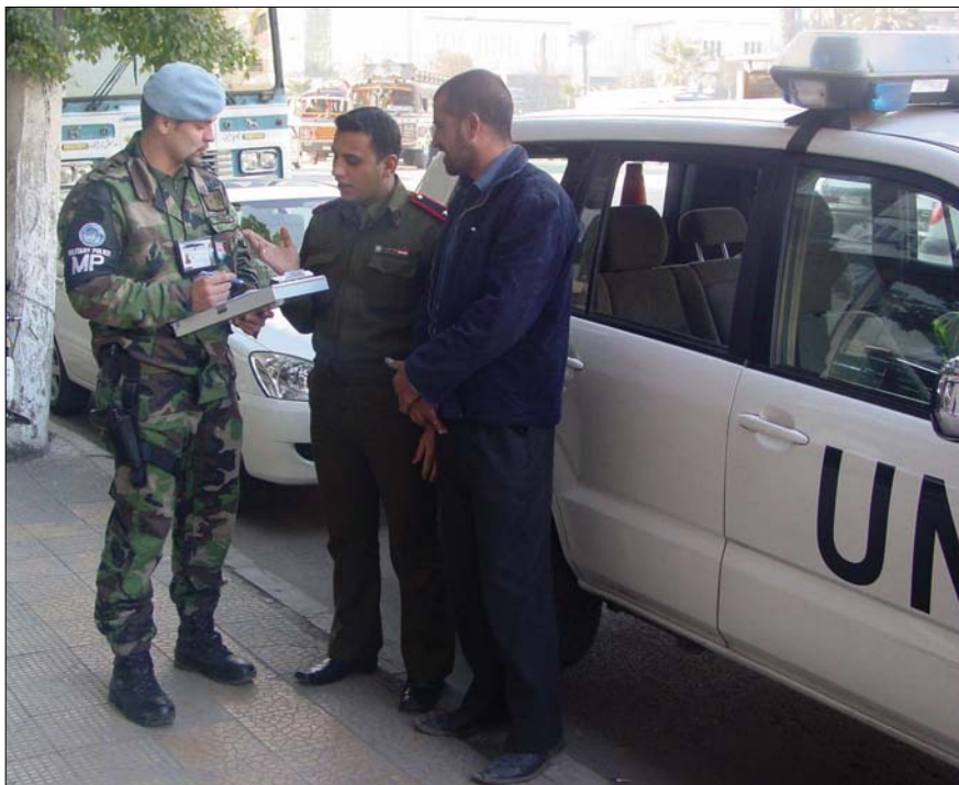
Traffic accident investigation in Damascus

Firing skills of all available MP's were tested on the range in November. Periodic training activities on Military Police Instructions, procedure, reports, investigations and