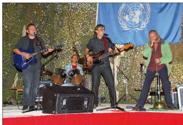
The Austrian Band "Lohnsperch Roffler"

It was a lot of work to organize this celebration, but even a party of this magnitude can never substitute the real Austria. As a conclusion you might use the words of our famous