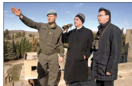
'Hospital Roof Briefing' in Quneitra

Due to the prudence of the Position Leaders we could cope with this task and still observe the AOS