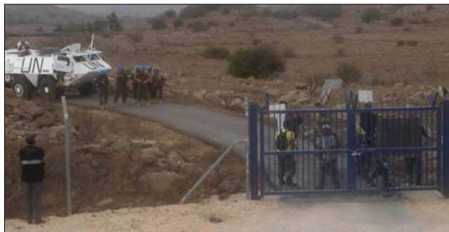
'Exe-Demonstration' near the Observation

The main aim of that training period was to test the reactions of UNMOs (United Nations Military Observers) dealing with the different situations, to test the procedures