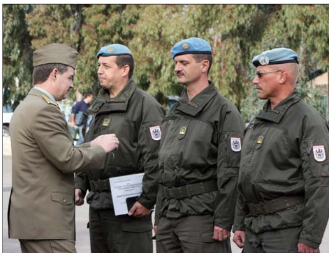
The medal ceremony