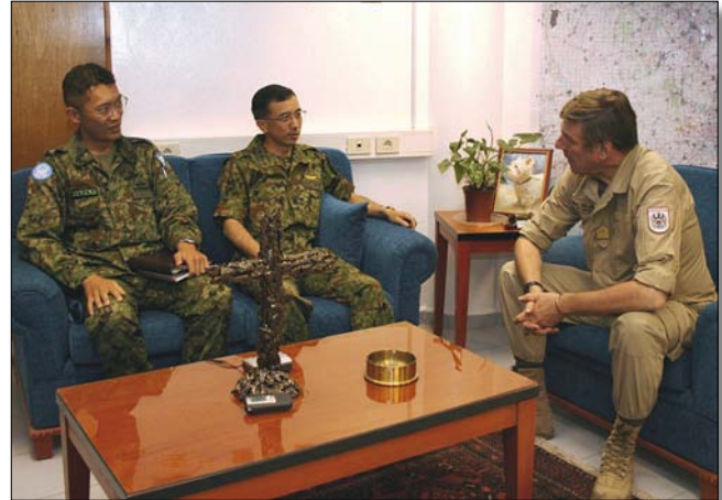
MGen Koichi Isobe, VCG of Central Readiness Force of Japans Ground Self Defense Force. Visited A- and B-side, talked with the FC and recognized the UNDOF & J-CON activities (31 st Oct – 2 nd Nov 2007)