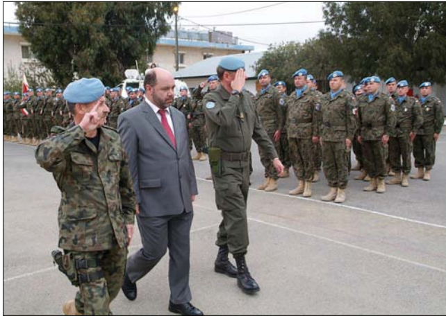
Visit of H.E. Jacek Chodorowicz the Ambassador of Poland to the Syrian Arab Republic. Participating the celebration of the Polish Independent Day at Posn 60 (9 th Nov 2007)