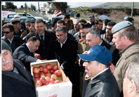
...and official authorities

The International Committee of the Red Cross (ICRC) – with UNDOF's support and mediation – negotiated with both the Syrian and the Israeli authorities. Finally both