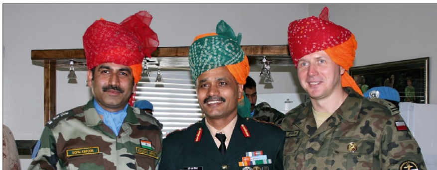
Every visitor got a colorful turban