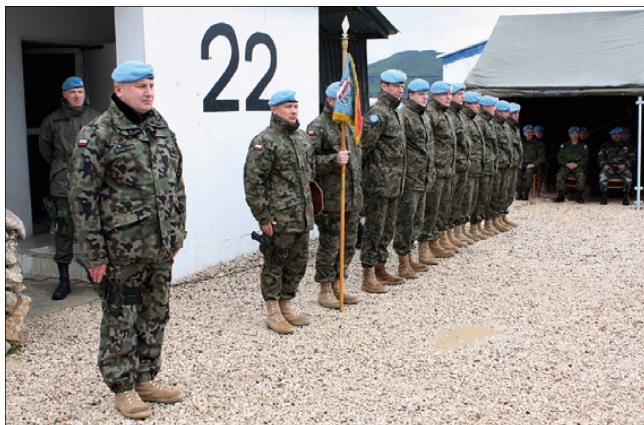
Outgoing Polish peacekeepers of Posn 22

In March 2003 Posn 22 was handed over to our comrades from POLBATT. Now six years later AUSBATT returned to the only UNDOF position located on A-Side.