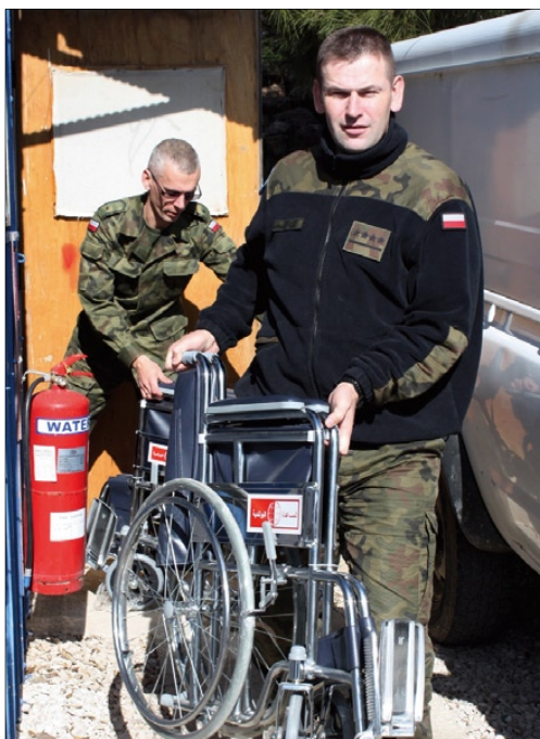
Wheelchairs donated by the Polish Embassy