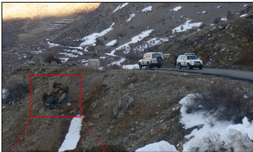
Accident near Pos 12...

The majority of UN accidents within the mission area is preventable and often due to speeding, driver inattention or carelessness. Sticking to the speed limits and driving with proper care and attention to the traffic and weather conditions would prevent accidents like that one occurred on 19 th March 2009. At about 15:30hrs three UNDOF soldiers on duty coming from Posn 12 were heading to Camp Faouar. About 500 meters after the Posn 12, reaching a from melt water wet double bend, the driver lost control of the Toyota 4-Runner. Furthermore, the vehicle got off the asphalt road, caught a slight height, rolled over above the terrain edge down the flank of the hill and stopped lying up side down on a dirt road. All involved soldiers were wearing their seatbelts what most probably saved their lives. After being checked in the Medical Centre in Camp Faouar amazingly no injuries were reported. Recovery and EOD Team did a challenging job on the spot to salvage the heavily damaged wreck.