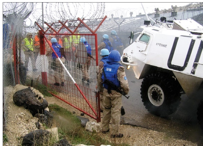
Demonstrating force with the SISU