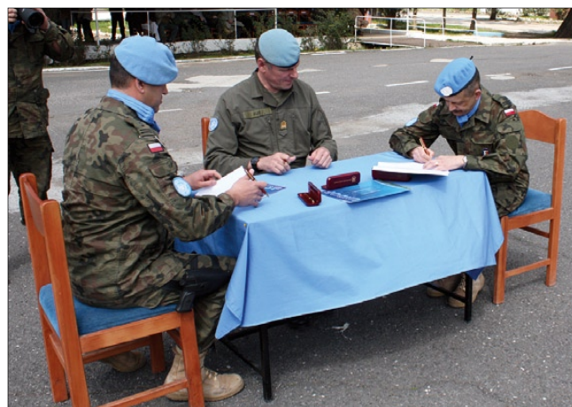
Signing the protocols of handover-takeover of duties

Since the morning this day in the camp of POLBATT a nervous atmosphere prevailed in connection with such an important event as the Change of Command. This is because the 30 th Rotation Polish Military Contingent had already finished its mandatory tasks formally and practically and the 31 st Rotation was taking over full responsibility for operational tasks. In spite of anxiousness, each soldier who participated in preparing the ceremony had known what he should do and it was certain that everything was properly organized.