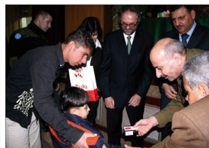
Presents for the children