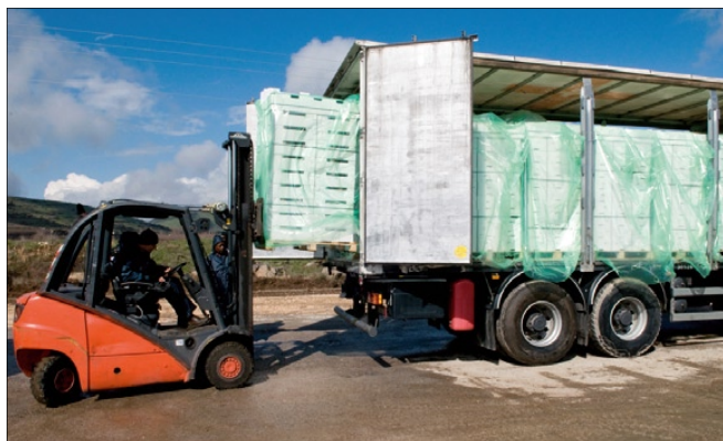
Apples were loaded on A-Side...

In early 2009 Operation “Apple Crossing” started on 17 th Feb in the Quneitra area. At 10:00hrs the first truck crossed the demarcation line between the gates and went through the Area of Separation.