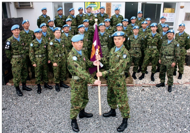
The soldiers of 26 th and 27 th Rotation of J-CON