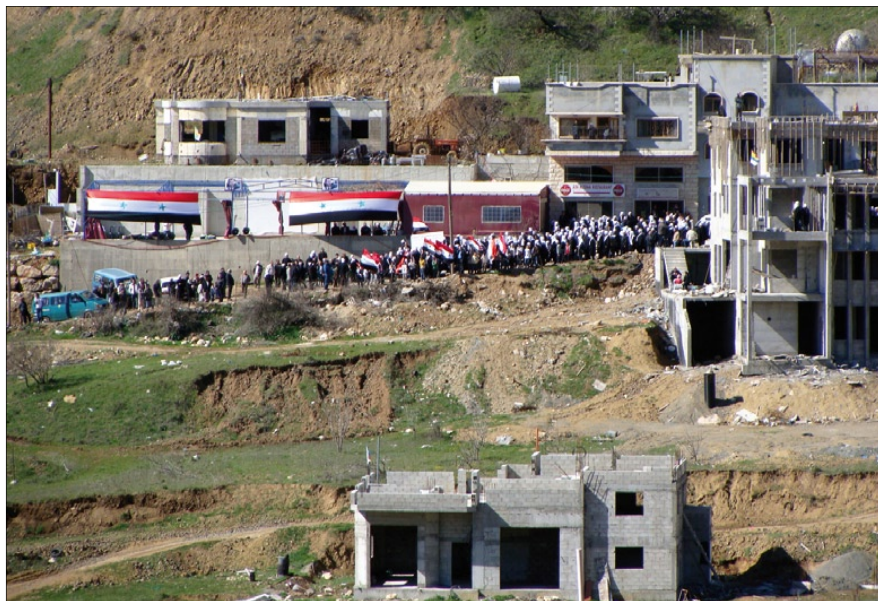
People gathering in Majdal Shams on A-Side