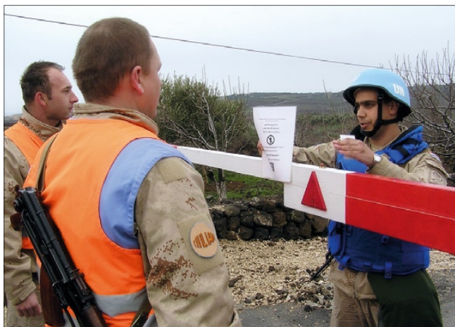
Demonstration of “local residents”