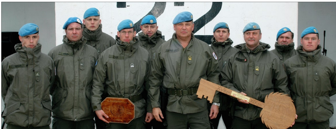
The new crew of Posn 22 with CO/AUSBATT and OIC 2 nd Coy