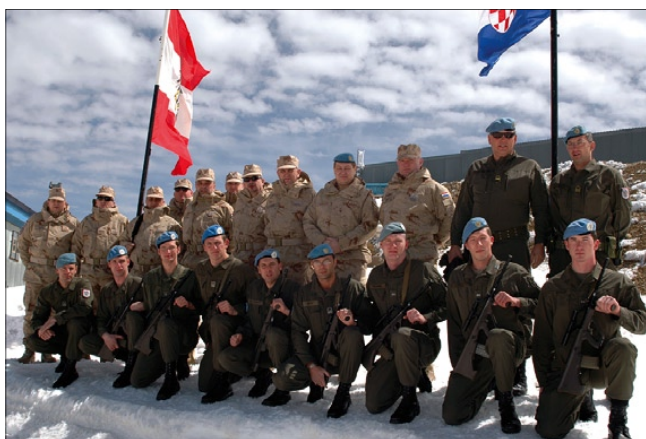
LtGen Kruljac Mladen, Commanding General, Croatia Land forces, supervised CROCON and evaluated its performance of mandated tasks under Austrian command (16 th - 19 th Mar 2009)