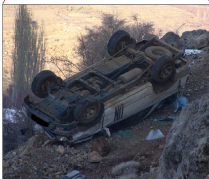
...luckily no one was injured!

Luckily no one was injured or killed in this accident although it could have been very different. The driving regulations are not set to hinder UNDOF members, but as a way to keep them safe and alive. Only by driving defensively and safely drivers will ensure they have done all they can to prevent an accident.