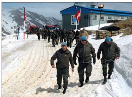
Arrival at Posn Hermon Base