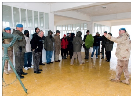
Storming weather at the Shouting place

Back down at Posn 12 the special guests enjoyed Austrian hospitality and traditional Austrian food and beverages before the convoy moved