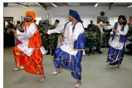
The "Bhangra" dance