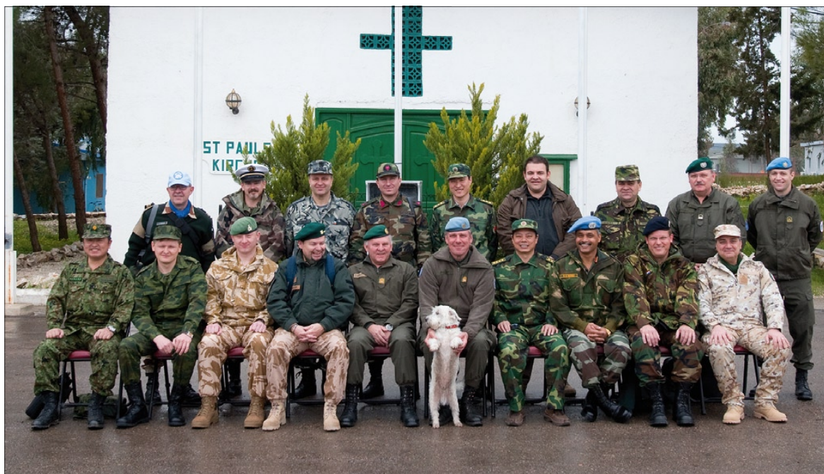
The Military Attachés

Two days which could not be more different but having the same effect - to b