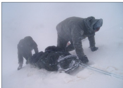
Search and rescue exercise

The 1 st Coy/AUSBATT deployed in the mountain area of UNDOF must fulfill its tasks all year, even when snow heights in winter up to ten meters make a combat service support within the coy nearly impossible and the proficient drivers of the over snow-vehicles face a big challenge.