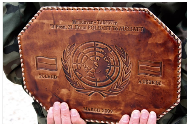
A present for comrades and friends

Posn 22 is unique because, except for Camp Ziouani, it is the only position on A-Side. This brings some organizational and operational challenges that have to be met. This Position is located on the border of the so called A1 Zone which is a demilitarized zone. This means that Israeli Defense Forces are only allowed to enter under special circumstances. Another aspect for the soldiers serving on this position is that after 17:00hrs the gates are closed and they are cut off the rest of