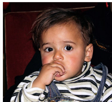
Smiling faces of children gives new motivation to peacekeepers