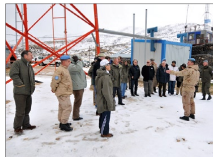
3 rd Coy briefing at Posn 17

pastries in the Austrian Officers Club at Camp Faouar. Despite the bad weather conditions the distinguished guests enjoyed their visit to UNDOF and gained some new impressions of peacekeeping during wintertime.