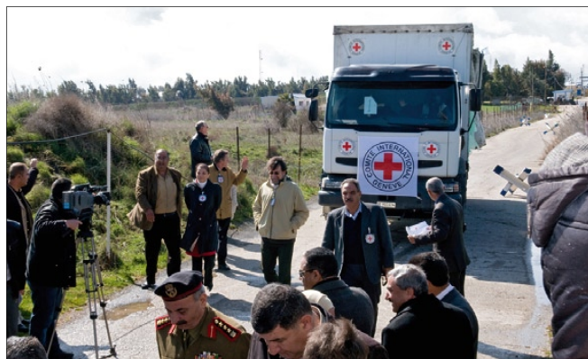
...and crossed the B-Gate in ICRC trucks

On the Israeli occupied Golan there are many apple farmers, mostly Syrian Druze and some Jewish settlers. Most of the population there lives at least partially on