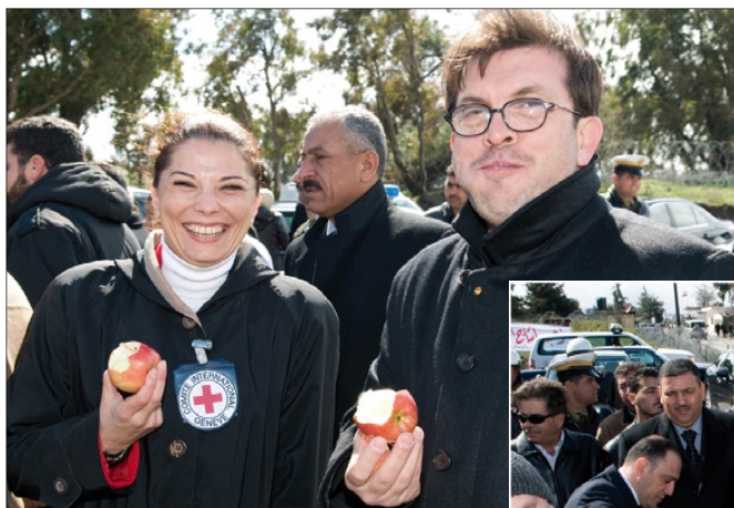
The first apples for ICRC members...

The ICRC had coordinators on both sides and UNDOF troops were well prepared to assist this important operation which was scheduled for six weeks and concluded on 31 st Mar 2009.