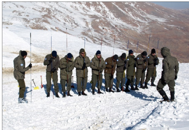
Training with avalanche searching equipment

All positions are self-supporting for food for about 30 days. Fresh rations will be delivered once a week to the positions, if the weather is good. Without the support and the flexibility of the 1 st Coy Supply Group, located in Camp Faouar, fulfilling these tasks is impossible. Water is made on each position