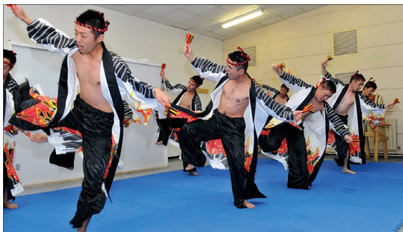
The traditional YOSAKOI dance