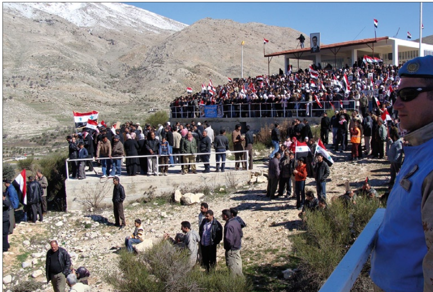
The crowded Family Shouting Place next to Posn 16 on B-Side

On Valentine's Day there is a kind of love shown by the separated families at the Family Shouting Place for more than 30 years; proclaiming their love through megaphones and seeing loved ones through binoculars.