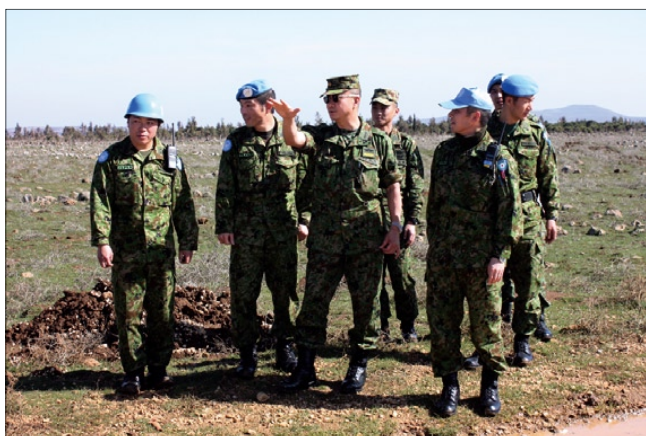
LtGen Shibata Mikio, Commanding General, central Readiness Force, Japan Ground Self Defense Force, supervised J-CON and evaluated its performance of mandated tasks (2 nd - 5 th Feb 2009).