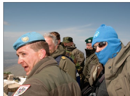
1 st Coy briefing at Posn Hermon South

ride uncovering amazing views on the landscape. And they were even more impressed by the mobile and static displays and presentations of some of the types of operations and equipment necessary to fulfill the mandate of UNDOF in the moun-