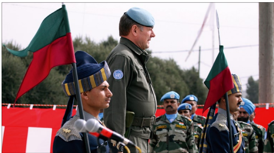
FC followed interestedly the ceremony

The aura in Camp Ziouani (CZ) was full of enthusiasm as the Indian contingent was preparing for a grand occasion in the form of celebrating their Republic Day which was evident on the faces of INDCON soldiers which were beaming with joy and pride.