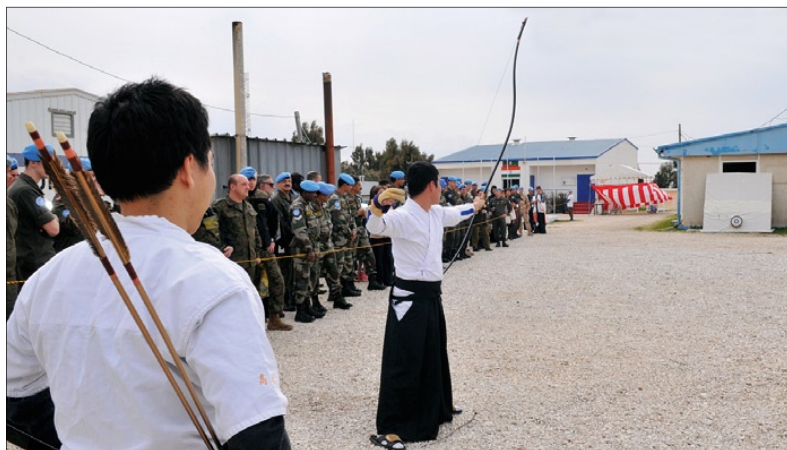
Japanese archer demonstrate their skills