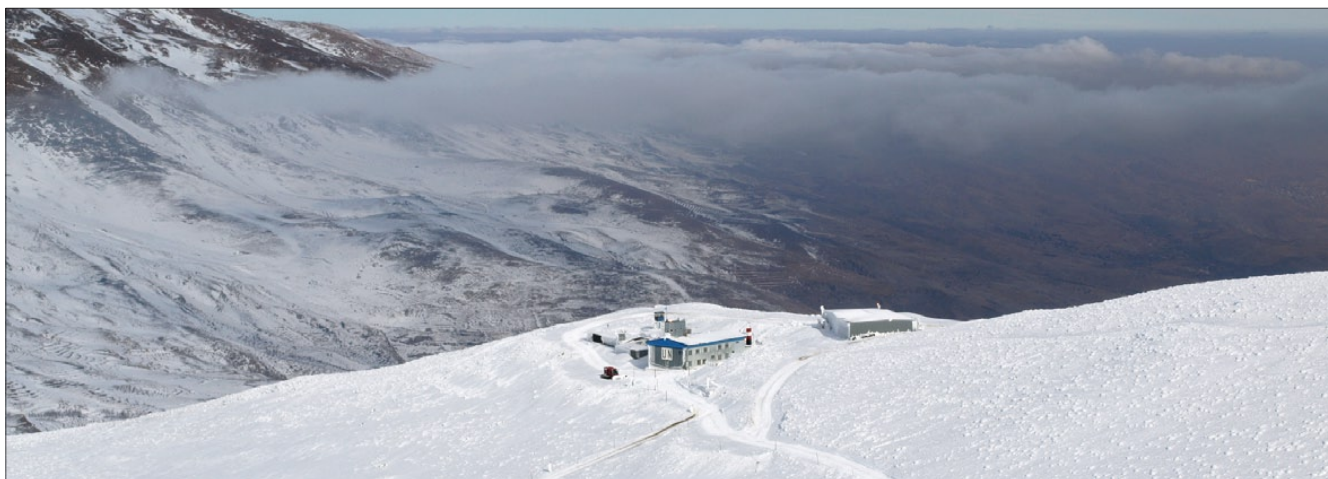
Posn Hermon Base (2240m) - view from the nearest peak the so-called "Hausberg"

Article and Photos by Capt Werner Muckenhammer OIC 1 st Coy/AUSBATT