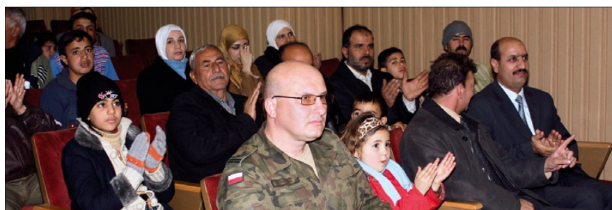
Grateful applause for the donors