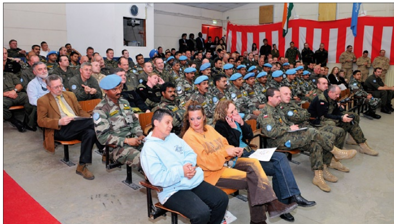
Spectators in the KHETAPAL HALL