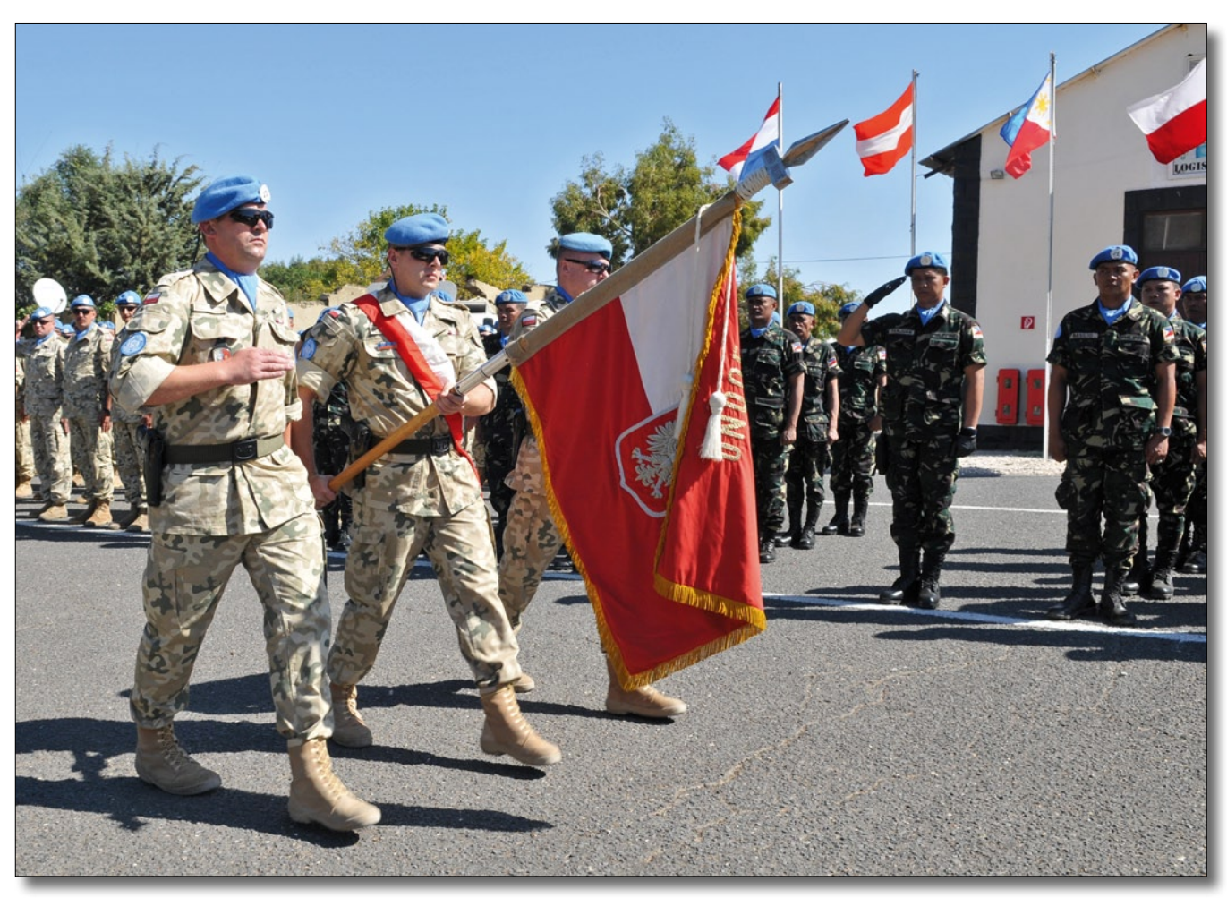
Polish Colour Party marches on to their last parade

In his affecting speech the CO POLBATT thanked all Polish peacekeepers for their efforts and service for peace on the Golan Heights and expressed his gratitude to all the peacekeepers of the other