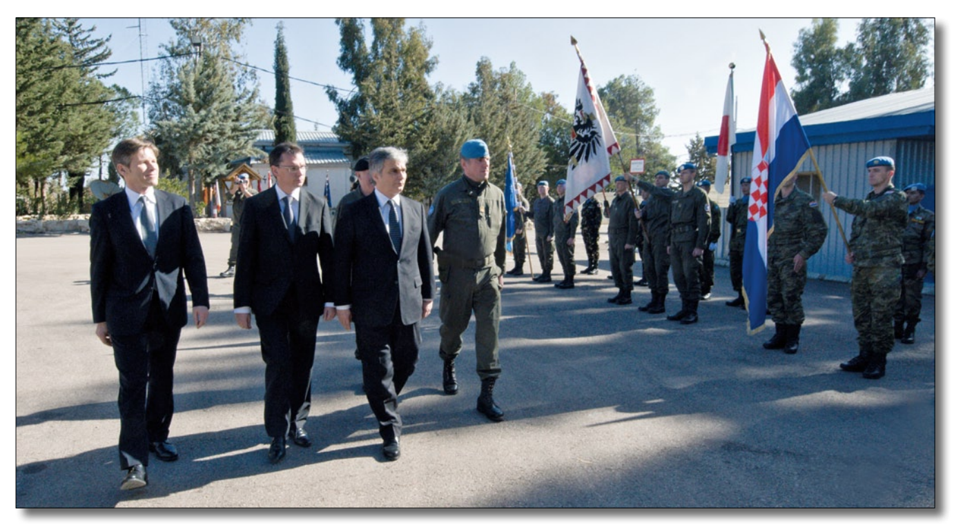
Guard of Honour in Camp Faouar