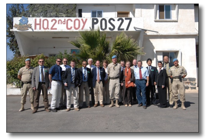
14 students of the Royal College of Defense Studies, United Kingdom, visited UNDOF HQ and UNDOF Positions 27 and 37 (5<sup>th</sup> October 2009)