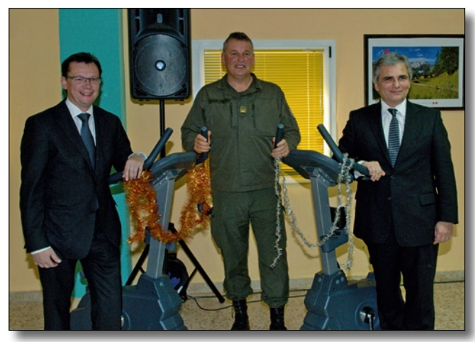
Christmas gifts handed over to CO AUSBATT

of view and learn more about their experiences within the mission.