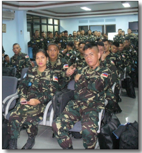
Before departure at the airport

gent. PHILCON is likewise committed to the pursuit and attainment of UNDOF's high performance in maintaining peace and stability in Golan Heights, an expression of the sincere commitment of the Filipino people to promote world peace.