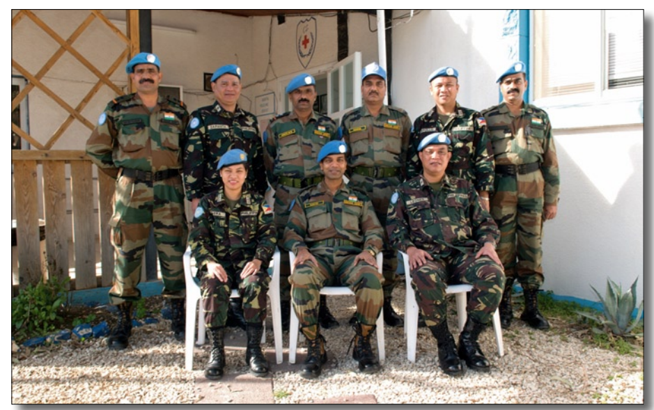
Integrated medical team in Camp Ziouani