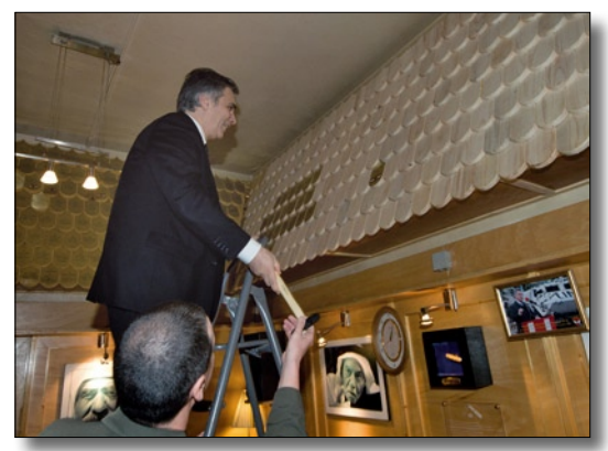
Shingle nailing in the Austrian Officers Club

The delegation had the opportunity to see for itself the high level of motivation and the professional work