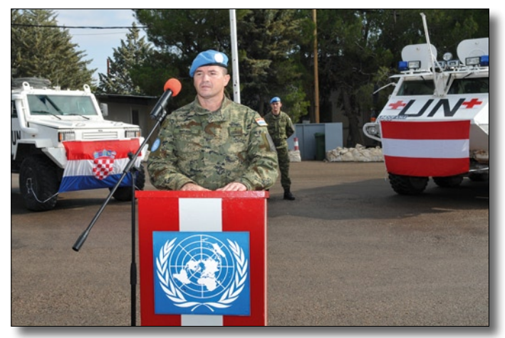
New CO HRVCON addresses the parade