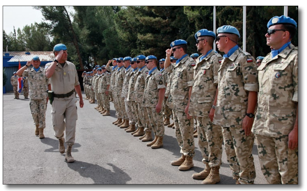
FC inspects the troops

Article by Cdr Tadeusz Bicz, a/COS UNDOF