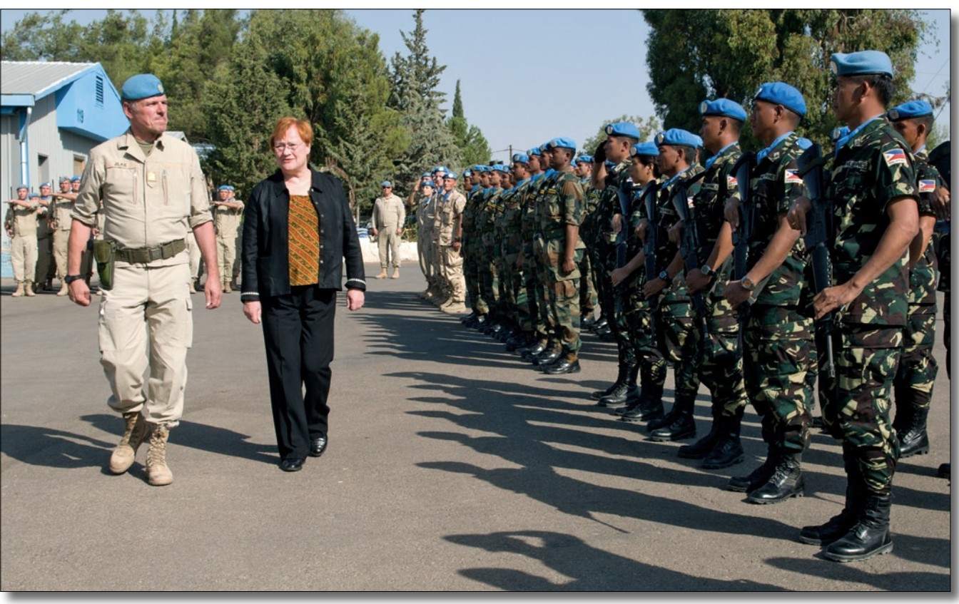
President Halonen and FC inspecting the troops