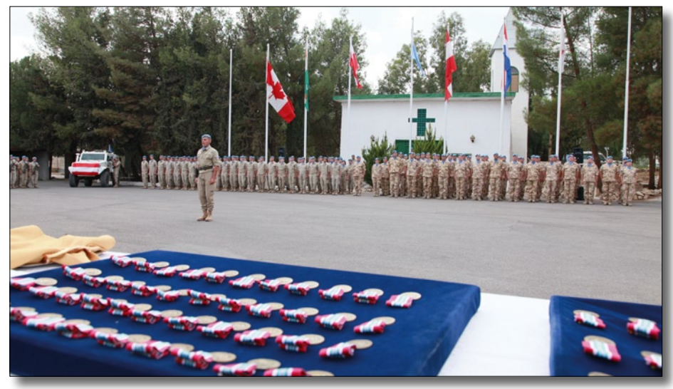
Medals ready to be presented to the troops