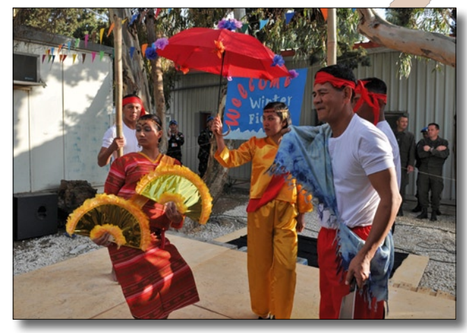
"PHILBATT princes" dances the Singkil