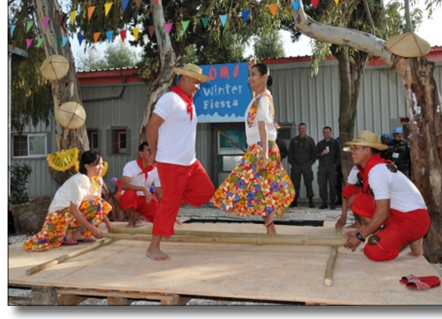
"Tikling birds" hopping over bamboo traps

mates, the dry season from November to April and the wet season from May to October. It sits astride the typhoon belt where it suffers an onslaught of typhoons particularly