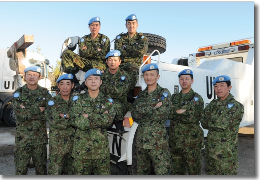
J-CON's Camp Faouar Detachment

This kind of thing sometimes happens, however, this was compounded by the problem that the recovery team designated on this day was a stranger to the area at the time. But even if the recovery site is somewhere we have never been, we have to go, we are responsible for all of the B-Side!