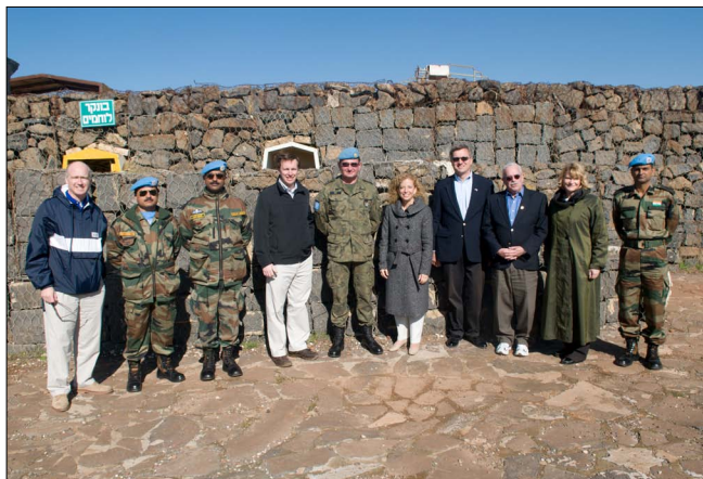
21 members of an American Congressional Delegation visited Camp Ziouani (6 th January 2010)