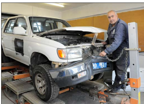
The dozer in the body shop in Camp Faouar

Driver training and the regulation of Driver Permits is also an