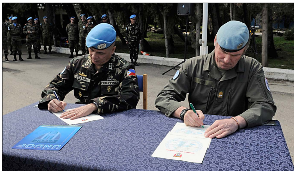
Outgoing and incoming Force Commander signing the handover documents

home nations and within the United Nations, the fellow peacekeeping missions of the region, the