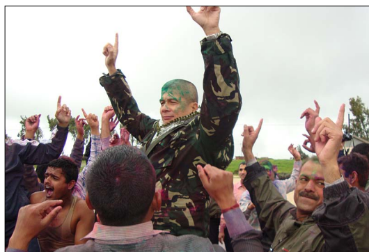
FC UNDOF celebrates Holi with INDCON

H oli marks the end of the winter gloom and rejoices in the bloom of the spring time. It is the best time and season to celebrate and Holi provides this opportunity. On this day, colors fill the