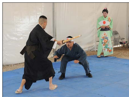
Performing the Ninja skit