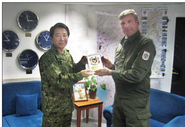
MGen Shiro Matsukawa, Commanding General of 11 th Brigade, Japan Ground Self Defense Force, visited UNDOF installations on A- and B-Side (25 th – 28 th January 2010)