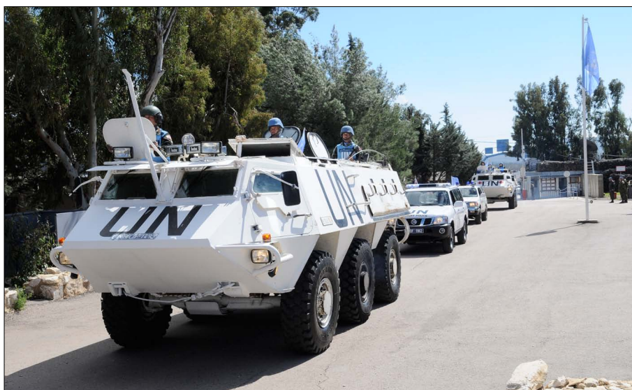
Roll-past of a variety of UNDOF vehicles

Overall it was an excellent day where the members of UNDOF showed their professionalism and skill on parade to an appreciative audience, and marked the occasion of Change of Force Commander in a fitting