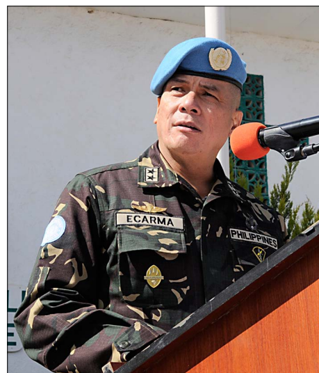
MGen Ecarma III gives his first speech as FC UNDOF

the message that UNDOF is a modern and mobile force that is much more than a series of static positions.