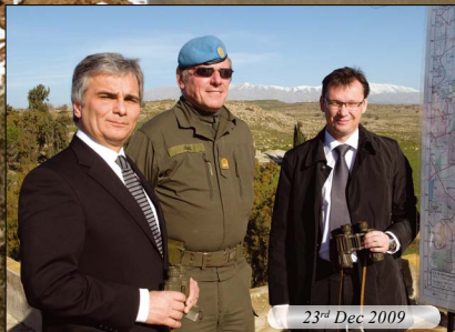
Austrian Chancellor & MOD