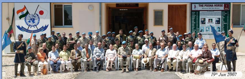
Ambassadors Day A-Side