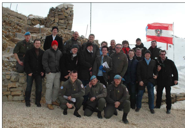
Mr. Michael Spindelegger, Austrian Foreign Minister, visited AUSBATT Positions (19 th – 20 th February 2010)