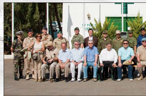
Ambassadors Day B-Side