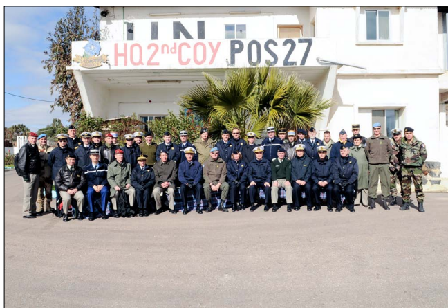
37 members of the Center for High Military Studies (CHEM), France, visited UNDOF HQ and UNDOF Positions (26 th January 2010)