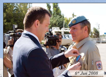
Slovak Peace Medal