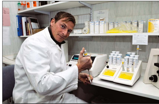
Chief Laboratory analysing blood samples

There is one Laboratory Technician and the Chief Laboratory Officer, all from Austria, who sit behind their microscopes and keep an eye out for harmful germs. Perhaps you have already seen one of us with a huge cooling box collecting water