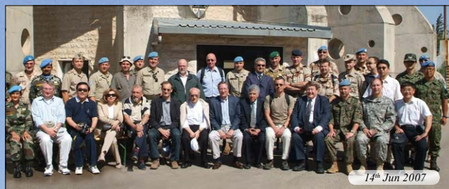
Ambassadors Day B-Side