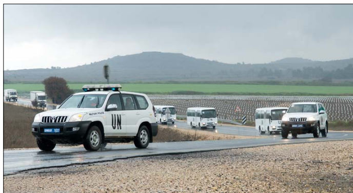
Convoy on the road