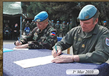
Handing over FC UNDOF