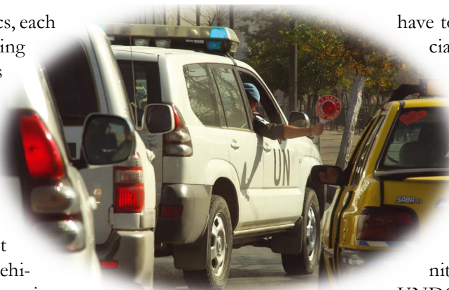
MP channels the convoy through congested traffic

When carrying out cash escorts, for example, a marked MP vehicle will not be used. A regular UNDOF vehicle will be used in its place to maintain a low profile and avoid drawing unwanted attention.