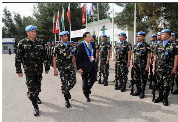
FC, DCO PHILBATT and Hon. Romulo inspect the parade