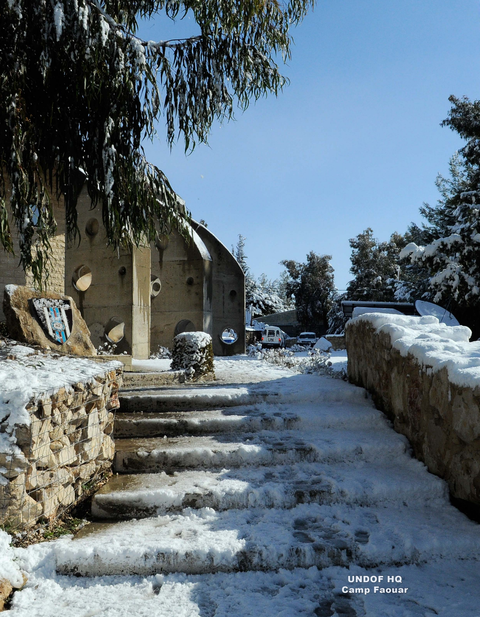
UNDOF HQ Camp Faouar