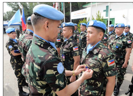
CO PHILBATT presents the UNDOF medal

But being the first is not easy. We have exerted all our efforts to make sure that the utmost degree of impar-