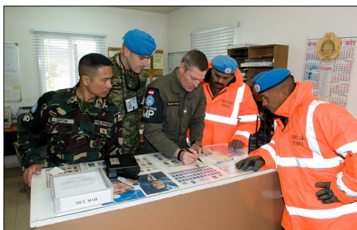
Issue of orders at the MP Detachment

Completely different and even more demanding are the escorts of larger convoys in such cases as military rotations or VIP visitors to the mission. Although the MP is not charged with close protection tasks in UNDOF, their presence enhances the security of the VIP with a visible armed escort.