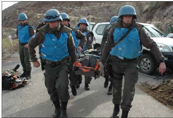
Transportation of a casualty

Exercise – Exercise – Exercise! These were the loudspeaker announcements regarding practice alarms or orders via radio communication as AUSBATT started its three day exercise on Wednesday, 3 rd Mar 2010.