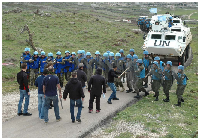
AUSBATT show of force

Following an after action review of the exercise with the directing staff and exercising unit commanders, the official end of the exercise was declared. The experiences gained