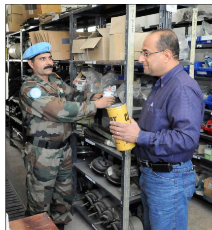
Spare parts stores in Camp Faouar

The Transport Section is able to provide an efficient and road worthy vehicle fleet to UNDOF that is necessary to maintain operational effectiveness of the mission. This is achieved by commendable harmony