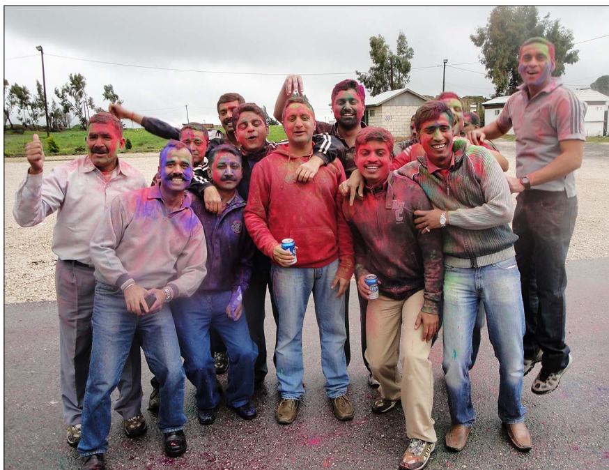
Dancing, singing and making merry while celebrating Holi