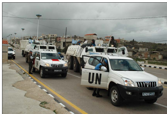
RRG investigates an unauthorized vehicle

will be evaluated and used for the next mission preparation as well as for AUSBATT's plan of action.