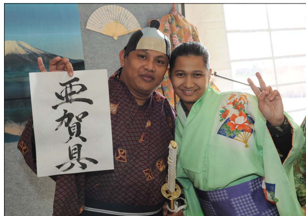
UNDOF members enjoying Japanese culture