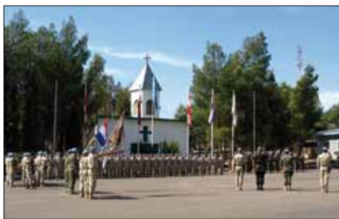
Saluting the flags

The ratification of the “Act of Neutrality” on the 26 th October 1955 is still a topic in today's Austrian security policy. For many years the Armed Forces have focused on the “Austrian National Day” and have used this as an opportunity to demonstrate their readiness and effectiveness to the people of Austria. Hundreds of thousands of citizens participated in the exhibition of the Armed Forces at the “Heldenplatz” at Austria’s capital Vienna this year.