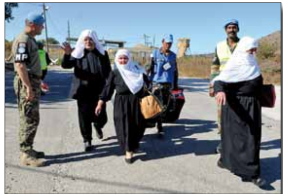
Druze Pilgrims heading for Abel's Shrine

In the first quarter of this year, one Syrian male was taken into custody by Israel after being captured crossing the A-Line and the Technical Fence. This person was repatriated with the support of UNDOF to Syria.