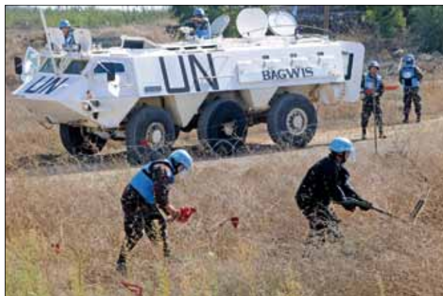
PHILBATT EOD team searches for UXO's or mines