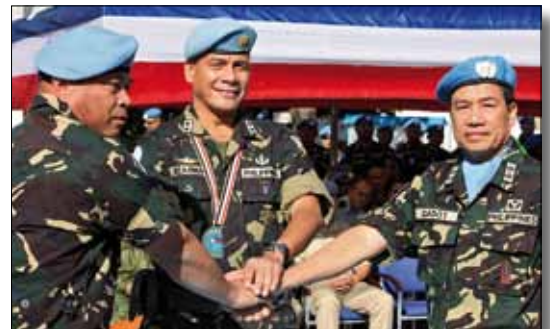
Concluding the handover ceremony

He also assured the Filipino community and the other contingents of UNDOF that the 3 rd PHILBATT will respond to the call of duty for the service not only of his but the