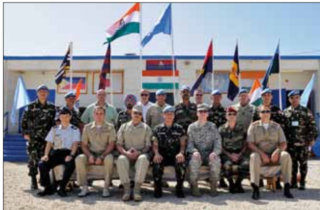
Military Attachés in Camp Ziouani

On 12 th and 13 th October 2010, a group of Ambassadors and Military Attachés visited Camp Ziouani where the Philippine, Indian and Japanese Contingents are located.