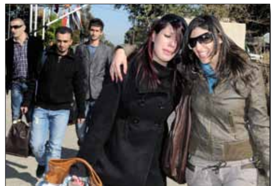
Students cross to A-Side for vacations at home