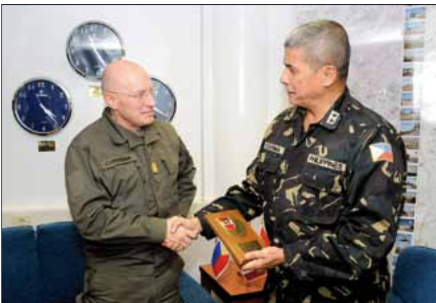
LtGen Othmar Commenda, Deputy Chief of Staff of Austrian Armed Forces, visited Camp Faouar, AUSBATT positions and met with FC UNDOF (12 th -14 th December 2010)

• MGen Berndt Grundevik, Commander Land Component Command, Sweden, visited Camp Faouar and OP 71 and met with COS UNDOF (4 th October 2010)