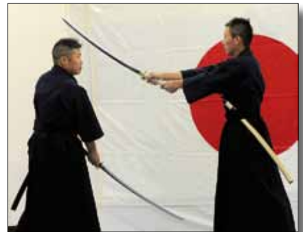
The presentation of Martial Arts