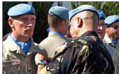
...as well as his Austrian comrade.

countryside provided for a homelike feeling and showed the beauty of the country to the guests and UNDOF comrades.