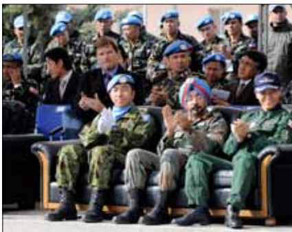
The guests of honor applaud

The medal parade of J-CON is accompanied by bugle blowing, in accordance with Japanese custom. 46 men under the command of CO