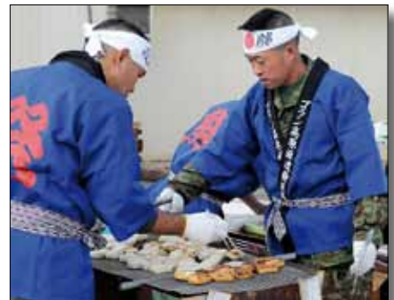
Traditional Japanese dishes