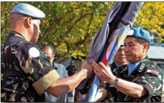
Handover of the flag

troops to start it right. “Certainly there will be challenges but it could be readily overcome with the right frame of mind, right focus, firm resolve and strong determination” he added. “Perfect job performance and excellent conduct in the service for global peace must be the battle cry of each personnel”, he said. He furthered that all the members of his contingent are ready to perform in