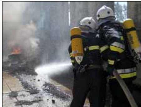
...and the fire extinguished

siren. The preparedness and occupation of bunker drill was found to be of extremely high standard and in accordance with the directives of UNDOF.