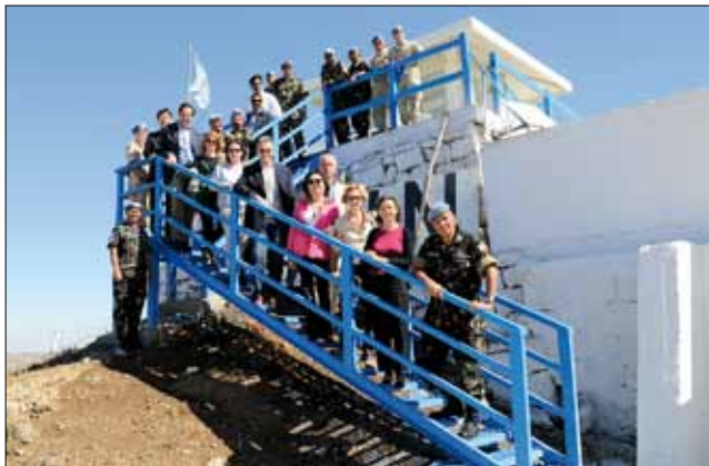
Ambassadors visiting OP 51

the Troop Contributing Countries of UNDOF and UNTSO. Troops to demonstrate their readiness.