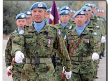
J-CON soldiers parade after the ceremony