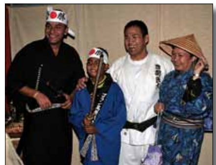
Delighted guests of the J-CON Day