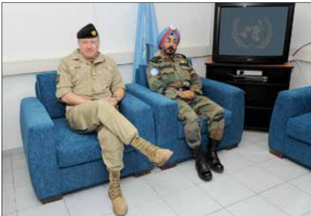
LtGen Günter Höfler, Commander of Austrian Armed Force, visited Camp Faouar and AUSBATT Positions (9 th -12 th November 2010)