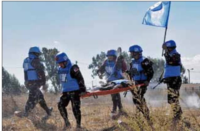
Mine clearing presentation by PHILBATT

Afterwards they traveled back to Camp Ziouani to witness an array of dynamic and static displays courtesy of the Philippine Battalion. These included Rapid Reaction Group (RRG) performing checkpoint operations, mine clearing, patrolling, medical evacuation and static display of EOD equipment and the visit to the Tradition Hall where previous contingents displayed their wares, accomplishments, replicas and memorabilas. Sumptuous lunch was later served at the International Kitchen.