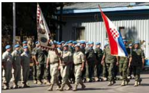
The flagbearers marching in

After the conclusion of the Medal Parade the Austrians took the opportunity to present regional delicacies such as cheese, bacon, sausage and also Austrian wine and Austrian beer. Almost every region of Austria had a local tidbit to offer and musicians, the “Mooskirchner”, performed to their best to produce a nice and comfortable atmosphere. Posters on display of the Austrian