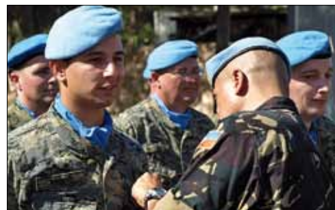
A Croatian soldier receives his medal...