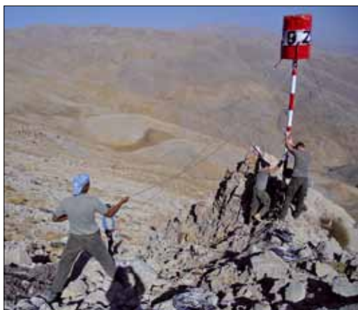
...and the barrel securely put in place