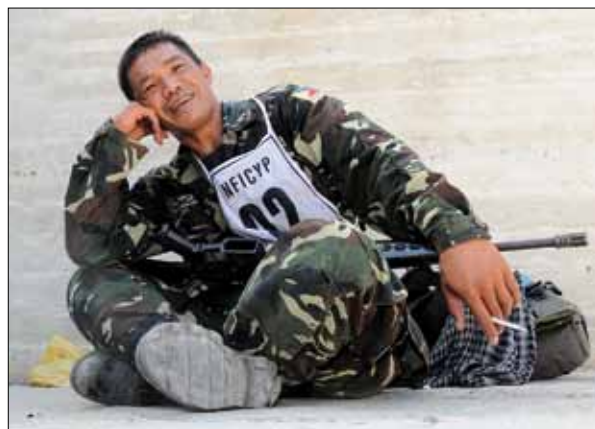
A well deserved rest

The winning prizes were handed over by the different stand directors,