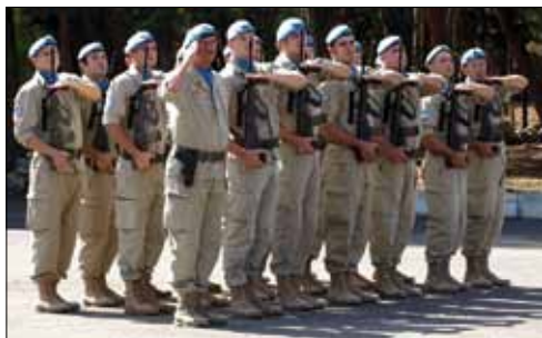
The honorary unit presents arms

Austrian Peacekeepers on the Golan Heights like to celebrate the National Day in a grand manner as well. This year the Austrian Contingent again prepared this celebration with a lot of devotion. Meetings were held, instructions and letters penned, ideas collected and finally implemented. The celebration MUST be held under a dignified coverage! In the early afternoon of 26 th October