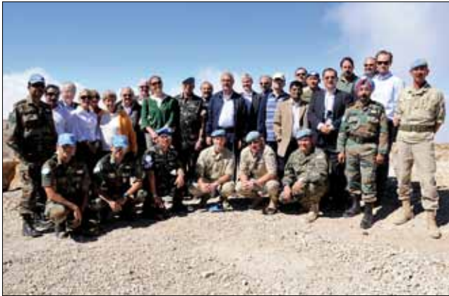
Ambassadors summit meeting at Hermon Hotel

A very special annual event for the honorable guests of A good opportunity for the UNDOF