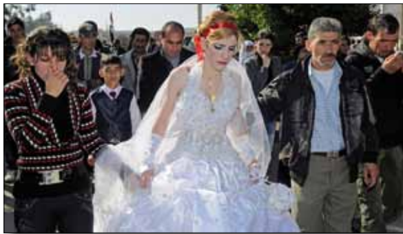
Tears after the denial of crossing

To alleviate the problems encountered by the Druze population living on both sides of the ceasefire