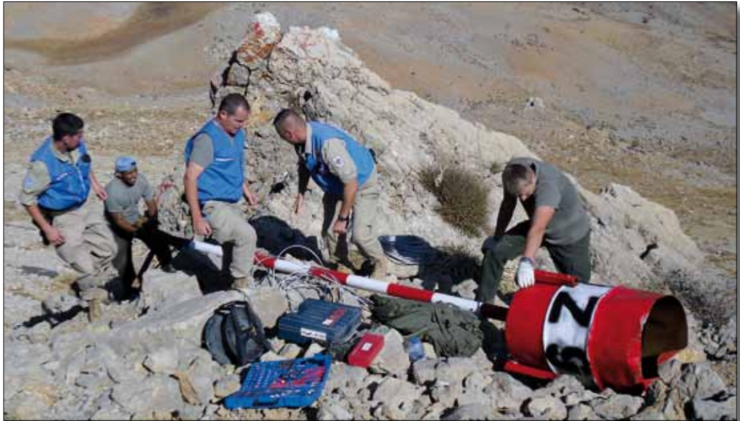
The foundation for Barrel Z9 is prepared...

Long and exhaustive marches with equipment and material were necessary. In areas without the possibility