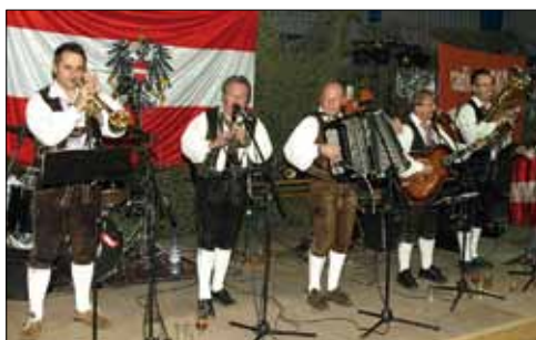
“Die Mooskirchner” - a traditional Austrian band

Austrian Peacekeepers on the Golan Heights like to celebrate the National Day in a grand manner as well. This year the Austrian Contingent again prepared this celebration with a lot of devotion. Meetings were held, instructions and letters penned, ideas collected and finally implemented. The celebration MUST be held under a dignified coverage! In the early afternoon of 26 th October