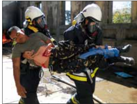
A victim is rescued...

reached swiftly at the spot. The area was cordoned off by the RRG and simultaneous actions were taken to extinguish the fire swiftly. Later on in the afternoon it was told that arty shelling had taken place in the CZ which resulted in occupation of respective bunkers on sounding the