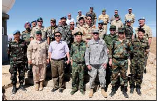
Military Attachés enjoying perfect weather

Major General Natalio C. Ecarma III, the Force Commander of UNDOF invited for 6 th and 7 th October 2010 in Syria accredited Ambassadors and Military Attachés of the UNDOF and UNTSO Troop contributing Countries to visit Camp Faouar and Mount Hermon in the AOR of AUSBATT.