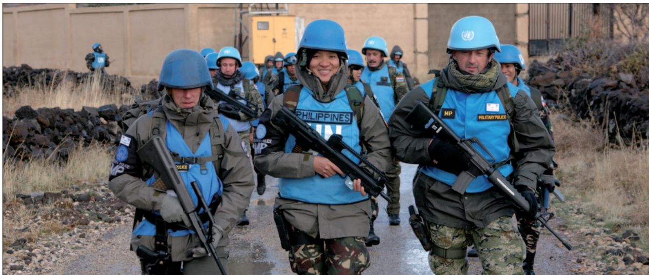
UNDOF peacekeepers marching

On 19 th Sep 2011 the 7 th HRVCON organized the first "Commando Patrol" called Vukovar March in commemoration of all the victims of Vukovar.