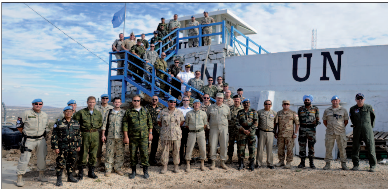
The military attachés at Posn 51