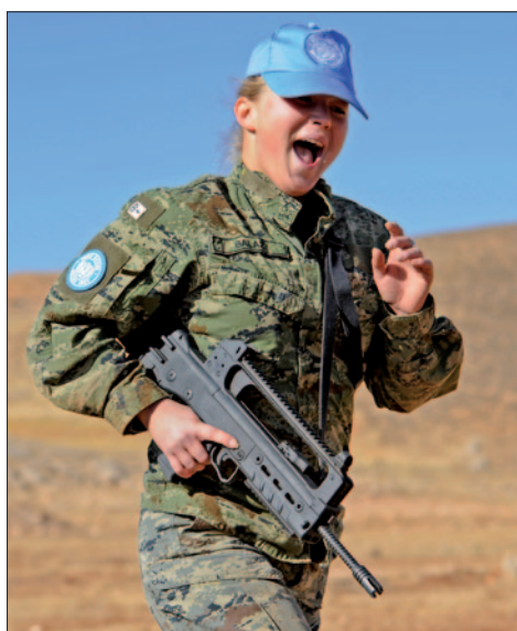
Women and men alike...