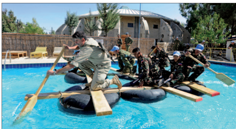
Teamwork was the key to master the raft and rowing task