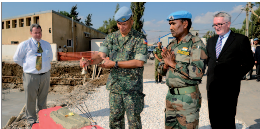
The FC participating in the Indian blessing ritual