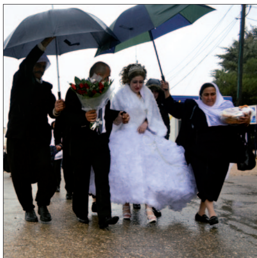
...the ICRC managed humanitarian crossing