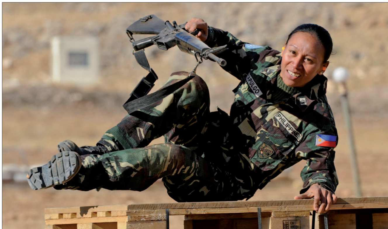
Participants had to hurdle an obstacle course before the shooting competition

On 21 st Oct 2011 ten teams participating in the UNDOF Ultimate Challenge skills competition once again stood as an example of UNDOF leadership, followership, discipline, esprit-de-corps, and the iron will to excel.