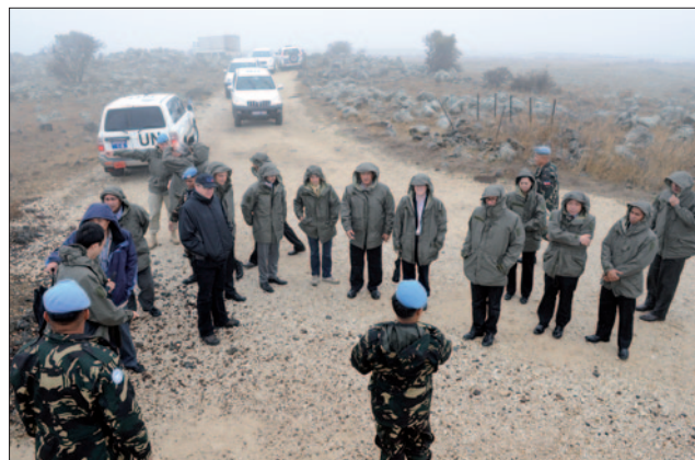
Terrain briefing in PHILBATT area

hosted by AUSBATT and displays organized by the Austrian, Croatian and Force Headquarters Companies.