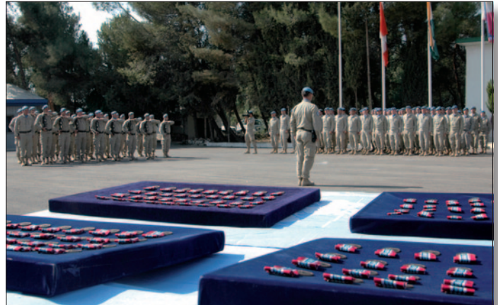
Troops lined up at the parade square