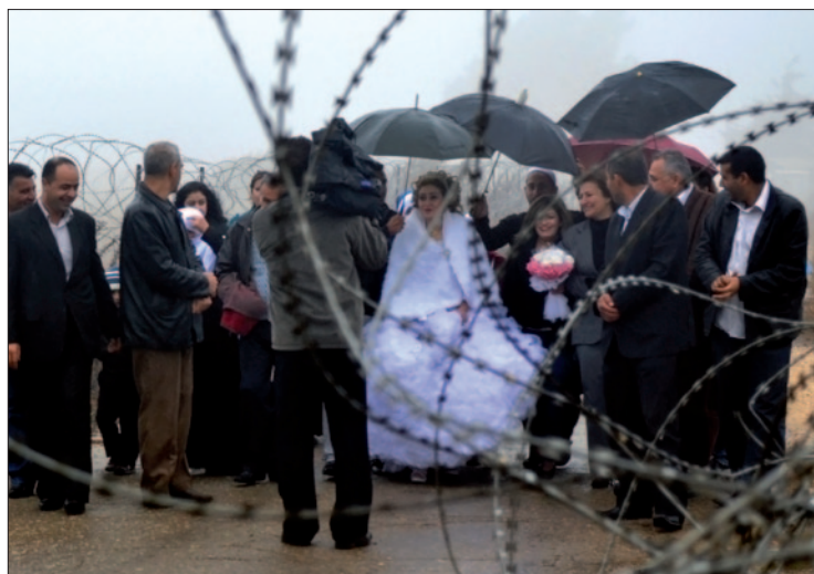
Once in a life time opportunity for the families to meet