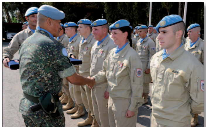
FC awarding the medals to the Austrian peacekeepers