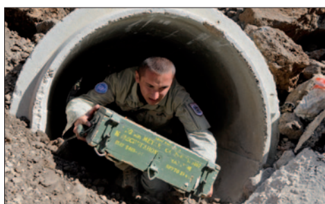
...giving their best to succeed