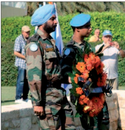
CO INDCON laying a wreath