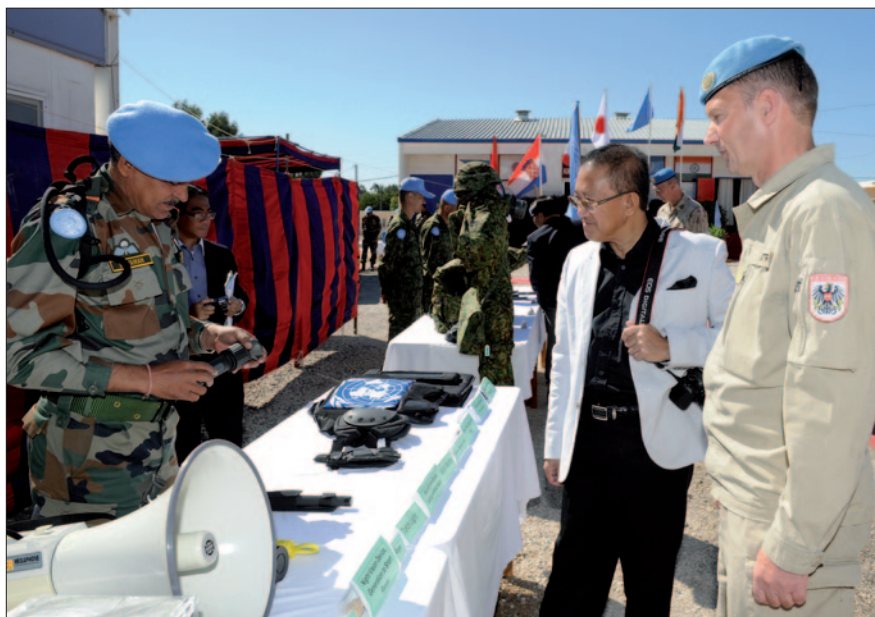
The equipment display striking a chord with the honorable guests

as UNDOF. The days concluded with lunch hosted by PHILBATT, with lively discussion between hon-