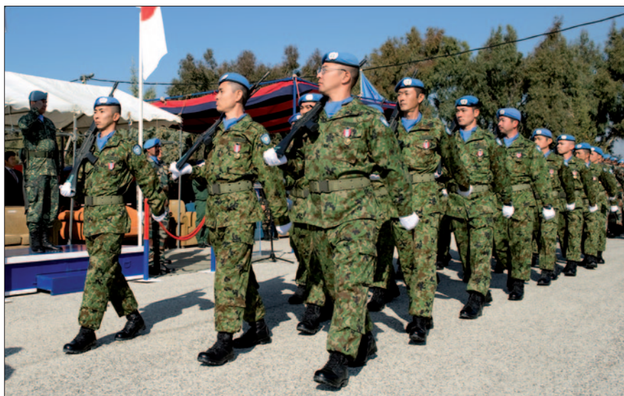
J-CON peacekeepers parade decorated with the UNDOF Medal

Back at Khetarpal Hall J-CON demonstrated martial arts and hilarious Japanese entertainment called Ninin-Baori. The final act was a comedy based on an old tale called Momo-Taro which is a famous children's story in Japan about a boy born from a peach. The peach boy was raised by the old couple that found him, to be brave and kind. One day, the elders called on Momo-Taro to recover village treasures stolen by terrible ogres. The peach boy journeyed to the ogre's Island of Onigashima with 3 animals in company; a dog, a monkey and a pheasant. Momo-Taro triumphed in a severe and funny battle, and his colleagues retrieved the treasures from the ogres. Back in the village, peach boy was welcomed as a hero.