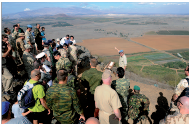
Terrain briefing at Mt. Bental