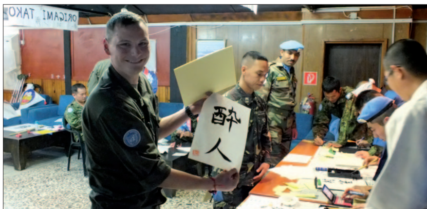
In great demand - Japanese calligraphy