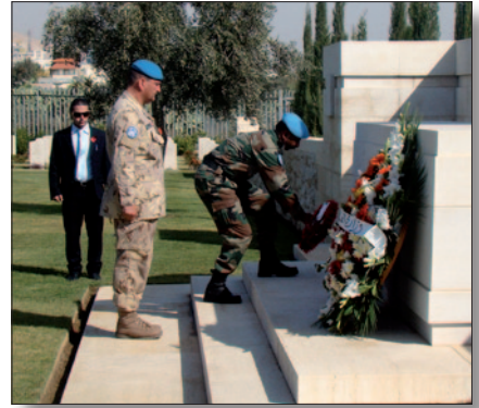
Wreath laying at the war cemetery