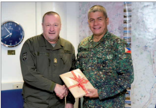
LtGen Günter Höfler, Commander of Austrian Armed Forces, visited Camp Faouar and met with FC UNDOF (22 nd Dec 2011)