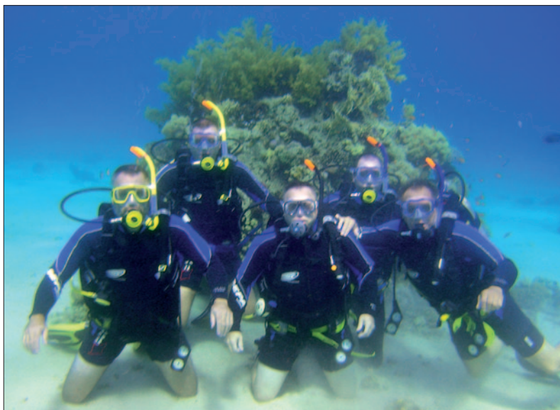
Joint off-duty activities foster team cohesion

that are both physically challenging, fun and result in an enhanced level of camaraderie and team cohesion. Who would have thought that windsurfing, kayaking or paddle boating would benefit Team Hermon. Well, when the day begins