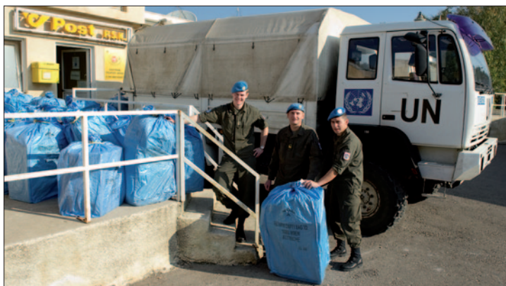
The Field Post Master handling Christmas mail