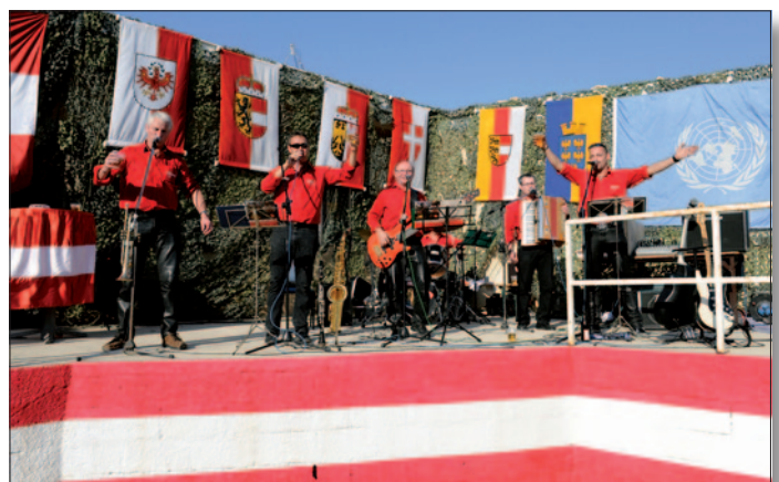
The "Pibersteiner" performing in Camp Faouar