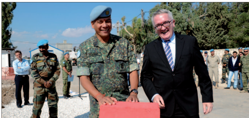
Force Commander and Chief Mission support laying the bricks