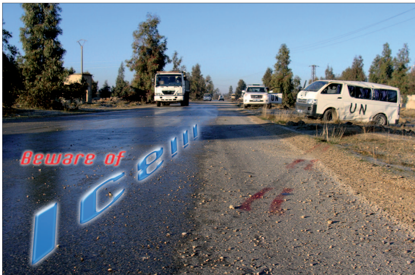
Even when driving slowly many changing road conditions may surprise drivers