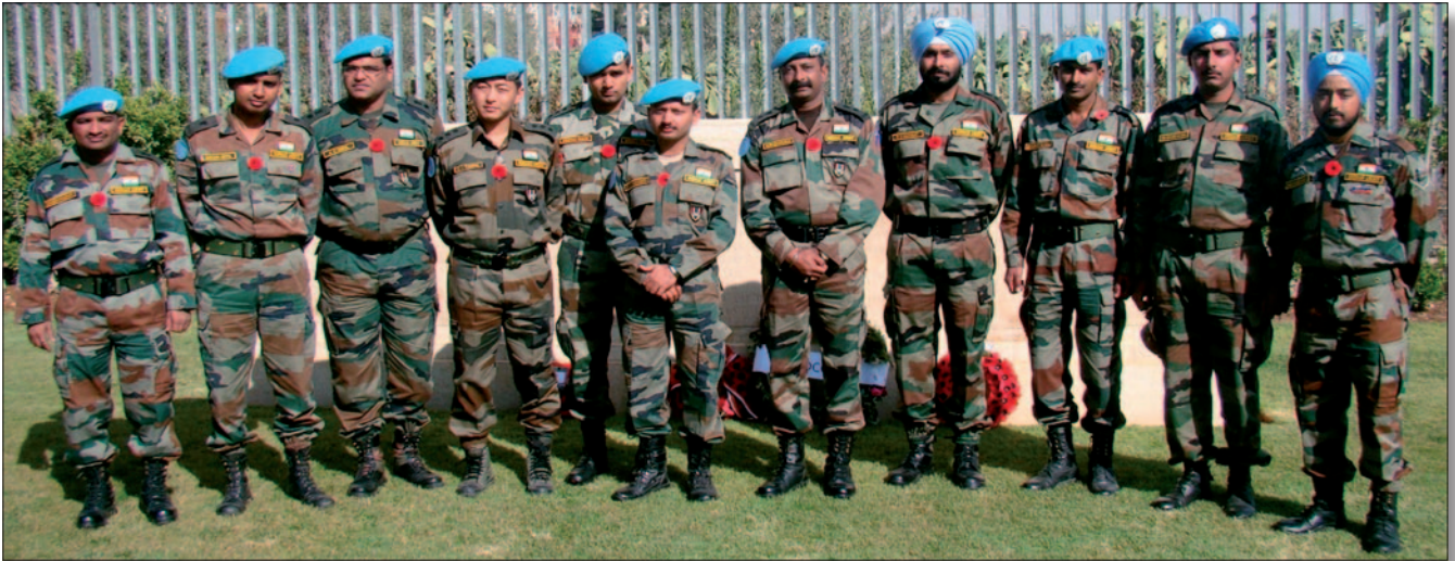
INDCON peacekeepers of UNDOF at the ceremony