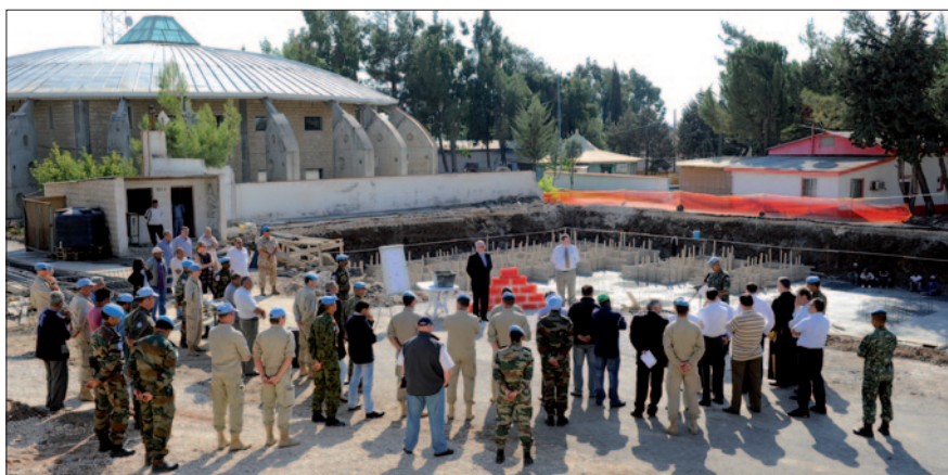
The new building site next to the UNDOF HQ building