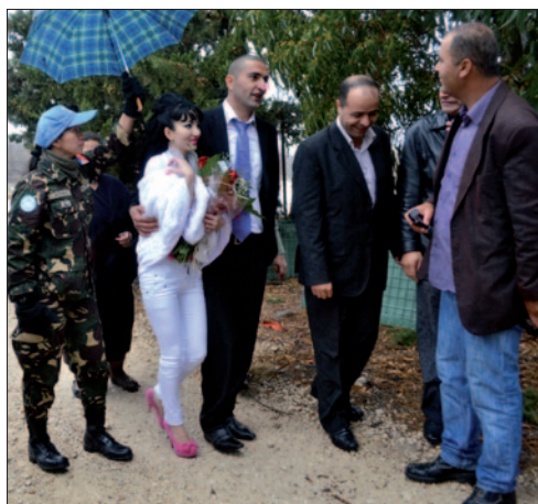
UNDOF peacekeepers support...

Love is a much splendid fabric of human life and it finds its way even between lovers of a folk separated by war within the UNDOF Area of Separation (AOS) here in the Golan Heights.