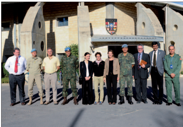
UNHQ Operational Assessment Team visited Camp Faouar (17 th -22 nd Oct 2011)