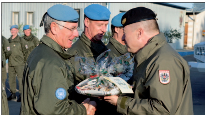
LtGen Höfler hands over Christmas gifts