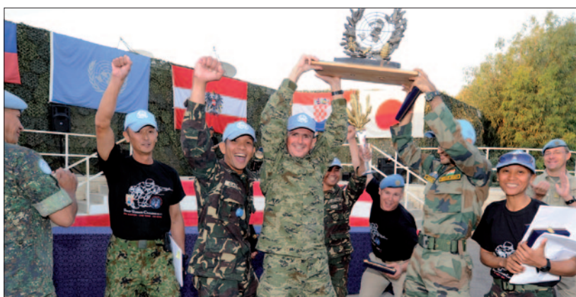
The overall winners - exultant and happy