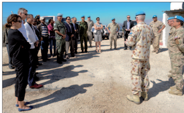
Briefings by the FC in Camp Ziouani and at OP 51 informed about the UNDOF mission