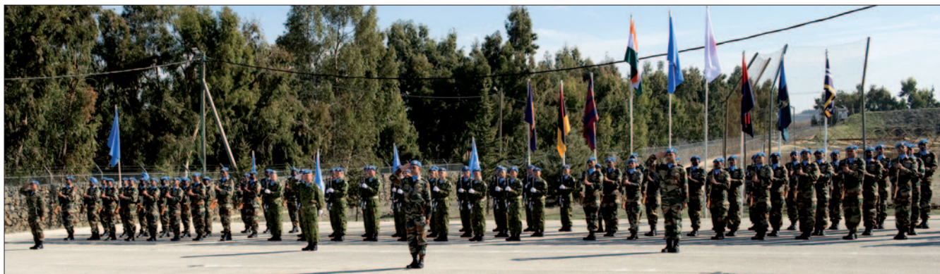
Indian and Japanese Contingents at the parade ground in Camp Ziouani