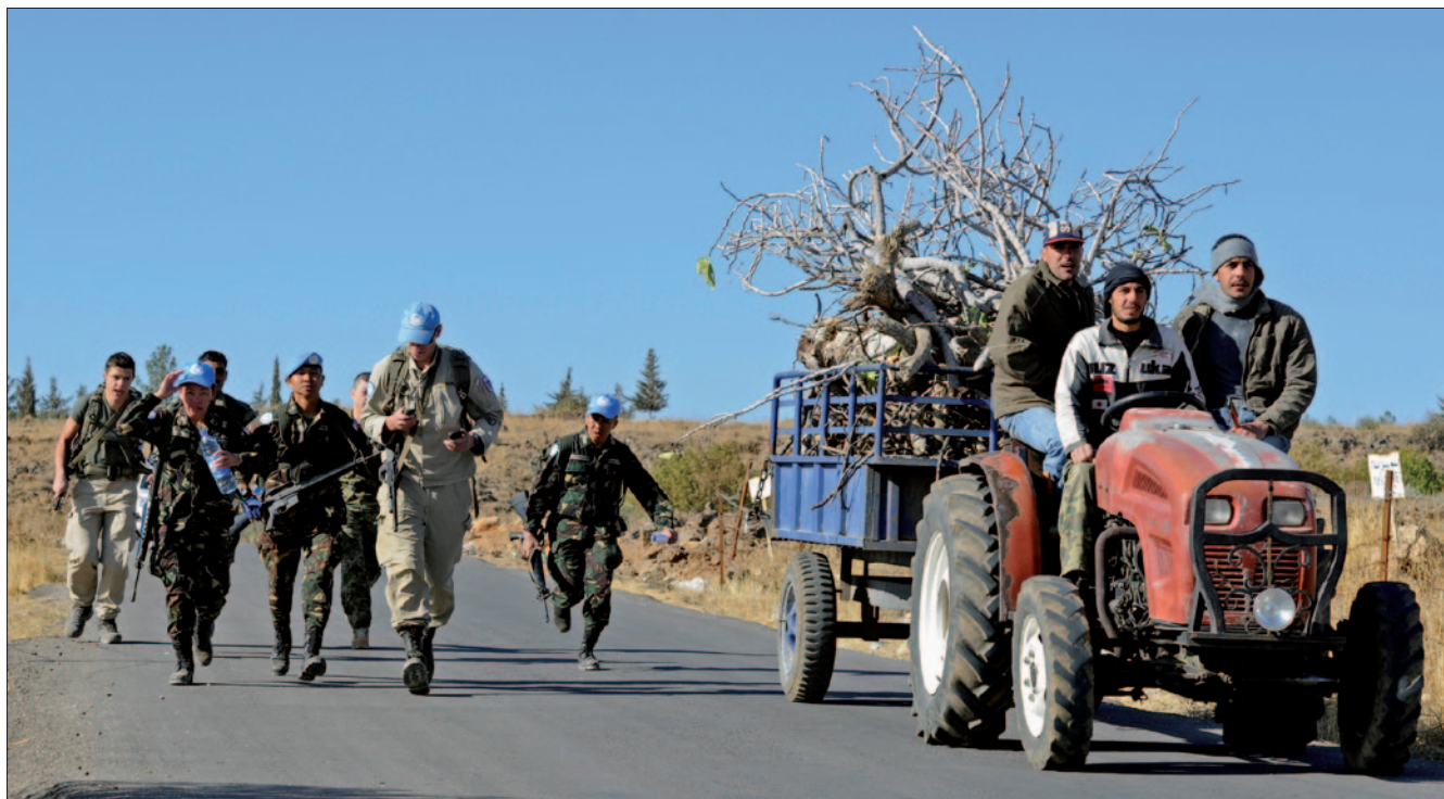
The eight kilometers endurance run - hot and dusty