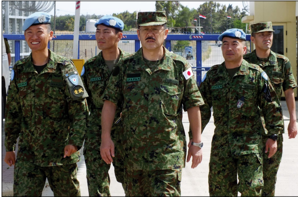
LtGen Haruyuki Hirano with CO/J-CON

During the months of April and May, many VIPs visited Camp Ziouani to view J-CON activities and encourage the Japanese Peacekeepers in their work.