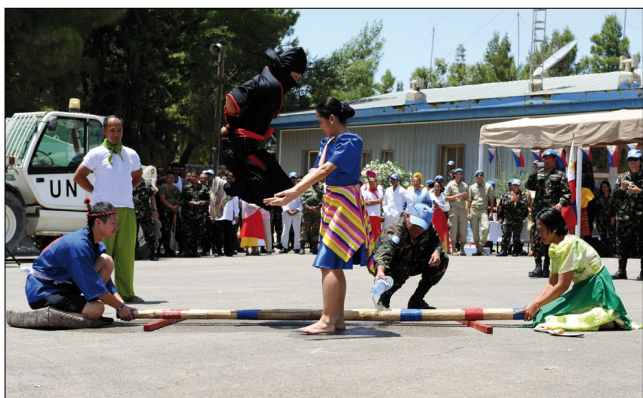
Combined PHILBATT and LOGBATT Tinikling dance