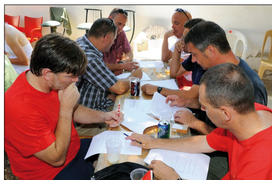
The Great Canadian Trivia Quiz