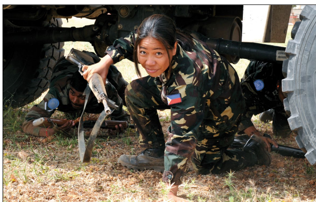
One of seven enlisted PHILBATT women

The female Peacekeepers of UNDOF have once again demonstrated their proficiency of military skills in the latest UNDOF Ultimate Challenge. The objective of this competition was to develop camaraderie, motivate soldiers to improve their core military skills and test their level of proficiency. Another primary objective is to promote Esprit de Corps among all those who contribute to the UNDOF mission. As such, nine teams were formed from a mix of nationalities and ranks, with one female competing on each team.