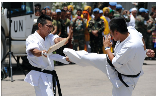
J-CON Karate demonstration