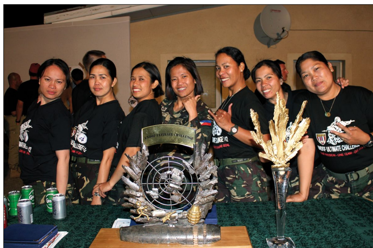
A pose with the few and chosen mighty enlisted women