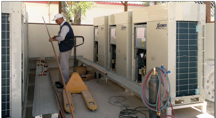
Air Condition & Heating – State of the Art

Although much has been already done, one of the greatest challenges remains ahead - that is the relocation of four UNDOF sections into the new work space. Through this final stage the project is being introduced to all sub-planning teams of UNDOF to determine the requirements, such as new interior furnishings and common area decorations.