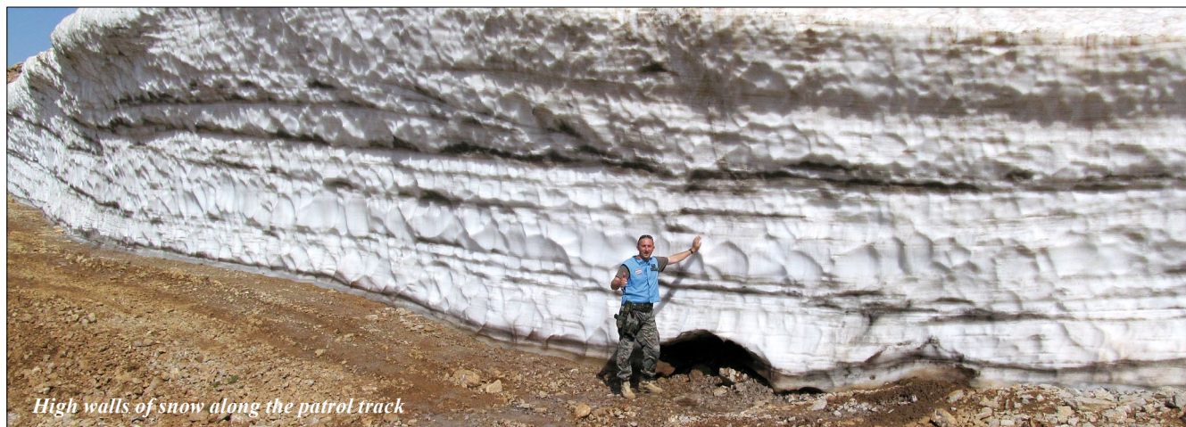
High walls of snow along the patrol track

This patrol is well known by all AUSBATT soldiers as one of the most demanding in UNDOF's Area of Separation, covering a twelve kilometer route at 1,500 meters elevation which must be completed in five and a half hours. Additionally, the temperature was abnormally high for this first seasonal patrol.