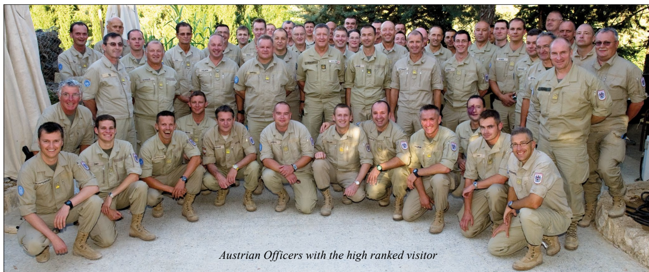
Austrian Officers with the high ranked visitor