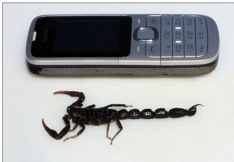
Size comparison between the scorpion and a cellphone

it was on the table inside a round little box. It is not so difficult to imagine my reaction upon opening the box to discover a large black scorpion instead to the wanted coffee-sweetener. To defend my soldier-honour I have to underline that for the first two seconds I was not aware that the “beast” was already dead... Nice joke! Now I know why the symbol of our team is a black scorpion and I am always careful in case any other little “friends” are chilling around. Stay safe!