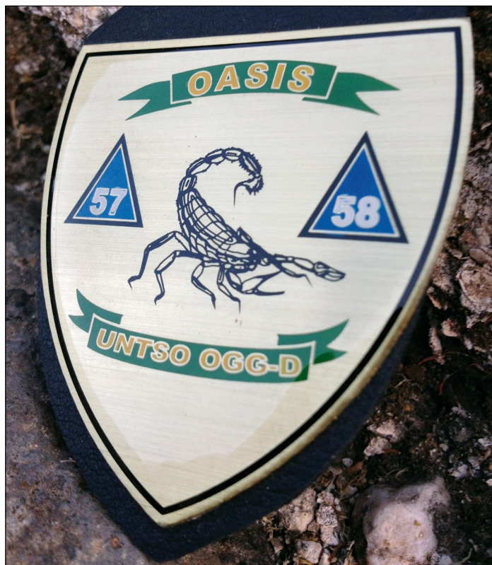
Team “Oasis” medal with scorpion symbol

The first coffee break with my new team members taught me that the lessons learned by the security and safety training are very important to avoid unwanted meetings with our poisonous little “friends”. When I asked for the sugar I was told that