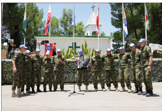
HRVCON performing the traditional Bećarac song