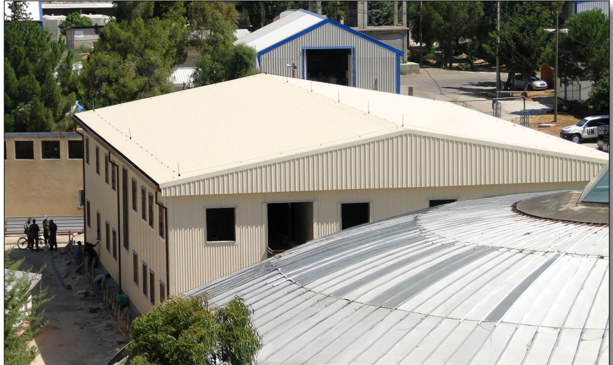
The roof with the lightning protection system

Worth mentioning is the redundancy planning and concealed wiring in the facility, which provides a second conduit system installed in every room. This will offer occupants greater flexibility in the arrangement of furnishings, as well as provide a back-up system for the future in terms of power and IT services. Some may have noticed the small metal hut adjacent to the new building, which contains a state of the art Variable Refrigerant Flow system for air conditioning and heating control. This system is up to 40% more energy efficient than common systems, and can be regulated from each room. Double-pane insulated tilt and turn windows will also be installed, making the building a highly energy efficient structure, while providing a comfortable climate zone for all users.