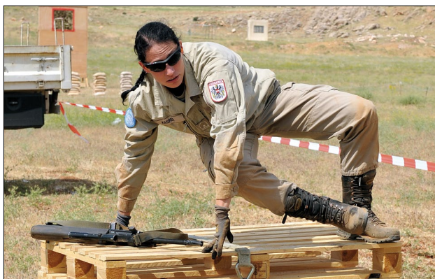
Women's power shown at UUC