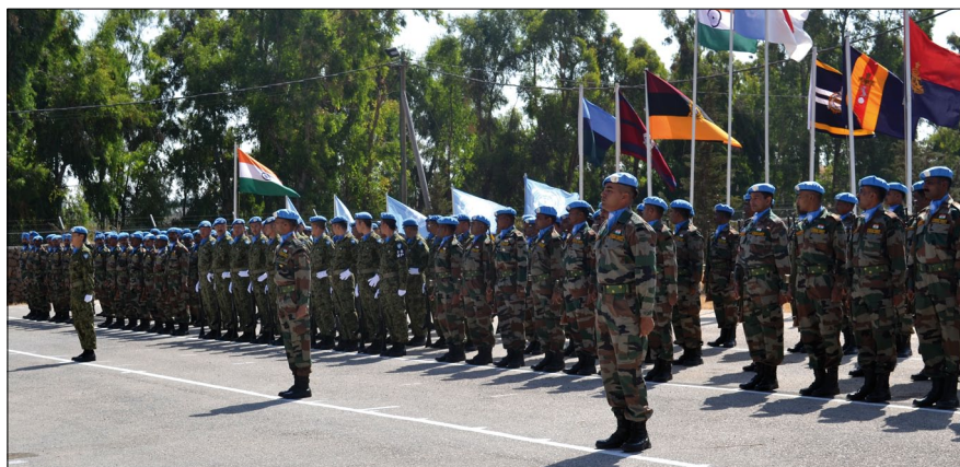
Indian and Japanese troops during the Medal Parade

Through the ages, the profession of arms has always held a place of pride in the Indian society. The officers and the men of the Indian Army are proud of their heritage and have an unmatched reputation to live up to. Their sense of commitment to duty inspires them to make sacrifices of the highest order to uphold the tradition of the Army. As in numerous and complex UN missions over the past five decades,