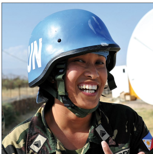
Smiling in spite of exertions