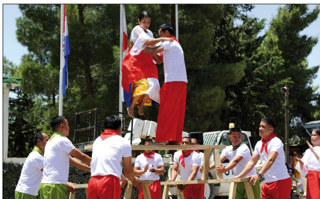
PHILBATT "Sayaw sa Bangko" performance