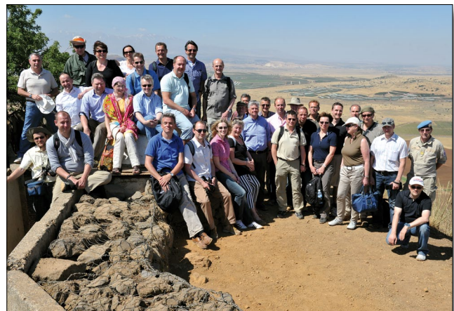
The German Academy Senior Course on Security Policies visited Camp Ziouani, OP 51 and Posn 22 (1 st Jun 2012)