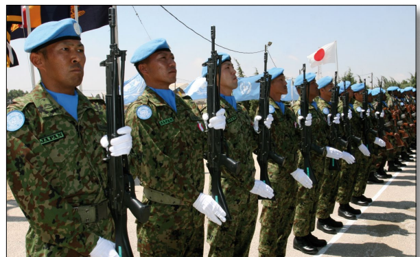
J-CON soldiers presenting arms