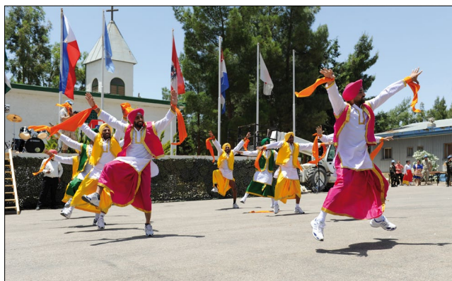
INDCON "Bhangra" folk dance