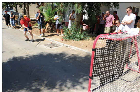
The winning shot at the "shooter tutor" goalie