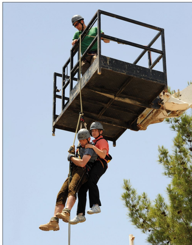
AUTCON "Rescue on the Mountain"

treass. Following some technical difficulties engaging the famous Austrian mountain called Manitou the demonstration was successfully completed with true Austrian resolve.