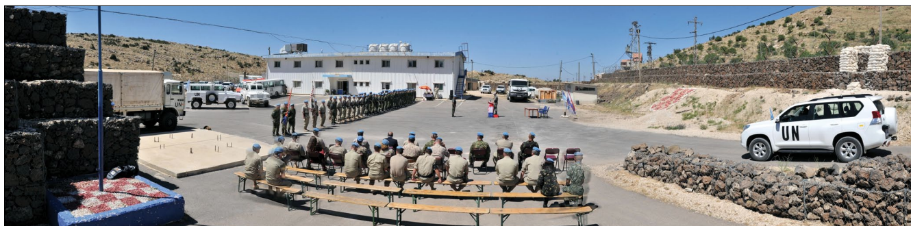
Panoramic view of Position 10

Article by Lt I Petar Guljas, DCO 3 rd Coy/AB