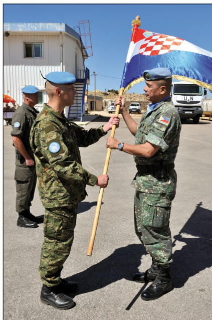
Handover the Croatian flag

After the Force Commander's inspection of the Guard of Honour, composed of Croatian and Austrian soldiers, the national anthem of Croatia was played with the support of Radio Gecko, the Austrian Camp Radio. The official ceremony was completed with the Force Com-