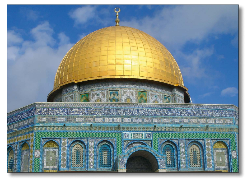
Jerusalem or Al Quds, at any time a special place to be discovered

One-day trips have been organized to visit various places in the mission area primarily to learn and appreciate the history, culture and geography of the host countries. In November last year, more than 80 military and civilian UNDOF personnel participated in trips to the Nimrod Fortress, to Damascus and the Sea of Galilee. In the first two months this year, more than 120 personnel had visited different historical places as a part of organized recreation trips. It enhanced their