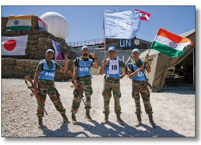
Mission accomplished: INDCON soldiers at Posn HH

U sually, it is a two day venture starting in Qunaitra at Posn 27 (2<sup>nd</sup> Coy/AB) with approximately 18 kilometers in undulated terrain to be dealt with before you finish the first stage at Posn 10 (3<sup>rd</sup> Coy/AB). But due to the prevailing situation in the AOS, the AUSBATT March had unfortunately to be cut down to the second day's challenging 22 km march in the unforgiving steep and rough terrain.