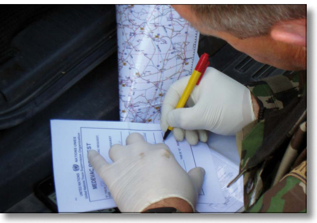
Documenting the medical situation

The test begins with a simulated visit by a high ranking officer that requires the UNMO to deliver safety and security briefings and an