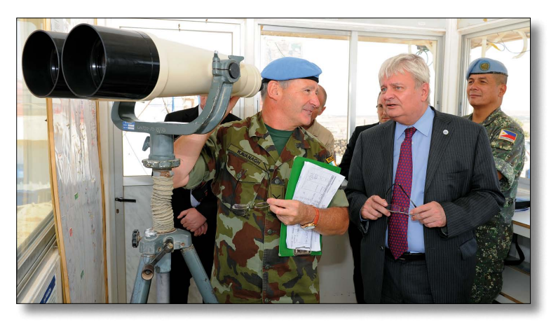
Monitoring at UNTSO OP 72