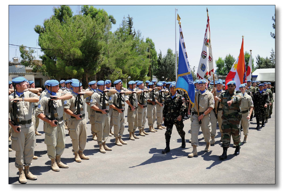
Parade square: Troops saluting the Colors

playing of the Indian National Anthem followed by a march-past of the Colors and troops in sight of the guests.