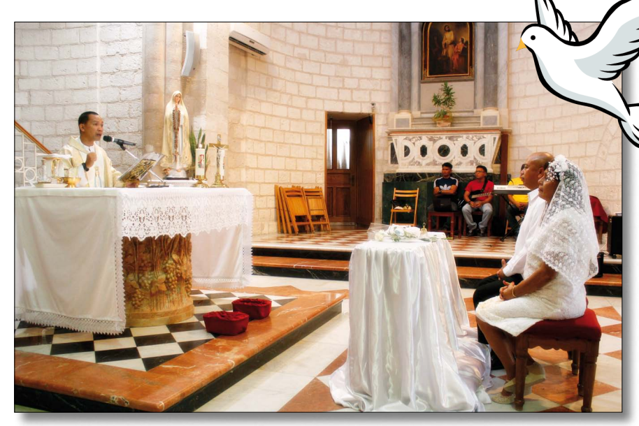
Solemnly celebrating Mass at the Wedding Church in Cana

The renewing of a marriage is a special act that shows the love and trust of a wife and a husband. The PHILBATT Commanding Officer and National Contingent Commander gave this promise again to his wife at a holy site in the mission area.