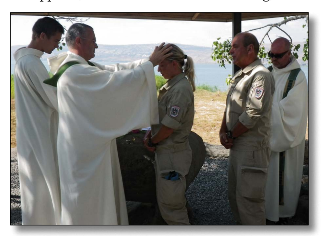
Confirmation ceremony at the "Jesus Lake"

The ceremony was then conducted within a Holy Mass, held by the Benedictine Brothers on the shore of the Sea of Galilee under the beautiful blue sky. About 100 pilgrims from various countries like Belgium, Germany, Israel, Italy, Philippines, Poland and Austria