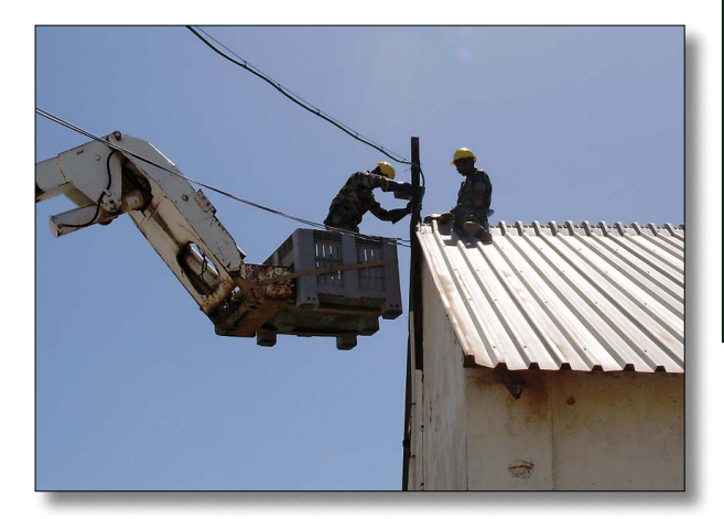
Electrical repair done by Indian Engineers