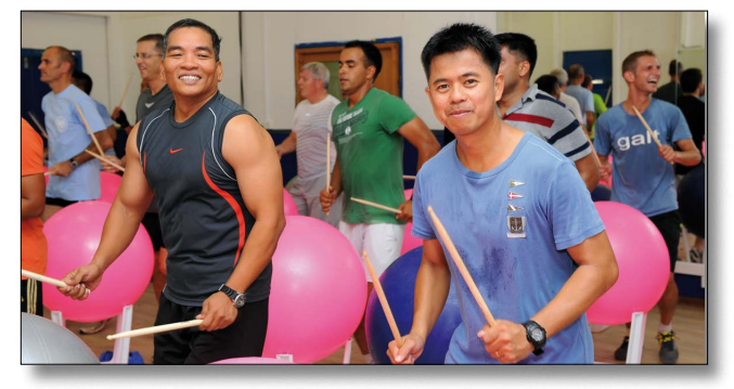
Drumming in the rhythm of disco music