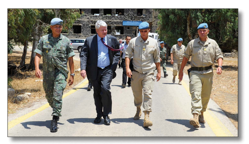
Line tour in Qunaitra