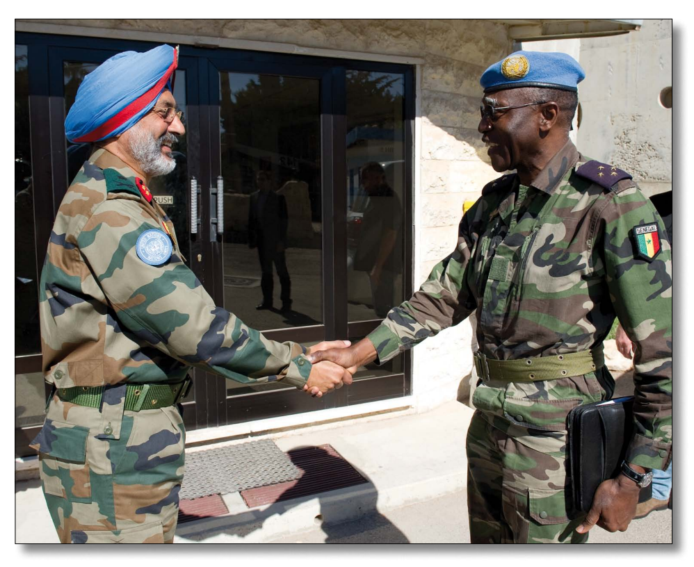
The new FC UNDOF welcomes the highly distinguished guest

LtGen Gaye was taken on a tour in the Area of Separation where he was shown the terrain and key features of interest to UNDOF. The tour also incorporated a visit to UNTSO OGG OP 72 and UNDOF Posn 37. The visit officially ended with a delicious Austrian lunch and the presentation of a memento by MGen Singha.