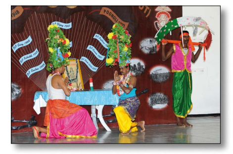
The show ...

The presentation was followed by a cultural display comprising of different traditional Indian dances: "Bhangra", a folk dance coming from the state of Punjab which has been practiced since 1880, "Lezium" from the state of Maharashtra, named after a wooden idiophone to