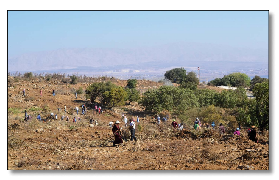
Syrian locals picking up pieces of woods in preparation for the upcoming winter seasons

tion by using screening operation techniques. This type of operation was conceptualized in order to allow a smooth wood picking for the populace and more importantly to prevent both sides from committing violations against the 1974 Geneva Agreement. Furthermore, it ensures the safety and security of