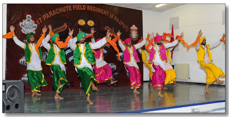
... with Indian traditional dances at Khetarpal Hall