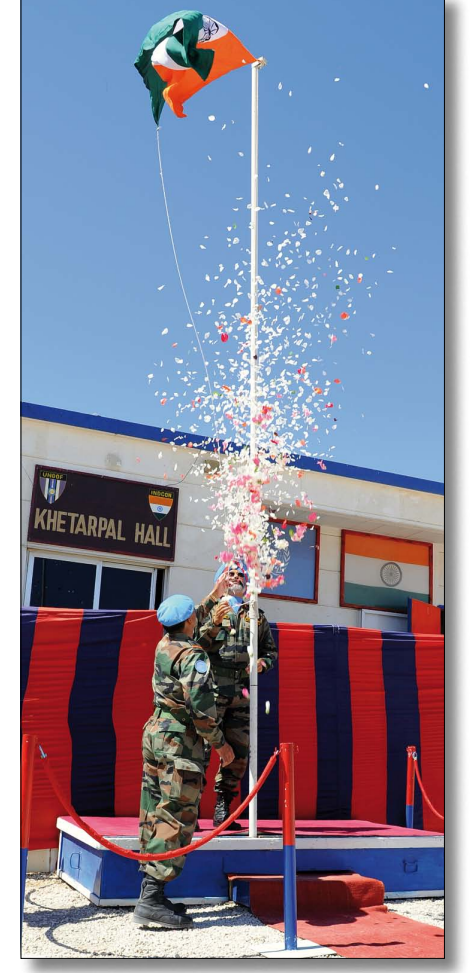
Unfurling of the Indian National Flag

which thin metal discs are fitted as well as the "Karagattam" from the state of Tamilnadu. That is a Tamil folk dance involving the balancing of clay or metal pots or other objects on the dancers head.