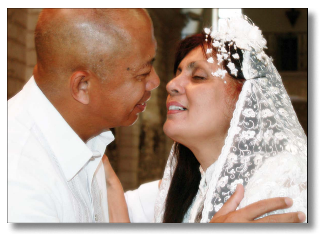
After saying "I do", and renewing their vows, the couple sealed the deal with a kiss