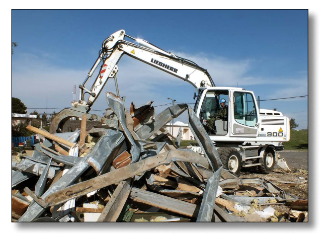
LOGBATT's efforts in the Facility Reduction Program