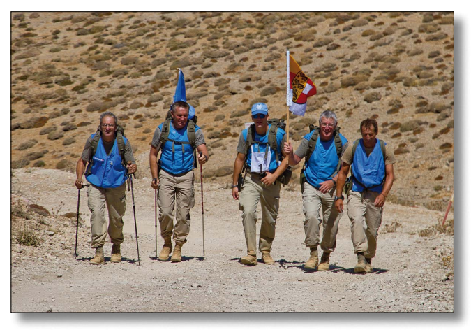
Powerful Austrians almost succeeded

Twice a year the AUSBATT March takes place. It gives all participants the opportunity to prove their fitness as well as their skills in patrolling through mountainous terrain. In mid-September the time has come when Mount Hermon called again.