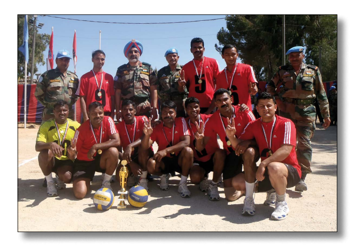
The Indian volleyball players were the best