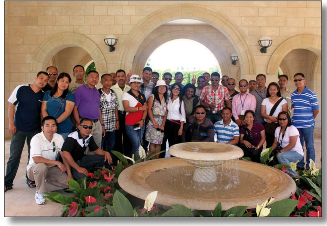
The Bahai Shrine gardens in Akko