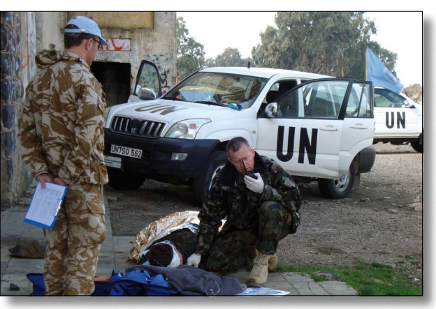
Call for UNDOF medical evacuation

mission essential tasks and medical responses for their summative operational effectiveness test: the "Chief's Challenge". That is a five hour long testing sequence that cov-