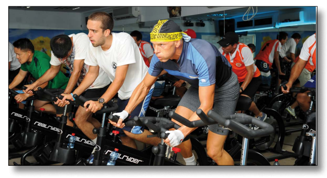
Biking experience indoor ...