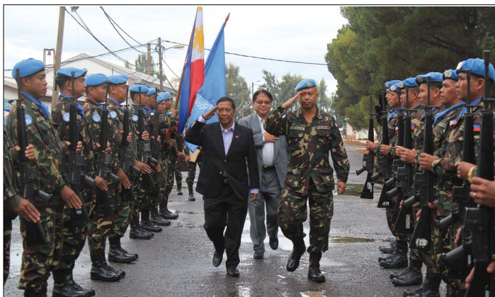
Guard of Honor for the Vice President