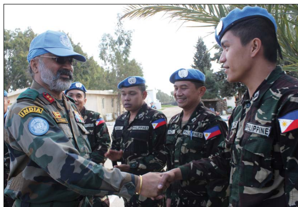
Christmas wishes at Posn 80

Holy Mass at Posn 27 and even got a present from the Padre! We enjoyed some traditional spiced wine, warm stuffed apple and wonderful cakes. At Posn 10, we had the customary Croatian Christmas cake. The Filipinos had organized a very entertaining show which