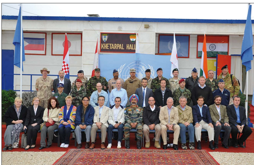
Ambassadors and Military Attachés with FC UNDOF in front of Khetarpal Hall

Camp Ziouani to UNTSO Observation Post 51 for an introduction briefing after lunch. Unfortunately, due to the security situation there, it was not possible to provide the scheduled introduction and Observation Post tour. Instead, the visitors were brought to the Mt. Bentall lookout and because the weather was gracious for at least twenty min-