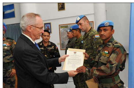
Awarding the Letter of Recommendation