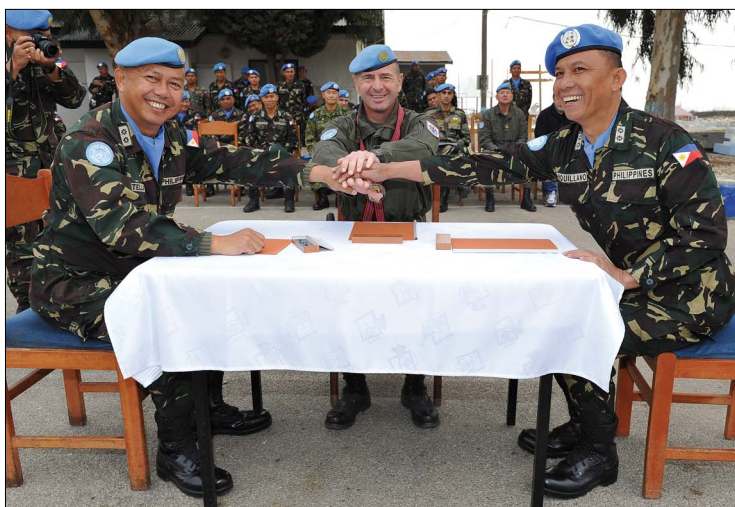
Signing the certificates and sealing with hands