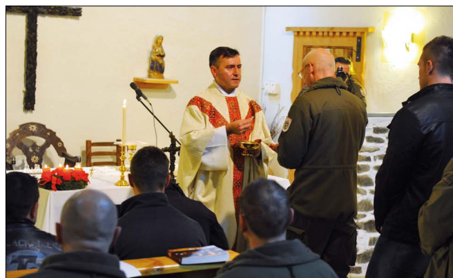
Holy Mass in St. Pauls Church in Camp Faouar

I therefore wish all UNDOF soldiers in the Golan Heights luck and the blessing of God Almighty!