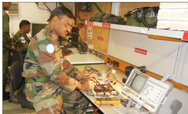
A signaler specialist at work

After completion of the pre-induction formalities and having been trained in detail about United Nations, the Blue Helmets and UNDOF, we felt ready to take on the new assignment head-on. Finally, on 28 th Sep 12, we boarded the flight from Indira Gandhi International Airport at New Delhi and after almost ten hours of travel in a cramped space, we landed at Ben Gurion Airport. There we were highly awaited by the outgoing contingent followed by a warm welcome by soldiers of INDCON, J-CON and PHILBATT at Camp Ziouani to the tunes of the “Jai ho”. This was our first opportunity to interact with troops from other nations and the warmth and friendliness soon made us forget our language barriers.