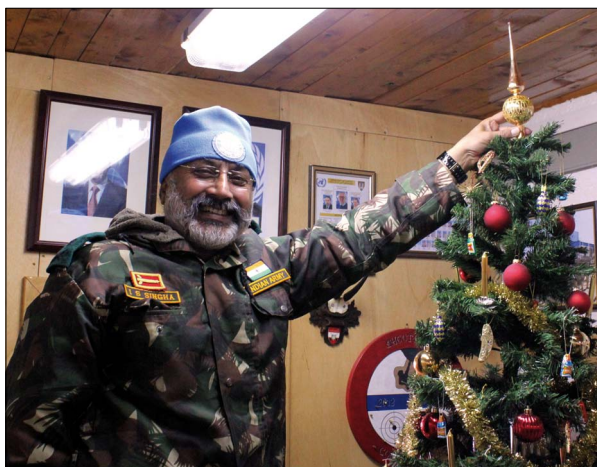
Fixing the Christmas tree star at Posn Hermon Base