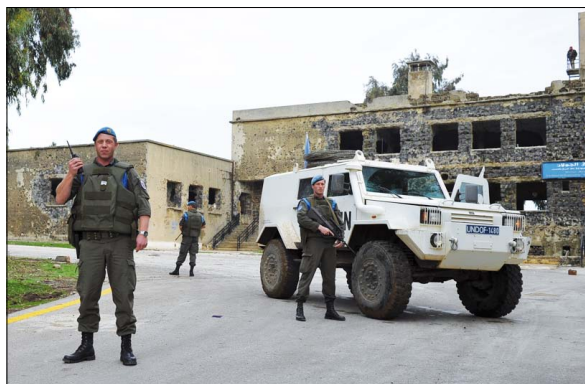
Roadblock in Qunaitra

the third platoon will support evacuations of UN positions and Outposts or function as their reinforcement if necessary. Besides daily patrolling all over the Area of Sepa-