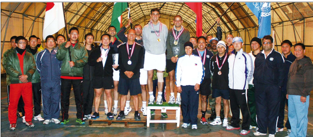
Professional players and organizers of the badminton tourney