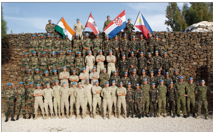
The reinforced FHQ Coy