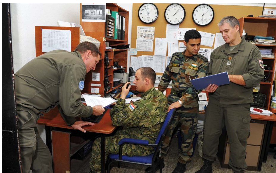
Successful teamwork in JOC UNDOF

As I mentioned before, there are bad and good parts in our business. The biggest challenge being faced by a Ops Officer is that his job not