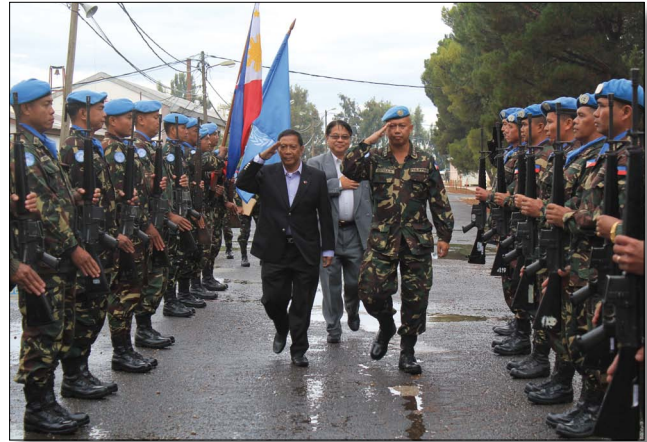
Mr. Hon. Jejomar C. Binay, Vice President Republic of the Philippines, visited Camp Ziouani (26 th Oct 2012)