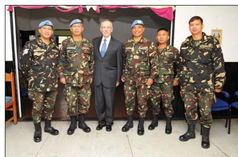
With Filipino officers at Posn 60