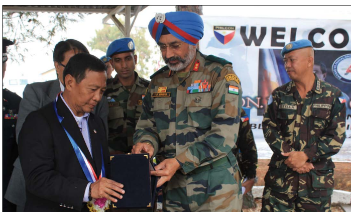
UNDOF memento from the Force Commander