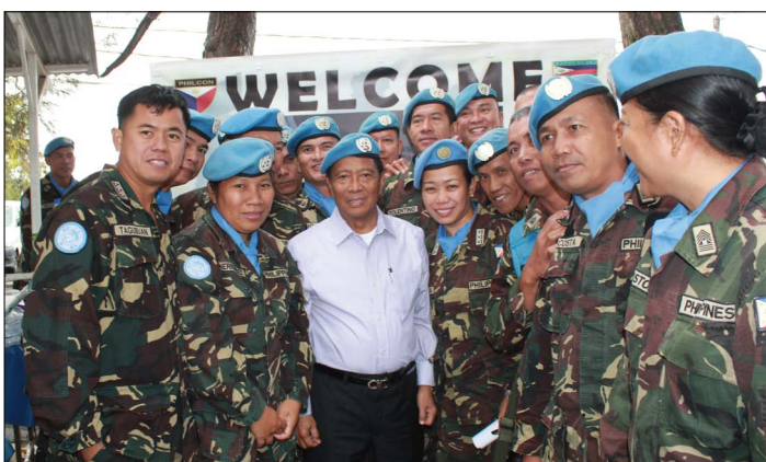
The Vice President among Filipino UN peacekeepers