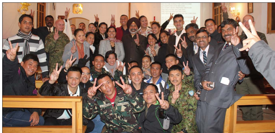
Holy Mass on Christmas Eve in church Camp Ziouani