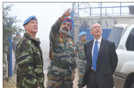
OGG Briefing at UNTSO OP 72