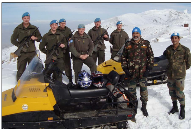
With the Snow-Scooter to Posn Hermon South