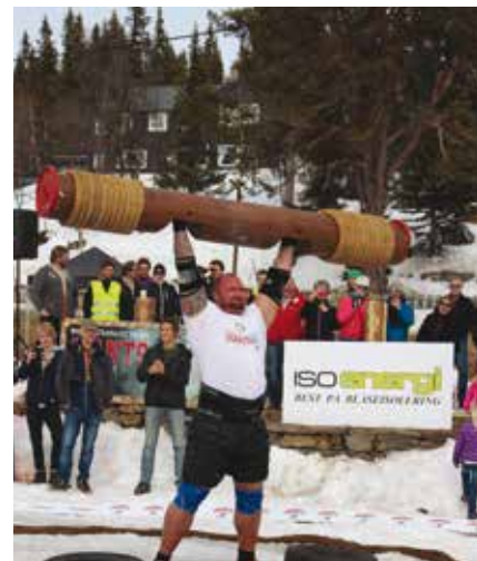
130 kg log press...more painful than it appears

After the competition there was a traditional "Viking blot" (party) with Mjoed (beer brewed on honey) and a lot of happy Vikings.