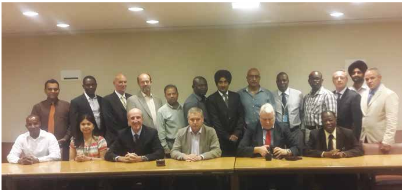
The Panel of seasoned COE Staff from missions across the globe

An opportunity to upgrade the skill sets required while tenanting the appointment of Deputy Chief of Integrated Support Services (DCISS) was a welcomed one. A training workshop on Contingent Owned Equipment (COE) in New York from 22 – 27 Jun 14 was not only professionally stimulating but also a challenging one, for I was one of the two military officers on the Panel of Seasoned COE Staff from missions across the globe. Guidance from the mission, coupled with self-study gave the base foundation for the event.