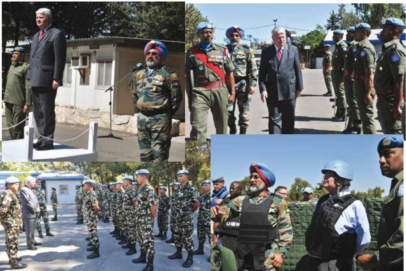
From top left(clockwise): USG, DPKO Mr Herve Ladsous welcomed with a guard of honour from FIJIBATT. Mr Herve Ladsous inspects the guards. Mr Ladsous addresses NEPCON soldiers. FC with the USG at Position 27.

In Camp Faouar, Mr. Ladsous was given detailed briefings on political, operations, security and logistics issues concerning UNDOF. On the first night of his visit, Mr. Ladsous saw firsthand the functioning of the JOC and the Crisis Management Group during the exchange of fire across the AOS that precipitated the midnight air raid by the Israeli Air Force on Syrian positions. Mr. Ladsous praised the manner in which we went about our job with quiet efficiency and were able to diffuse the crisis. He was very pleased to get a firsthand experience in a crisis situation in the field. On Day Two of his visit the USG attended the Morning Brief and the Town Hall Meeting wherein he presented the Peacekeepers of the Month Award to military and civilian staff. The visit culminated with the Line Tour to UN Position 27, 60 and OP 56. Overall, the USG's visit to the Mission was holistic and eventful, one that brought to the fore the new challenges that lie ahead for UNDOF. The USG made special efforts to address troops from each TCC and also had a Town Hall meeting with the national and international staff in three locations.