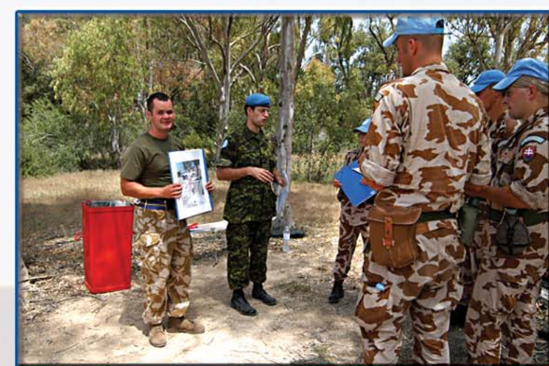
Rules of Engagement