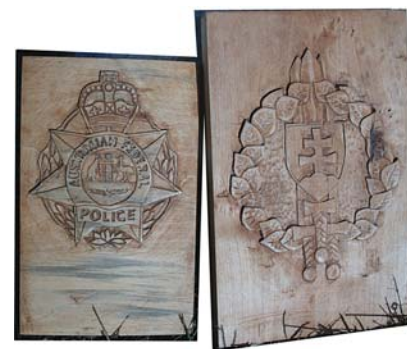
Plaques ordered by the Australian Police