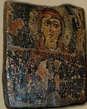
Room 1: 7 – St. Nicholas