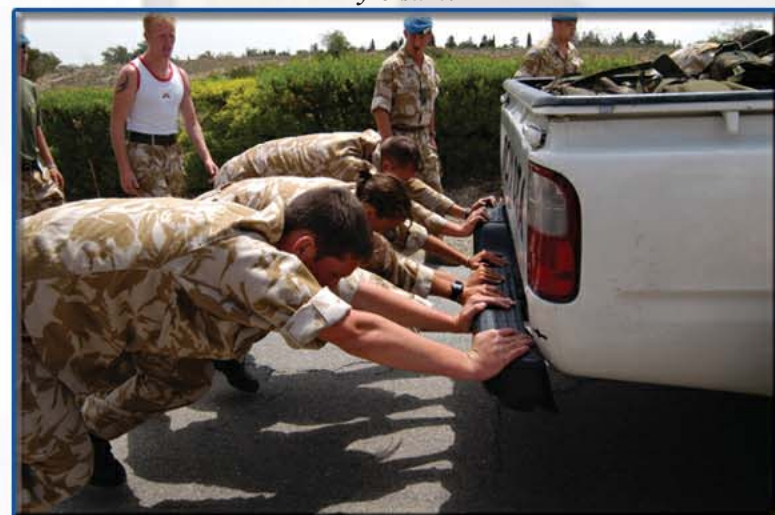
Push and Shove