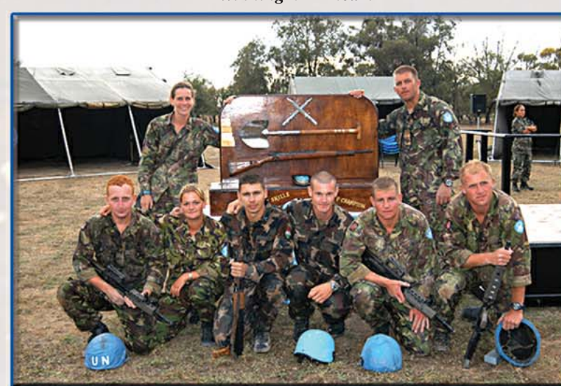
Winning MFR team