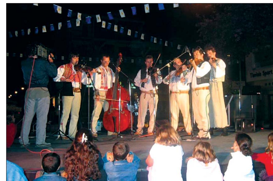
Playing in the new Europe

Meantime, back "home", the Slovak nation celebrated the EU accession and the world ice hockey championship finals. Lots of young people attended the celebrations in cities throughout Slovakia wearing "tricolour" scarfs and waving Slovak flags. UNFICYP's Slovak peacekeepers also celebrated. "We have been waiting for this day for a long time. Now we hope to be able to use the euro very soon", they said.