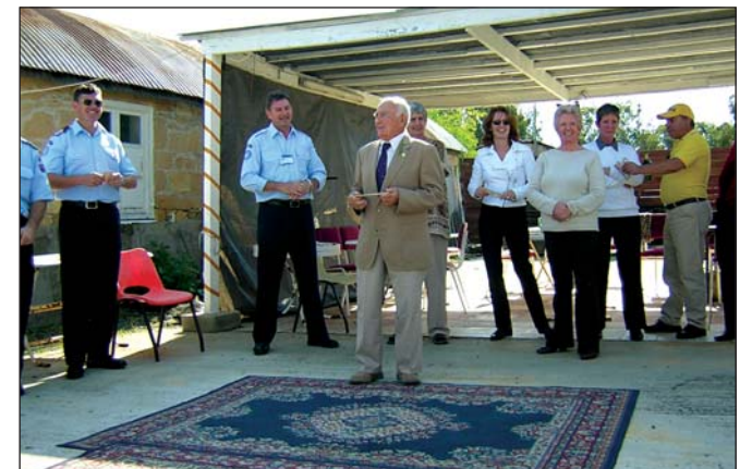
Traditional ANZAC day game of “Two-Up”