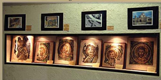
Room 2: Virgin Kanakaria mosaics

other items representative of the Cypriot minor arts. Also encountered here are more icons and a number of royal or sanctuary doors – the painted doors that are fixed on the Iconostasis (the icon screen that separates the nave of the church from the holy of holies).