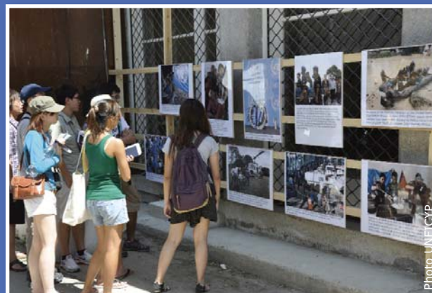
Passers-by viewing exhibition to mark International Day of United Nations Peacekeepers

This year's commemorative ceremonies come at a time when the services of UN peacekeepers are in greater demand than ever. There are more than 124,000 peacekeepers, including 100,000 military and police personnel from 115 countries, serving in 16 operations on four continents. This broad-based participation not only bolsters the strength of UN operations, but it is also a clear demonstration of widespread respect for, dependence on and confidence in United Nations Peacekeeping.