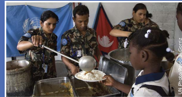
Nepalese peacekeepers with the United Nations Stabilization Mission in Haiti (MINUSTAH) carry out Civil-Military Coordination Activities (CIMIC), serving hot meals to earthquake survivors at a parish in Mirebalais, located on Haiti's Plateau Central. 18 February 2010 Mirebalais, Haiti.