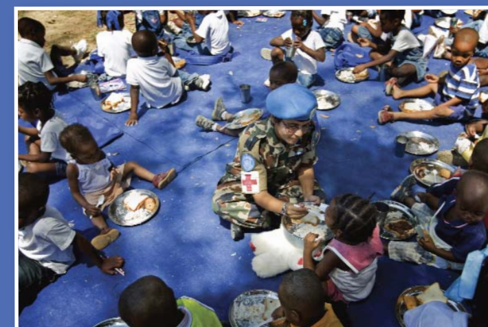
A military officer of the United Nations Stabilization Mission in Haiti (MINUSTAH) gives food to child. 20 March 2009 Port-au-Prince, Haiti.