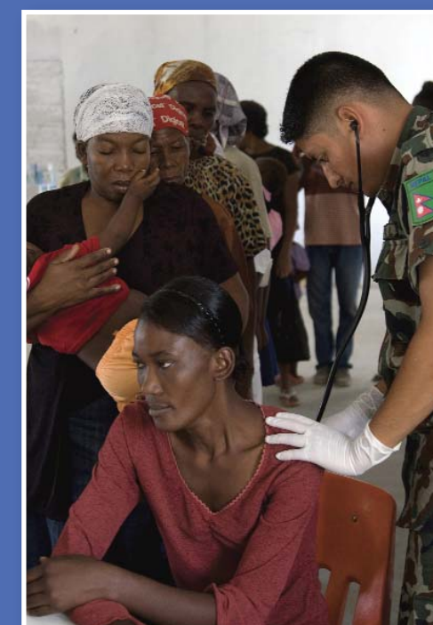
Nepalese peacekeepers with the United Nations Stabilization Mission in Haiti (MINUSTAH) carry out Civil-Military Coordination Activities (CIMIC), providing medical assistance to earthquake refugees at a parish in Mirebalais. 18 February 2010 Mirebalais, Haiti.