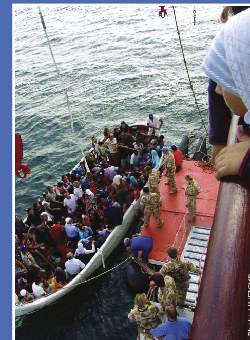
UNFICYP peacekeepers during the evacuation of civilians from war-torn southern Lebanon to Cyprus in July 2006.