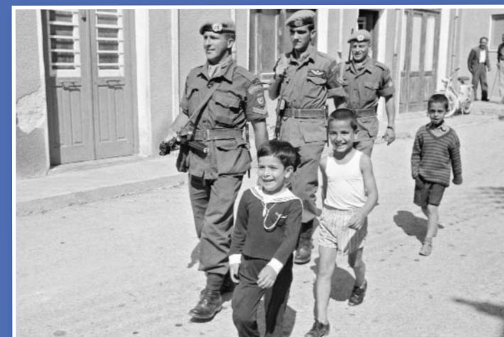
Children march with Canadian peacekeepers on patrol in Kyrenia in April 1964.