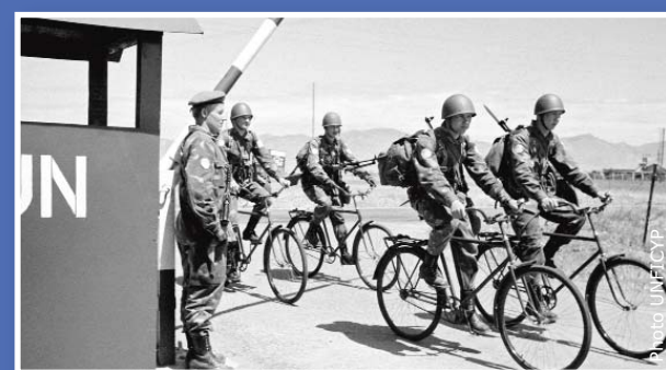
UNFICYP Finnish soldiers in May 1964 cycling to Nicosia from Dhekelia, a distance of over 190 km.