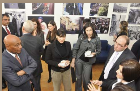
A delegation from the Cyprus Ministry of Foreign Affairs was hosted by the Chief of Mission Tayé-Brook Zerihoun on 12 April. The delegation was given a tour of the old Nicosia Airport and a briefing on the work of UNFICYP.