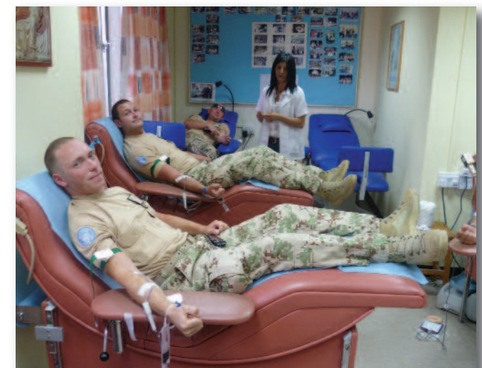
Slovak soldiers donating blood at Larnaca General Hospital

Sector 4 peacekeepers have been donating blood since SLOVCON arrived in Cyprus in 2001. The inspiration then and now continues to be the satisfaction of helping those in urgent need of transfusions.