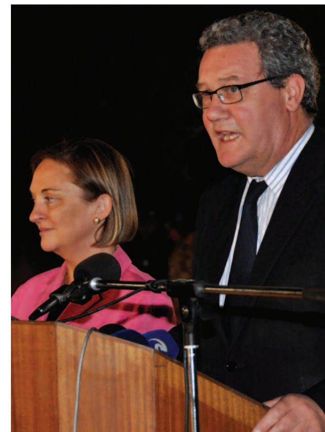
SASG Alexander Downer addressing media following the leaders dinner

Looking ahead, Mr. Downer said the talks would continue through the upcoming Greek