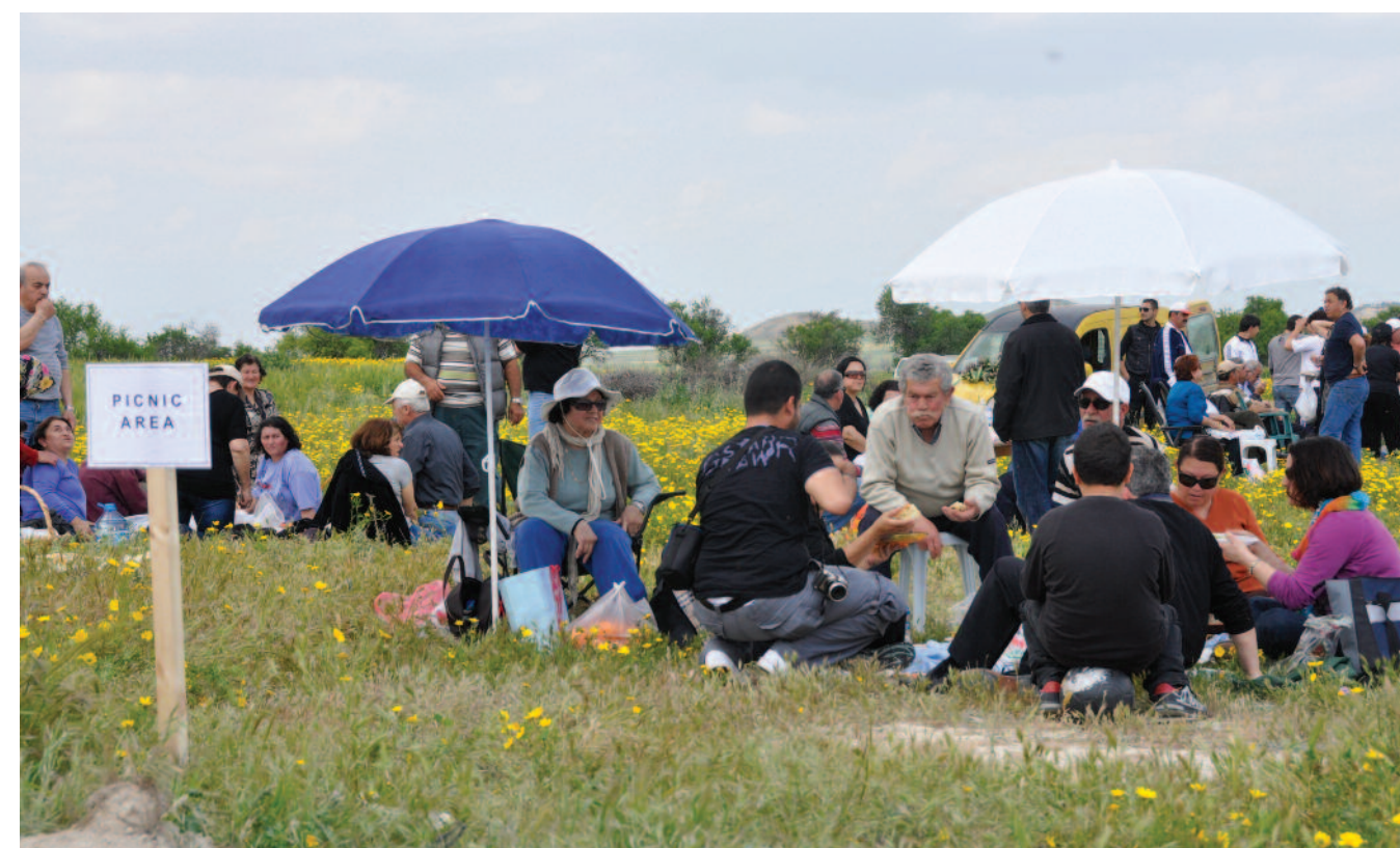
Villagers of Louroujina and Athienou enjoying a bi-communal picnic inside the buffer zone